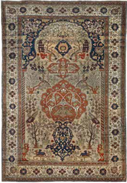
386 A MOHTASHAM KASHAN RUG TP Central Persia, 197cm x 134cm £2,000 - 3,000 €2,300 - 3,500