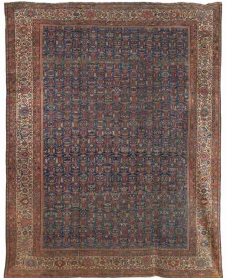
379 A FERAGHAN CARPET TP West Persia, 459cm x 361cm £2,000 - 3,000 €2,300 - 3,500