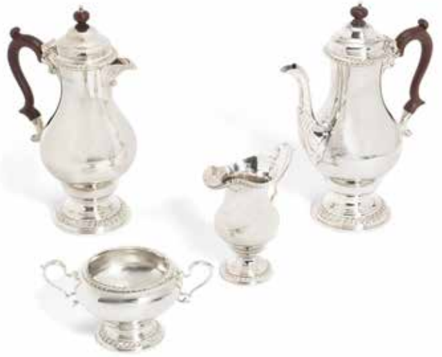
178 A SILVER FOUR-PIECE SILVER TEA SERVICE by Asprey & Co Ltd, London 1969 In the 18th century style, the pots with wooden handles and finials, with gadroon borders, height of coffee pot 28cm, weight total 77.5oz. (4) £1,000 - 1,200 €1,200 - 1,400