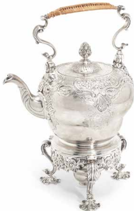
186 A GEORGE II SILVER TEA KETTLE AND STAND by Humphrey Payne, London 1744 Inverted baluster form, with a raffia-wrapped swing-handle and bud finial, the surface part-chased with Rococo decoration, the stand with swags of masks and scrolls, with a later burner, engraved with the arms of MORSHEAD of Trenant Park, Cornwall and later of Forest Lodge, Binfield, Bracknell, Berks, height excluding handle 26cm, weight total 68oz. £1,500 - 2,000 €1,700 - 2,300 See Bonhams.com for further footnote on this lot