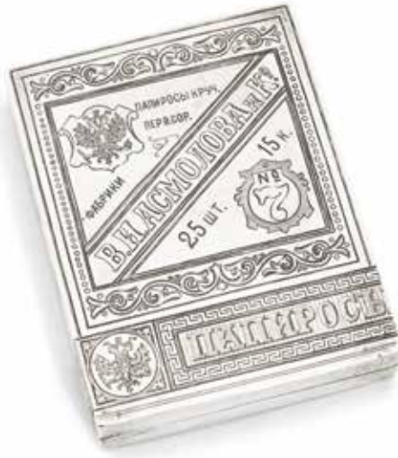
67 A RUSSIAN TROMPE L'OEIL SILVER CIGAR CASE maker's mark MA, Moscow circa 1880 Modelled as an 'Asmolova' brand cigarette packet, the interior gilt, length 11cm, weight 6.5oz. £1,000 - 1,500 €1,200 - 1,700