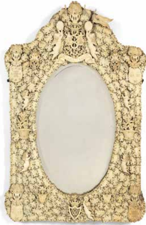
466 A GOOD LATE 19TH CENTURY DIEPPE CARVED BONE MIRROR in the 17th century style the oval bevelled plate set within a leafy surround with applied winged putti, floral basket and French heraldic shields surmounted by an elaborate figural armorial coat of arms inscribed MONTJOIE ST DENIS , 85cm x 52cm £700 - 1,000 €810 - 1,200