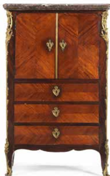
433 A LOUIS XV GILT BRONZE MOUNTED KINGWOOD AND MAHOGANY CABINET TP the marble top above a pair of doors enclosing a fitted interior over three drawers, stamped: 'JME L. (Leonard) Boudin', 74cm wide x 37cm deep x 117cm high, (29in wide x 14 1/2in deep x 46in high) £1,500 - 2,000 €1,700 - 2,300 See Bonhams.com for further footnote on this lot