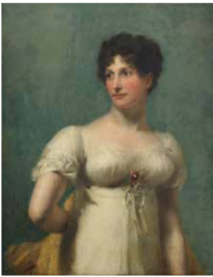
25 FOLLOWER OF SIR THOMAS LAWRENCE P.R.A. (1769-1830) Portrait of a young lady in a white dress oil on canvas 91.4 x 71.1cm (36 x 28in). unframed £500 - 700 €580 - 810