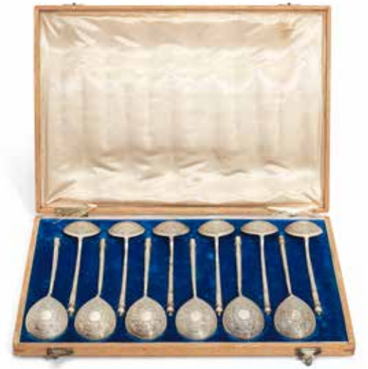
68 A CASED SET OF TWELVE LATE 19TH CENTURY RUSSIAN SILVER-GILT SPOONS maker's mark possibly I/H.A, Moscow 1893 Reverse of bowls decorated with a polished circular medallion, chased flowerheads, berries and foliate scrolls, enclosed by a Greek-key fret band, part twisted stems with reeded ends and tapering cylindrical finials. £600 - 800 €700 - 930