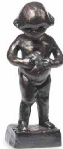
307 20TH CENTURY CONTINENTAL SCHOOL, POSSIBLY SWEDISH: A PATINATED BRONZE FIGURE OF YOUNG GIRL on rectangular base, brown patina, 21cm high