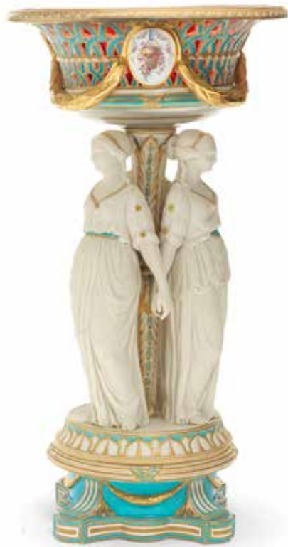
406 A FINE COPELAND CENTREPIECE AND CRANBERRY GLASS LINER, CIRCA 1870 picked out in turquoise and gold, the circular basket painted with three reserve panels of baskets of flowers supported by three parian ladies, 46cm high, applied and puce printed marks (2) £1,000 - 1,200 €1,200 - 1,400 See Bonhams.com for further footnote on this lot