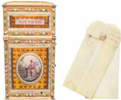
93 A LATE 18TH/EARLY 19TH CENTURY GOLD AND ENAMELLED AIDE MEMOIRE apparently unmarked, possibly Swiss Tapering form, two enamelled panels depicting Venus, pearlescent enamel and translucent amber enamel, the cover with the mottos "Souvenir" and "D'Amité", fitted with an ivory writing slip, height 8cm, weight 61gms. £2,000 - 3,000 €2,300 - 3,500