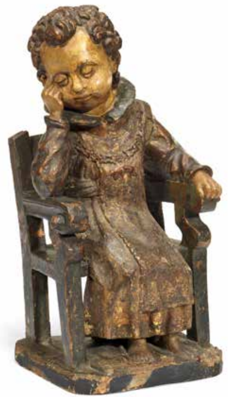
431 A LATE 16TH / EARLY 17TH CENTURY SPANISH CARVED AND GILT AND POLYCHROME DECORATED FIGURE OF THE SLEEPING CHRIST CHILD seated on a throne and dressed in the attire of the 'infante' of Spain and wearing a chain with order of the Golden Fleece, 42cm high £1,000 - 1,500 €1,200 - 1,700 See Bonhams.com for further footnote on this lot