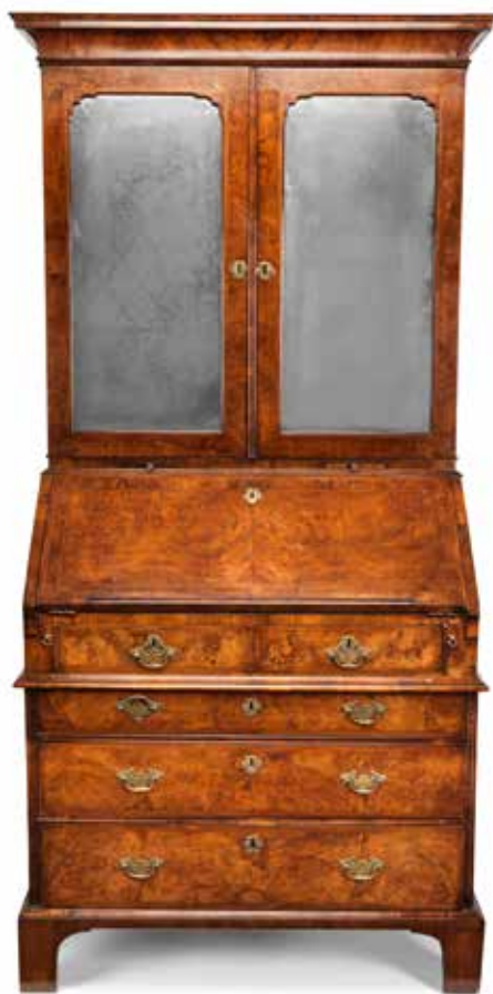
442 A GEORGE I WALNUT, BURR WALNUT AND TP FEATHERBANDED BUREAU CABINET the pair of bevelled mirror inset doors enclosing three adjustable shelves, the fall enclosing six pigeon holes, six drawers, bookends and a door, 98cm wide x 62cm deep x 204cm high, (38 1/2in wide x 24in deep x 80in high) £1,500 - 2,000 €1,700 - 2,300