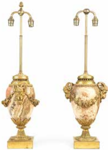
395 A PAIR OF EARLY 20TH CENTURY FRENCH GILT TP BRONZE AND BROWN VEINED MARBLE URN LAMPBASES in the Louis XVI style the pedestal urn bodies with rams head mask handles united by floral swagged garlands, fitted for electricity, 72cm high including fittings (2) £600 - 800 €700 - 930