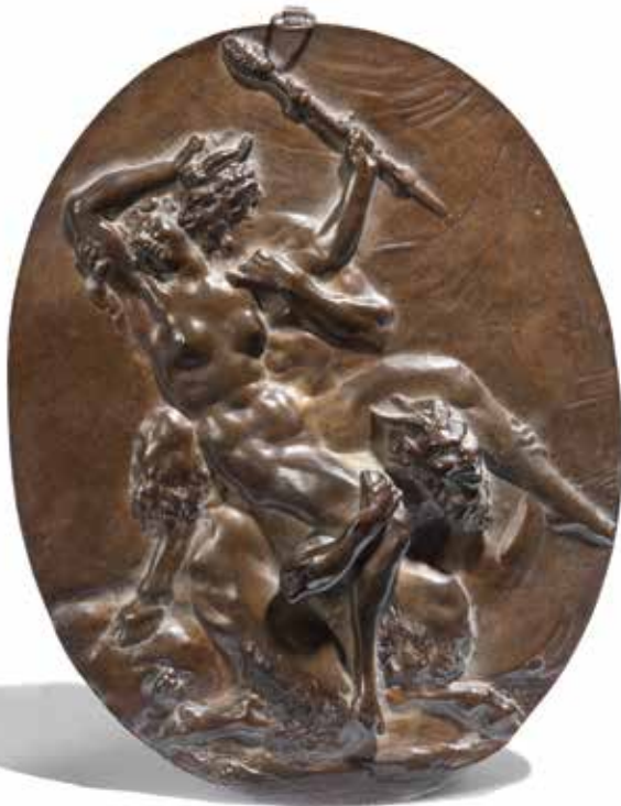
350 A PATINATED BRONZE OVAL PLAQUE OF A BACCHANTE AND TWO SATYRS possibly 18th / 19th century in the manner of Jacopo d'Antonio Sansovino, 24cm high £400 - 600 €460 - 700