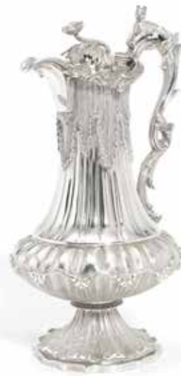
165 A GOOD WILLIAM IV SILVER WINE EWER by Charles Reilly & George Storer, London 1833 Lobed baluster form, the lid with a floral sprig finial, the acanthus leaf handle with a reclining big cat atop, the body and foot with textured acanthus leaf decoration, height 29cm, weight 27oz. £1,000 - 1,500 €1,200 - 1,700