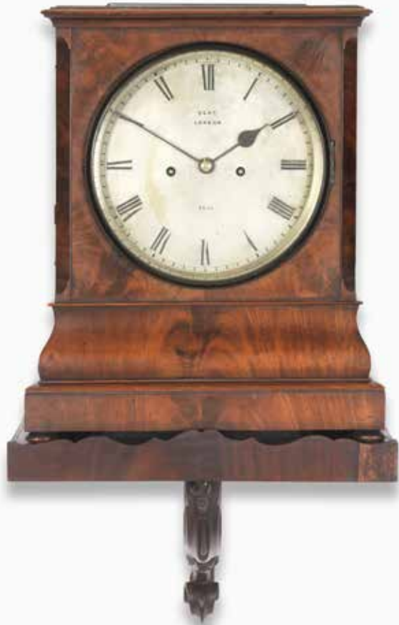
542 A 19TH CENTURY MAHOGANY BRACKET CLOCK ON ASSOCIATED BRACKET TP signed Dent, London, No.1856 the five glass case with signed and numbered 7.25 silvered Roman dial, the substantial two train chain fusee four pillar movement with anchor escapement and rack strike on a coiled gong and with 'London pattern' pendulum, 38cm high (2) £2,000 - 3,000 €2,300 - 3,500