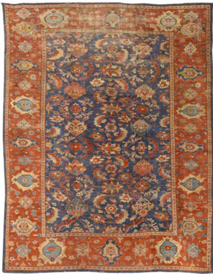
446 A ZEIGLAR CARPET, TP North West Persia 514cm x 405cm £2,000 - 3,000 €2,300 - 3,500

See Bonhams.com for further footnote on this lot