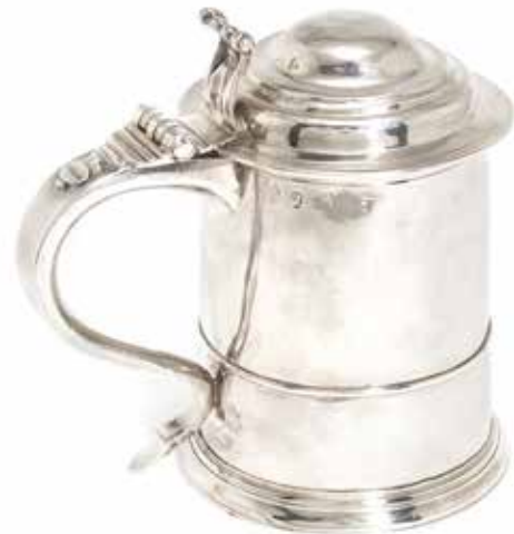
153 A GEORGE I SILVER TANKARD by Robert Timbrell & Joseph Bell I, London 1714 Straight-sided tapering form, the domed lid with a spiralling thumb-piece, engraved with a crest, height 17cm, weight 21oz. £2,000 - 3,000 €2,300 - 3,500