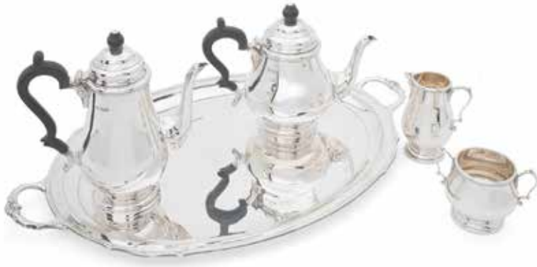
177 A FOUR-PIECE SILVER TEA AND COFFEE SERVICE AND TRAY by Cooper Bros, Sheffield 1978 Baluster form, the pots with wooden handles and finials, the shaped-oval tray with two handles, length of tray handle to handle 61cm, weight total 147oz. (5) £2,500 - 3,000 €2,900 - 3,500