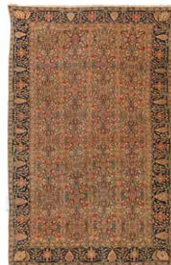
455 A KIRMAN RUG

TP Central Persia, 113cm x 163cm £500 - 700 €580 - 810