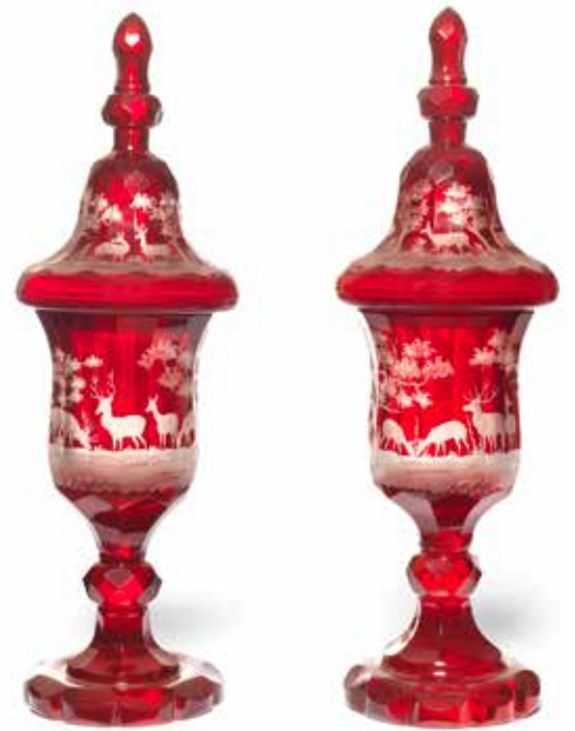
407 A PAIR OF BOHEMIAN RUBY FLASHED CUT GLASS PEDESTAL CUPS AND COVERS probably late 19th / early 20th century of faceted flared knopped pedestal form, the ogee covers with similar knopped faceted finials on petal edged circular bases, each typically etched with deer landscapes, 53cm high overall (2) £1,000 - 1,500 €1,200 - 1,700