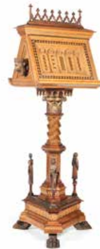
426 A VICTORIAN GOTHIC REVIVAL MAHOGANY, OLIVEWOOD, PURPLEWOOD AND TP TUNBRIDGEWARE PARQUETRY LECTERN some elements later with trefoil, quatrefoil and cusped arch tracery, the revolving top on a hexagonal column, the triform base surmounted by three carved ecclesiastical figures, 159cm high. £800 - 1,200 €930 - 1,400