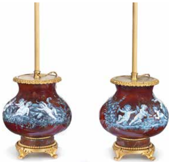
423 A PAIR OF LATE 19TH CENTURY / EARLY 20TH CENTURY GILT BRONZE MOUNTED TP CONTINENTAL EARTHENWARE VASES later converted to lampbases the bulbous claret coloured bodies decorated with Pâte-sur-pâte figural decoration depicting playful putti, on scroll footed bases, fitted for electricity, 55cm high overall (2) £2,000 - 3,000 €2,300 - 3,500