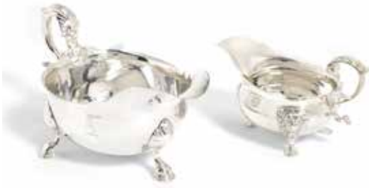
159 A GEORGE II SILVER SAUCE BOAT by Richard Brown, London 1739 On three hoof feet, crested, length 18cm; together with a cream boat, London 1738; a pepper, London 1796; a wine funnel strainer, London circa 1830; a coffee pot, by Tiffany, Young & Ellis , weight total 33.5oz. (5) £800 - 1,200 €930 - 1,400