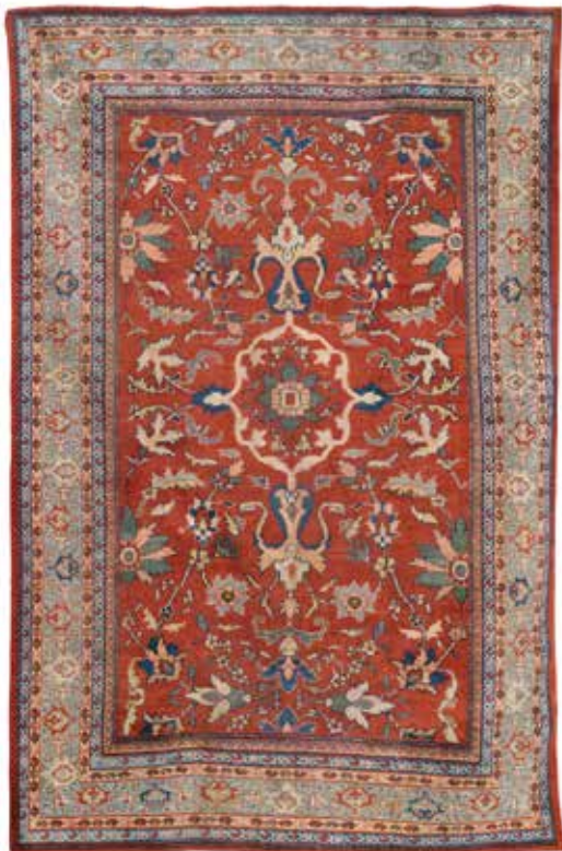
384 A MAHAL CARPET

TP South Caucasus, 220cm x 142cm £1,500 - 2,000 €1,700 - 2,300