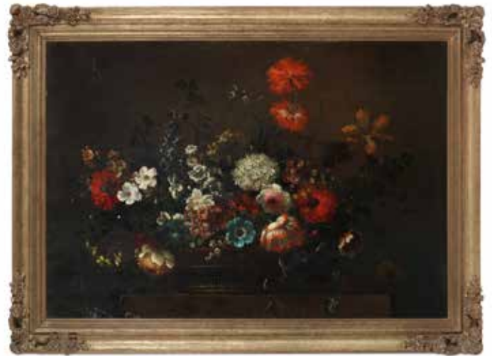
50 MANNER OF JEAN-BAPTISTE MONNOYER, 20TH CENTURY Still life of flowers in a basket oil on canvas 69.5 x 100.5cm (27 3/8 x 39 9/16in). £2,000 - 3,000 €2,300 - 3,500

See Bonhams.com for further footnote on this lot