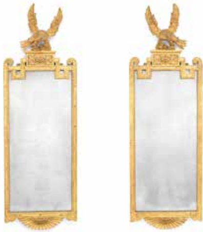
491 A PAIR OF GILTWOOD PIER MIRRORS TP in the Neoclassical style each plate encompassed by simulated bamboo surrounds, below a patera tablet surmounted by an eagle cresting, the associated crestings probably early 19th century, the mirror frames later, 138cm high x 44cm wide. (2) £700 - 900 €810 - 1,000