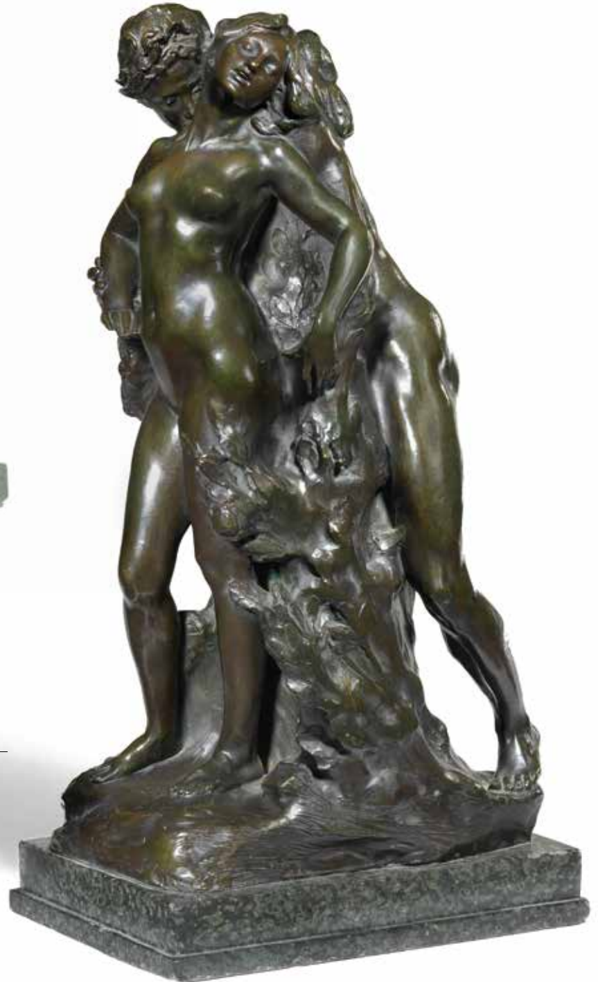
226 FRANCIS DERWENT WOOD (BRITISH, 1871-1926): A PATINATED BRONZE FIGURAL GROUP OF DAPHNE AND APOLLO the amorous nude couple standing beside a tree stump on naturalistic oval base, signed Derwent Wood RA , on green marble rectangular plinth, the figure, 71cm high, 74cm high overall £8,000 - 12,000 €9,300 - 14,000

See Bonhams.com for further footnote on this lot