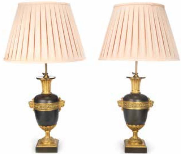
362 A PAIR OF 19TH CENTURY PATINATED AND GILT BRONZE LAMPBASES TP in the Louis XVI style, later adapted from garniture urns the ovoid bodies with pierced borders and female maskheads below fluted necks, on stiff leaf and floriate mounted circular socles and moulded square bases, fitted for electricity together with two cream silk shades, the urns, 46cm high, 92cm high overall (4) £800 - 1,200 €930 - 1,400