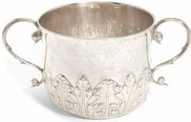
150 A JAMES II SILVER PORRINGER maker's mark SN, London 1686 With two scroll handles, the body decorated with rising acanthus leaves, diameter 11cm, weight 7oz. £1,000 - 1,500 €1,200 - 1,700