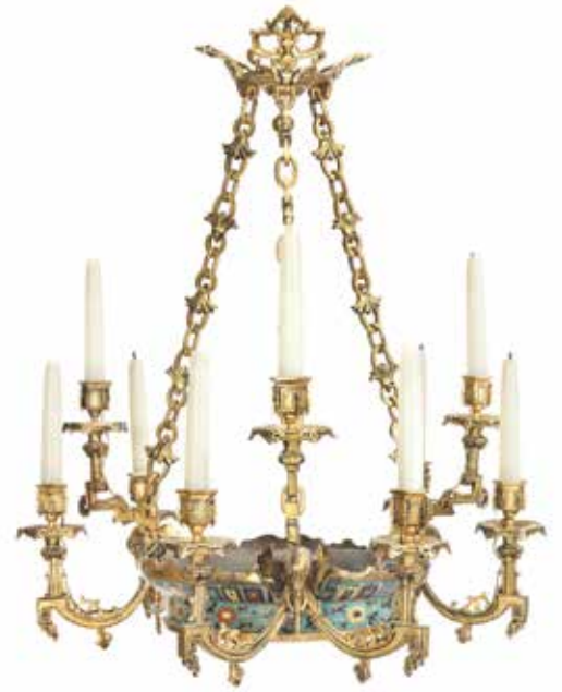
485 A LATE 19TH CENTURY FRENCH GILT BRONZE TP MOUNTED, CHAMPLÉVÉ AND CLOISONNÉ ENAMEL NINE LIGHT PLAFFONIER CHANDELIER in the Japonisme taste, the mounts in the manner of Ferdinand Barbedienne, the cloisonné probably Japanese later fitted for electricity, 68cm high drop approximately £1,000 - 1,500 €1,200 - 1,700