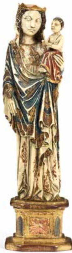
429 A 19TH CENTURY NEO-GOTHIC CARVED AND POLYCHROME AND GILT DECORATIVE IVORY FIGURAL GROUP OF THE VIRGIN & CHRIST CHILD the Virgin wearing a draped blue cloak and gilt floral decorated headdress and robe, the Christ Child wrapped in a red cloth and holding a dove, 24cm high £1,000 - 1,500 €1,200 - 1,700 See Bonhams.com for further footnote on this lot