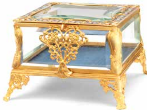
396 A LATE 19TH / EARLY 20TH CENTURY FRENCH GILT BRONZE CHAMPLEVÉ AND CUT GLASS JEWELLERY BOX of square form, the hinged lid with foliate borders with fleur-de-lis corners, the front with pierced floral mount on scrolling feet, 10.5cm high, 15cm wide, 15cm deep £300 - 500 €350 - 580