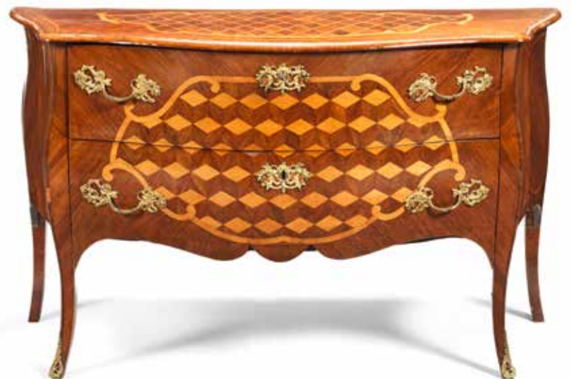
335 A PORTUGUESE 18TH CENTURY AMARANTH, ROSEWOOD AND FRUITWOOD TP PARQUETRY SERPENTINE COMMODE Y with cube and trellis inlay within scroll cartouches, with a paper label inscribed: 'JEREMY LTD, STAND No. 16' 145cm wide x 59cm deep x 85cm high, (57in wide x 23in deep x 33in high) £1,200 - 1,800 €1,400 - 2,100