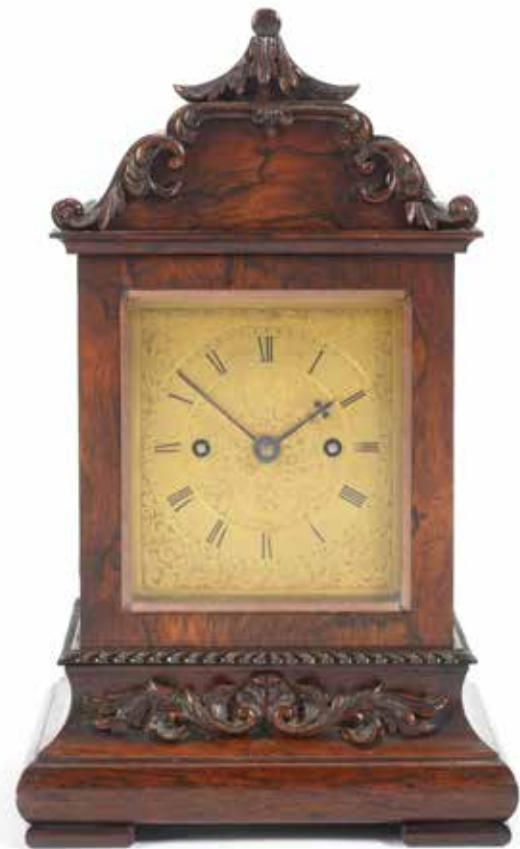
545 A MID 19TH CENTURY ROSEWOOD TABLE CLOCK TP the dial signed and numbered J.M.French Royal Exchange, London, No.22973 the 4.25" gilt Roman dial with outer minute track against a foliate-engraved ground (sight ring lacking), the signed and numbered twin chain fusee movement with anchor escapement rack striking on a circular-section coiled steel gong, 34cm high £1,500 - 2,500 €1,700 - 2,900