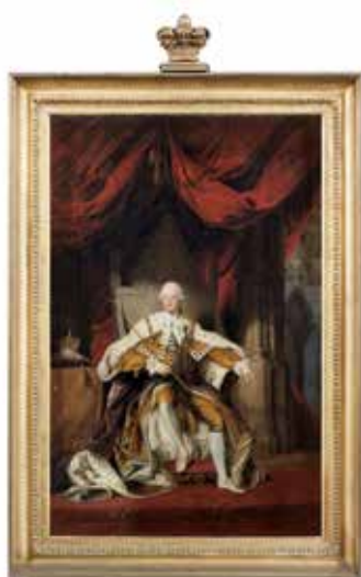
6* AFTER SIR JOSHUA REYNOLDS, EARLY 19TH CENTURY Portrait of King George III, seated in the Coronation Chair oil on canvas, extended on all four sides 88.4 x 58.6cm (34 13/16 x 23 1/16in). £1,200 - 1,800 €1,400 - 2,100 See Bonhams.com for further footnote on this lot