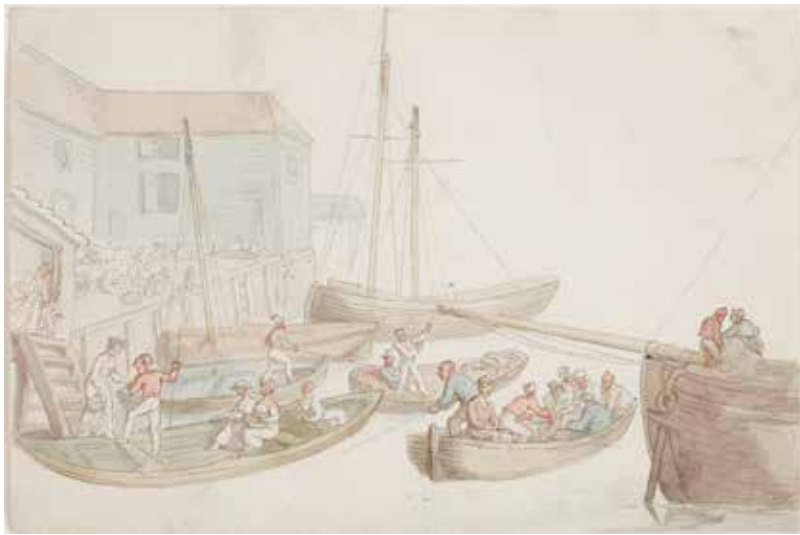
34 THOMAS ROWLANDSON (LONDON 1756-1827) Figures in boats by the quay pencil, pen and ink and watercolour on paper 14.2 x 21.6cm (5 9/16 x 8 1/2in). together with another by the same hand (2) £800 - 1,200 €930 - 1,400