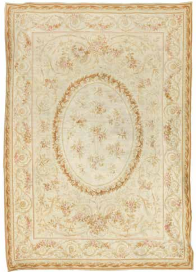
377 A 19TH CENTURY AUBUSSON CARPET TP 450cm x 311cm £2,500 - 3,500 €2,900 - 4,100