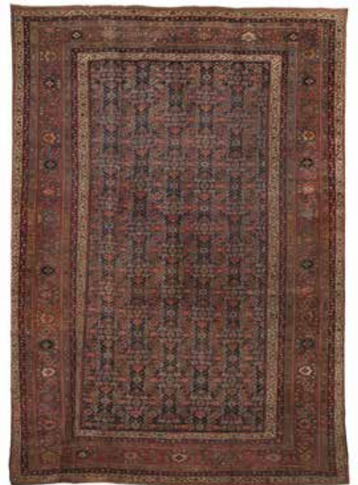
375 A SULTANABAD CARPET

TP West Anatolia, 604cm x 400cm £2,000 - 3,000 €2,300 - 3,500