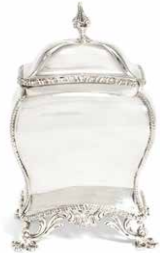
161 A GEORGE III SILVER TEA CADDY Samuel Herbert & Co, London 1767 Bombe form, with gadroon borders, on four pierced trefoil feet, height 14cm, weight 11oz. £800 - 1,200 €930 - 1,400