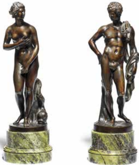
484 AFTER THE ANTIQUE: A PAIR OF 19TH CENTURY ITALIAN PATINATED BRONZE FIGURES OF THE VENUS DE MEDICI AND THE BELVEDERE ANTINOUS both on circular bases, brown patina, raised on circular green marble moulded plinths, 47.5cm high £800 - 1,200 €930 - 1,400