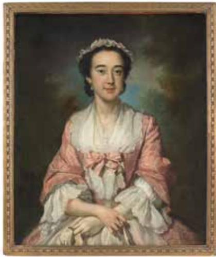
49 CIRCLE OF JOSEPH HIGHMORE (LONDON 1692-1780 CANTERBURY) Portrait of a lady, half-length oil on canvas 76.2 x 63.6cm (30 x 25 1/16in). £1,000 - 1,500 €1,200 - 1,700