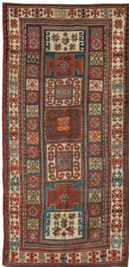
444 A TALISH LONG RUG TP South Caucasus, 253cm x 124cm £800 - 1,200 €930 - 1,400