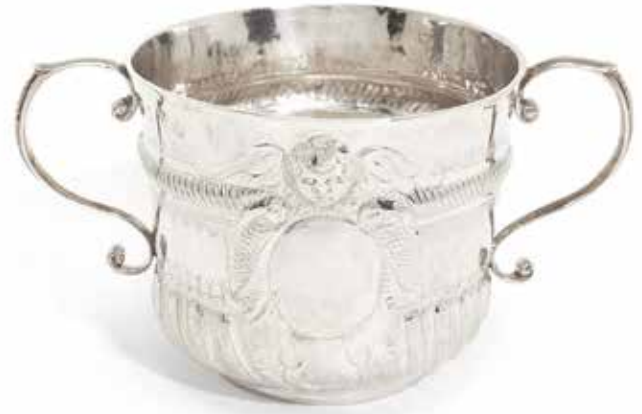
151 A QUEEN ANNE SILVER PORRINGER by John Downes, London 1705 With two beaded scroll handles, with slanting fluted decoration, the cartouche with winged cherub mask, diameter 10.5cm, weight 6oz. £1,000 - 1,500 €1,200 - 1,700