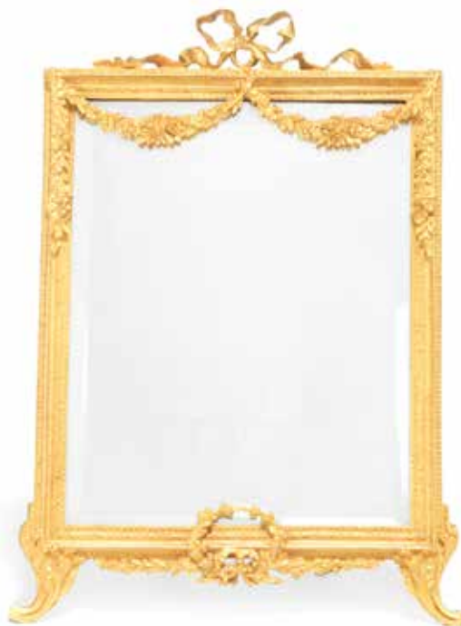
330 AN EARLY 20TH CENTURY FRENCH GILT BRONZE EASEL FRAMED TOILET MIRROR TP in the Louis XVI style the rectangular bevelled plate set within a floral swag and laurel wreath cast frame with ribbon cresting, the rear with Windmill mark, 41cm high £2,000 - 3,000 €2,300 - 3,500