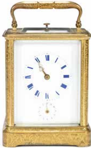
537 A THIRD QUARTER 19TH CENTURY FRENCH ENGRAVED BRASS CARRIAGE CLOCK WITH ALARM the shuttered back stamped Aiguilles au réveil the enamelled dial with Roman hours and Arabic numerals, the twin barrel movement with platform cylinder escapement, striking on bell with later winder, 16.5cm high overall £800 - 1,200 €930 - 1,400