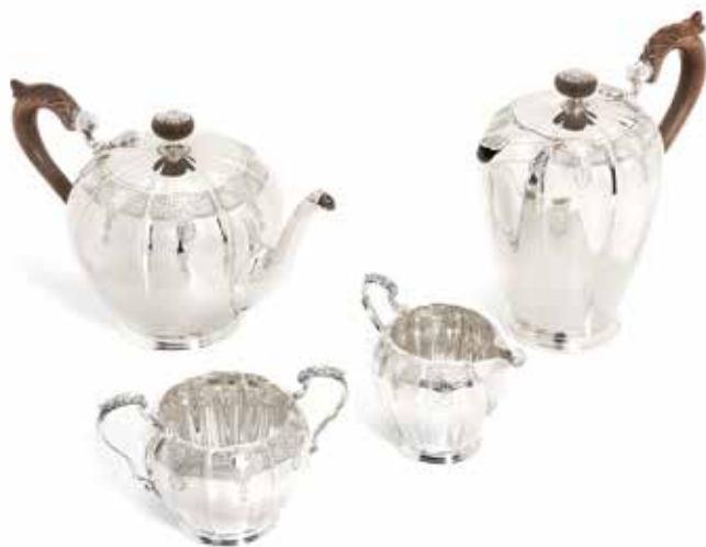
168 A FOUR-PIECE SILVER TEA AND COFFEE SERVICE by William Suckling Ltd, Birmingham 1959 / 1961 Cusped circular form, with engraved scale and scroll decoration, the pots with wooden handles, height of coffee pot 18.5cm, weight total 67oz. £500 - 700 €580 - 810