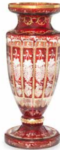
424 A LARGE BOHEMIAN RUBY FLASHED GLASS VASE made for the Turkish market, probably early 20th century the faceted ovoid body decorated with cut and etched fruiting vines elongated panels and gilt scrolls below a waisted neck and a spreading foot, 51cm high £1,000 - 1,500 €1,200 - 1,700