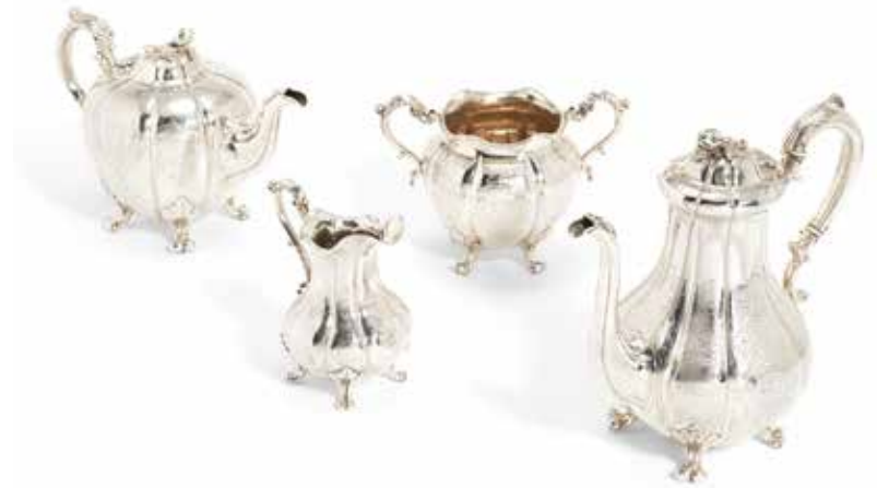
139 A VICTORIAN FOUR-PIECE SILVER TEA SERVICE Y by Williams Ltd, Birmingham 1900 Φ Lobed circular form, the pots with floral spray finials and ivory insulators, the bodies embossed with floral decoration, height of coffee pot 23cm, weight total 76.5oz. £800 - 1,200 €930 - 1,400