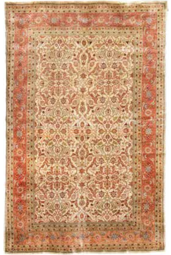
372 A SILK HEREKE RUG

TP Central Persia, 199cm x 141cm £2,000 - 3,000 €2,300 - 3,500