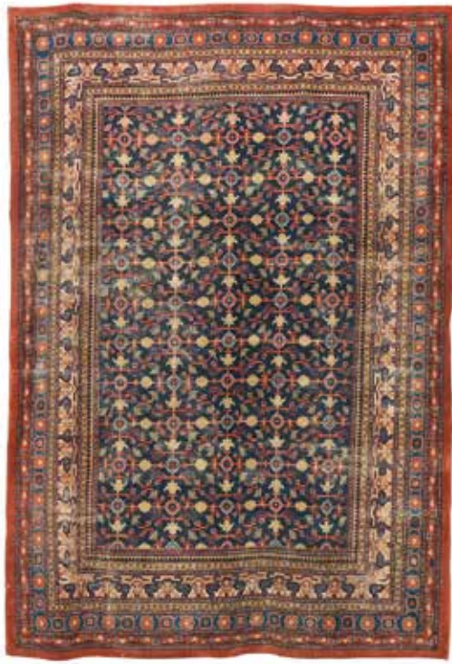
387 A KASHGAR CARPET TP East Turkestan, 398cm x 280cm £2,000 - 3,000 €2,300 - 3,500