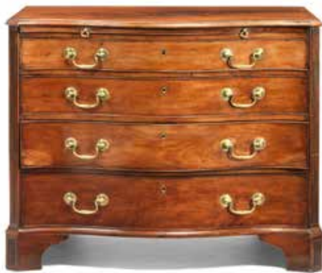
425 A GEORGE III MAHOGANY AND CROSSBANDED SERPENTINE CHEST TP The shaped rectangular top above a baize lined slide and four long graduated drawers, on shaped bracket feet, 98cm wide, 56cm deep, 79cm high (38 1/2in wide, 22in deep, 31in high). £1,000 - 1,500 €1,200 - 1,700