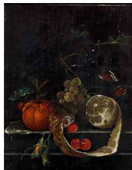
8 MANNER OF JAN DAVIDSZ. DE HEEM, 18TH CENTURY A lemon, grapes, cherries and other fruit with a flower on a stone ledge oil on panel 34.6 x 26.6cm (13 5/8 x 10 1/2in). £1,000 - 1,500 €1,200 - 1,700 See Bonhams.com for further footnote on this lot