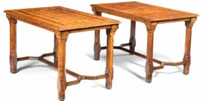
414 A PAIR OF VICTORIAN GOTHIC REVIVAL OAK AND PARQUETRY SIDE TABLES TP each moulded top with square and lozenge inlaid fields, on chamfered square section legs and recessed castors, 115cm wide x 71cm deep x 71cm high, (45in wide x 27 1/2in deep x 27 1/2in high) (2) £1,500 - 2,000 €1,700 - 2,300

See Bonhams.com for further footnote on this lot