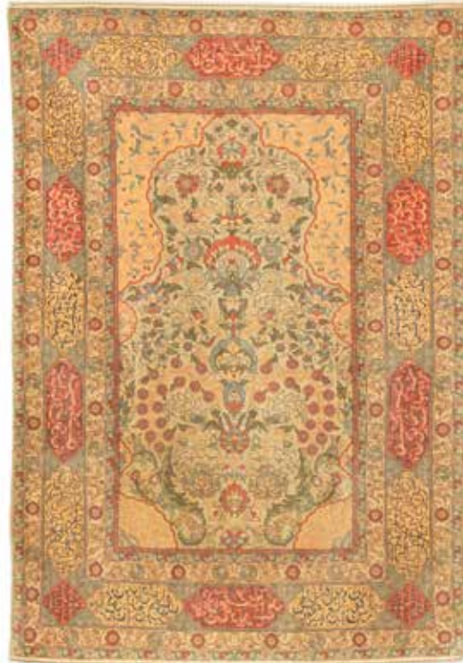
390 A SILK HEREKE RUG TP West Anatolia, 136cm x 95cm £1,200 - 1,800 €1,400 - 2,100