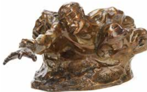
278 CARL MILLES (SWEDISH, 1875-1955): A PATINATED BRONZE MODEL OF 'THE STRUGGLE FOR EXISTENCE' modelled as the head and shoulders of two grasping male figures with a downcast female looking on, signed Carl Miller , golden brown patination, 19cm high £1,000 - 1,500 €1,200 - 1,700

See Bonhams.com for further footnote on this lot