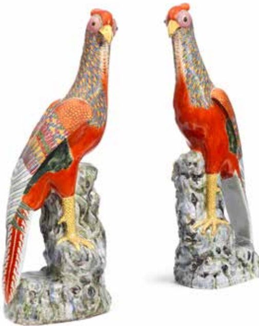
469 A PAIR OF 20TH CENTURY CHINESE DECORATIVE POLYCHROME AND GILT DECORATED PORCELAIN MODELS OF EXOTIC LONG TAILED BIRDS each standing on a rockwork base, 77.5cm high (2) £800 - 1,200 €930 - 1,400