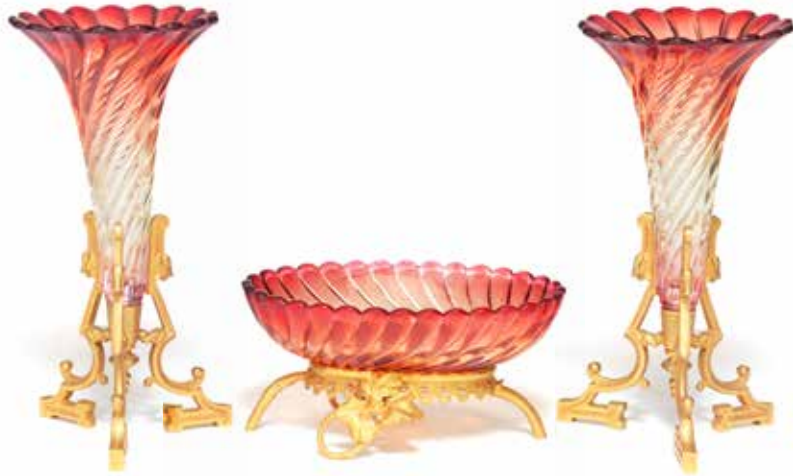
401 A PAIR OF GILT BRASS MOUNTED SHADED CLEAR AND RUBY GLASS VASES AND A SIMILAR OVAL FOOTED DISH probably late 19th / early 20th century, the glass possibly Baccarat the vases of spiral moulded flared form on angular tripartite footed bases, the similarly moulded oval bowl on rusticated leaf and twig footed base, 16cm high, the bowl, 20cm wide (3) £1,000 - 1,500 €1,200 - 1,700