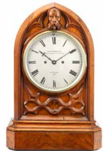
541 A LATE 19TH CENTURY CARVED MAHOGANY BRACKET CLOCK the dial and backplate signed Chas. (Charles) Frodsham, 84 Stand, and numbered 1305 the lancet arched case with 7" silvered dial with Roman numerals, the brass twin fusee movement striking on gong, with pendulum, 52cm high £800 - 1,200 €930 - 1,400