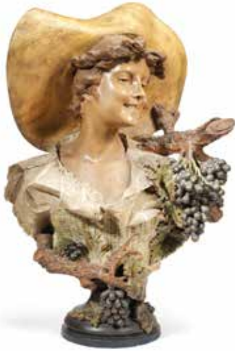
548 AN EARLY 20TH CENTURY AUSTRIAN PAINTED TERRACOTTA BUST OF A RUSTIC MAIDEN modelled looking to sinister, wearing a straw hat and frilled bodice and leaning beside fruiting vine boughs, on circular socle, 75cm high £1,000 - 2,000 €1,200 - 2,300