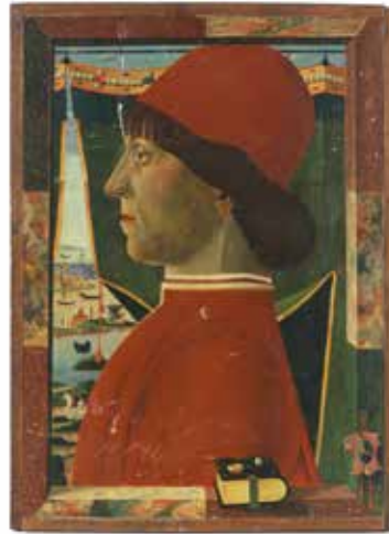
61 AFTER BALDASSARE ESTENSE, 20TH CENTURY Portrait of gentleman before a window oil on panel 48.2 x 36.4cm (19 x 14 5/16in). £1,500 - 2,000 €1,700 - 2,300

See Bonhams.com for further footnote on this lot