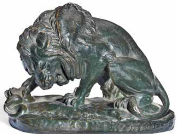
422 AFTER ANTOINE-LOUIS BARYE (FRENCH, 1795-1875): A LATE 19TH CENTURY PATINATED BRONZE MODEL OF 'LION AU SERPENT' (LION CRUSHING A SERPENT) cast by Barbedienne on naturalistic oval base signed to one side BARYE and with F. BARBEDIENNE Fondeur foundry mark to the right hand front side, 13cm high £600 - 800 €700 - 930