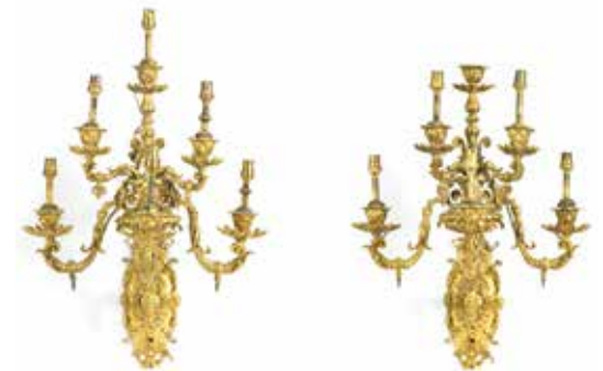
400 A PAIR OF LATE 19TH CENTURY GILT BRONZE SIX LIGHT WALL APPLIQUES in the Renaissance Revival taste the scrolling arm fittings issuing from corresponding bracketed backplates, originally fitted for gas and later electrified, 50cm high approximately (2) £400 - 600 €460 - 700