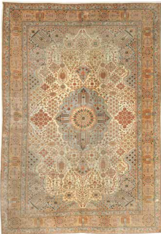
448 A KAYSERI SILK CARPET TP West Anatolia, 356cm x 245cm £3,000 - 5,000 €3,500 - 5,800