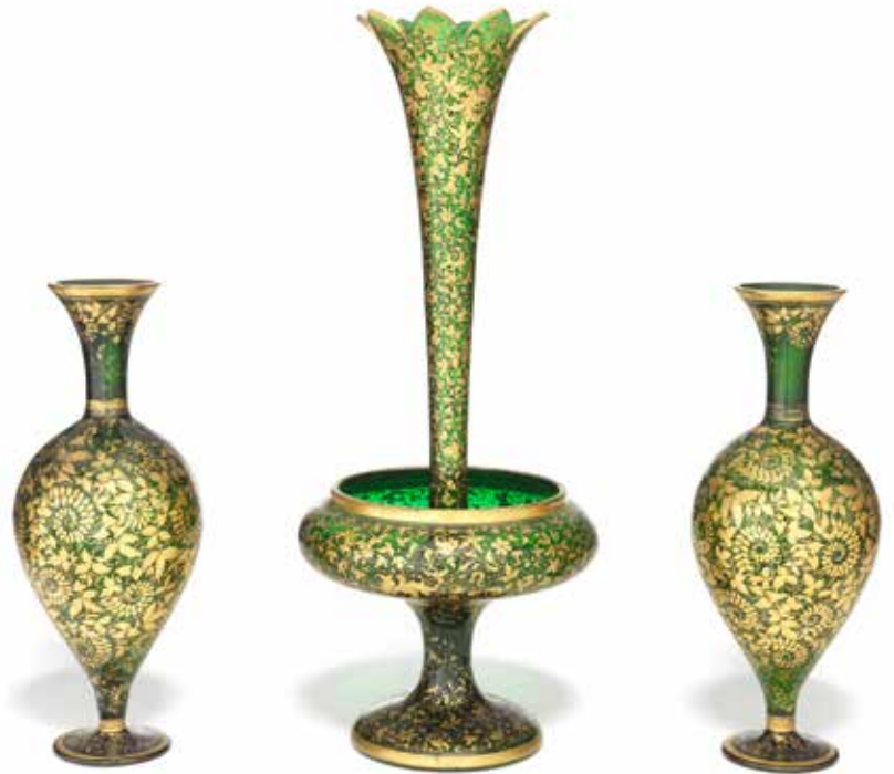
402 A BOHEMIAN GREEN GLASS EPERGNE VASE AND A PAIR OF SIMILAR GARNITURE VASES probably late 19th / early 20th century each piece with allover dense gilt leaf decoration, the epergne vase of pedestal bowl with flared and scalloped trumpet vase, the garniture vases of bulbous ovoid form with flared necks and small pedestal bases, 54cm and 34cm high overall (3) £2,000 - 3,000 €2,300 - 3,500