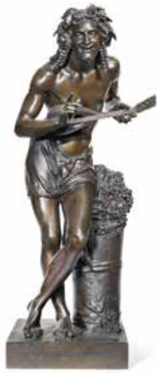
336 FRANCISQUE JOSEPH DURET (FRENCH, 1804-1865): A PATINATED BRONZE TP FIGURE OF 'IMPROVVISATORE' formed as a semi-clad Neapolitan youth playing a mandolin beside a grape barrel on square base, inscribed IMPROVVISATORE , signed Duret , 54cm high £2,000 - 3,000 €2,300 - 3,500