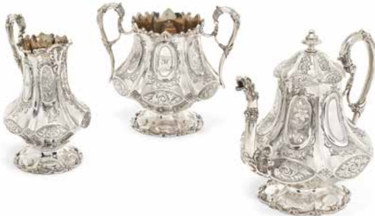
126 A VICTORIAN SILVER THREE-PIECE TEA SERVICE Y by Joseph Angell II, London 1856 Φ Neo-Gothic style, with mask handles, the pot with a dragon spout and ivory insulators; together with a further three-piece tea service, London 1854, height of teapot 17cm, weight 82oz. (6) £1,200 - 1,500 €1,400 - 1,700