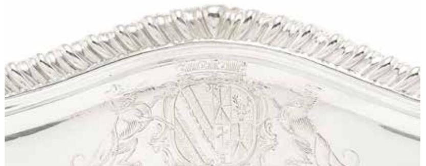
184 A SET OF TWELVE GEORGE III SILVER DESSERT PLATES by Andrew Fogelberg, London 1774 Shaped-circular with gadroon rims, the borders with engraved arms for MATTHEW, 2nd Baron Fortescue, undersides with scratch weights, diameter 24.5cm, weight 188.5oz. (12) £4,000 - 6,000 €4,600 - 7,000 See Bonhams.com for further footnote on this lot