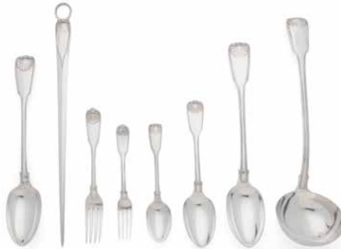
138 A GEORGIAN / VICTORIAN COLLECTED SILVER FIDDLE, THREAD AND SHELL PATTERN FLATWARE SERVICE various maker's and dates Comprising: six table forks, by George Adams ; six table spoons, four by James Beebe ; four dessert forks; three dessert spoons, by George Adams ; a soup ladle and two basting spoons, by George Adams, London 1845 ; a meat skewer, Sheffield 1872 ; six varying teaspoons, a salt spoon; two single struck desert spoons and a Fiddle Husk dessert fork, weight 92.5oz. £1,000 - 1,500 €1,200 - 1,700