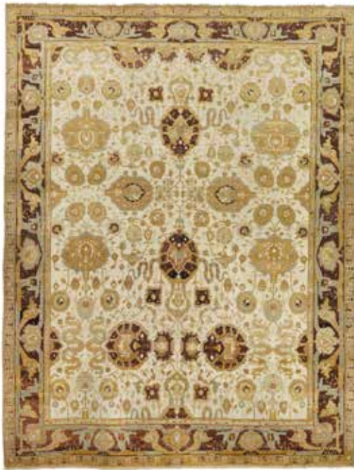
373 AN AMRITSAR RUG

TP West Anatolia, 232cm x 148cm £2,500 - 3,000 €2,900 - 3,500