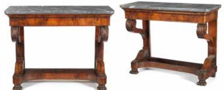
416 A PAIR OF FRENCH EARLY 19TH CENTURY RESTAURATION MAHOGANY TP CONSOLE TABLES each with a marble top above one frieze drawer, on acanthus clasped scroll supports, with a scrolled corbel headed concave base, terminating in lion paw feet, 117cm wide x 48.5cm deep x 93cm high, (46in wide x 19in deep x 36 1/2in high) (2) £2,500 - 3,500 €2,900 - 4,100

See Bonhams.com for further footnote on this lot