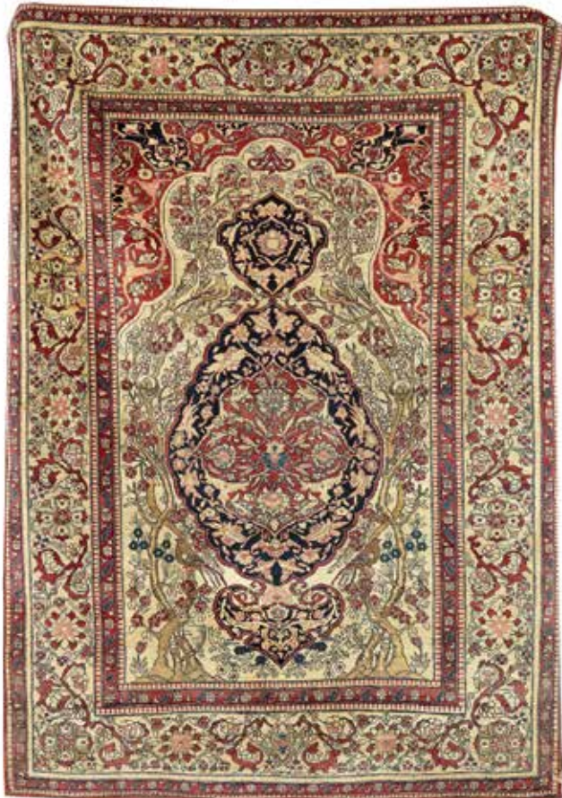
378 AN ISFAHAN RUG TP Central Persia, 200cm x 145cm £1,500 - 2,000 €1,700 - 2,300