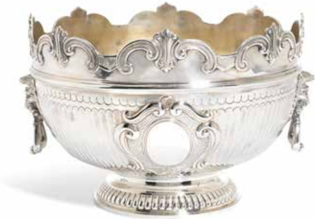
164 A VICTORIAN SILVER PUNCH BOWL by Charles Stuart Harris, London 1894 In the late 17th century style, with a scroll rim, vertical fluting and two lion mask drop ring handles, diameter 35cm, weight 96oz. £1,000 - 1,500 €1,200 - 1,700