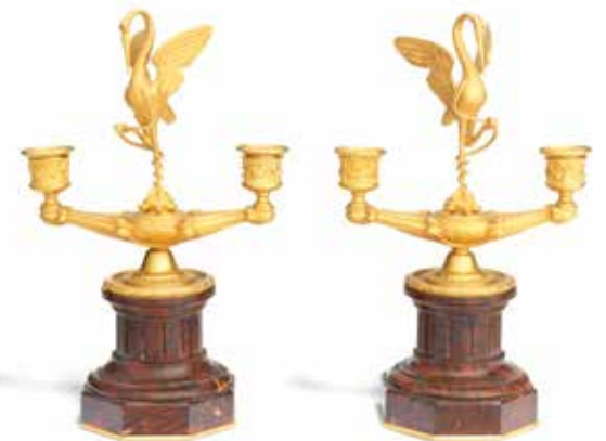
520 A PAIR OF LATE 19TH CENTURY GILT BRONZE AND ROUGE GRIOTTE MARBLE TWIN LIGHT DWARF CANDELABRA each modelled as an oil lamp centred by a model of a stork standing on a tortoise holding a serpent in its beak, on circular pedestal base, raised on a fluted half column and canted plinth bases, 32cm high (2) £500 - 700 €580 - 810