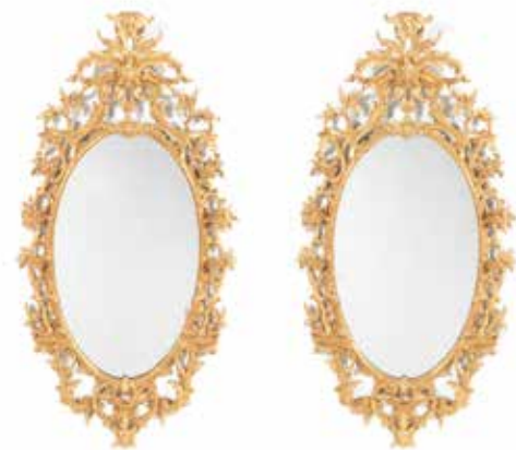
494 A PAIR OF GEORGE III STYLE GILTWOOD MIRRORS TP in the Rococo taste each with an oval plate encompassed by branches, scrolled acanthus, foliage and scrolls, surmounted by cabochons and an acanthus spray cresting, 120cm high x 60cm wide, (2) £2,000 - 3,000 €2,300 - 3,500