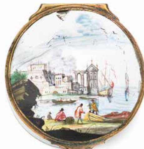
91 AN ENAMELLED BOX DECORATED WITH HARBOUR SCENES, BUTTERFLIES AND INSECTS Y London or possibly Birmingham circa 1750-60 Φ circular form, the hinged cover depicting figures within a riverscape, the sides embellished with butterflies and insects, with gilt metal mounts, height 2.5cm, diameter 4.8cm. £400 - 600 €460 - 700