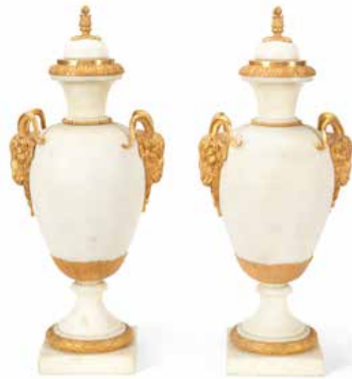
547 A PAIR OF LATE 19TH / EARLY 20TH CENTURY GILT BRONZE MOUNTED WHITE MARBLE GARNITURE URNS in the Louis XVI style the pedestal urn bodies with rams mask handles, the fixed covers with fruiting foliate finials on shallow square plinth bases, 47cm high (2) £1,000 - 1,500 €1,200 - 1,700