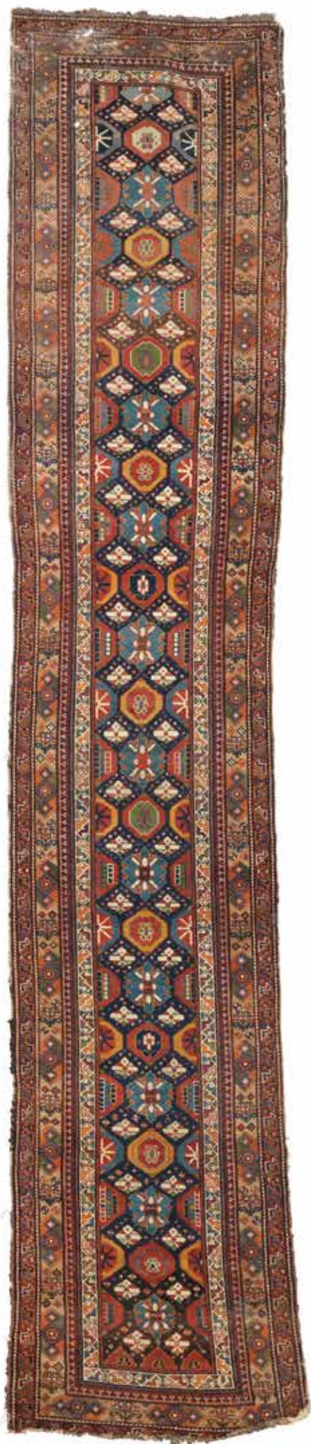
441 A LURI RUNNER TP West Persia, 467cm x 98cm £800 - 1,000 €930 - 1,200