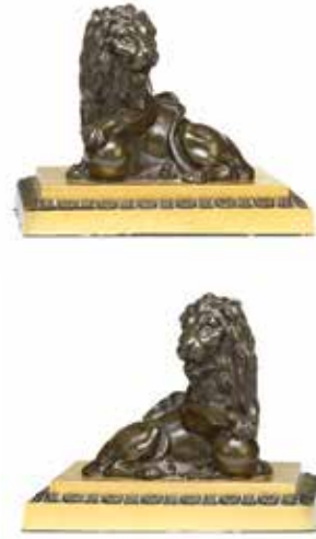
514 A PAIR OF MID 19TH CENTURY GILT AND PATINATED BRONZE MODELS OF SEATED LIONS the mirror image beasts with open snarling jaws, their front paws resting on balls, mounted on stepped rectangular bases with formalised foliate mounted borders, 15cm high (2) £500 - 800 €580 - 930 See Bonhams.com for further footnote on this lot