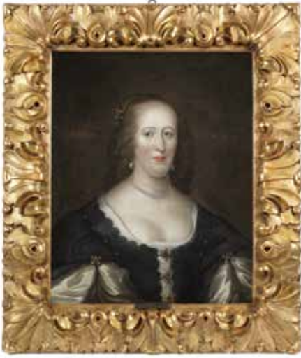
57 CIRCLE OF CORNELIS JONSON VAN CEULEN (LONDON 1593-1661 UTRECHT) Portrait of a lady in black and white dress bears inscription (upper left and right) oil on canvas 74.2 x 61.2cm (29 3/16 x 24 1/8in). £1,500 - 2,000 €1,700 - 2,300