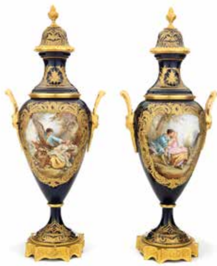
411 A PAIR OF LATE 19TH / EARLY 20TH CENTURY FRENCH SÈVRES STYLE GILT TP BRONZE MOUNTED PEDESTAL VASES AND COVERS in the Louis XVI style the bleu de roi bodies painted with ovals of courting couples, one indistinctly signed Maxant and rustic landscapes within gilded foliate borders, 59cm high (2) £2,000 - 3,000 €2,300 - 3,500