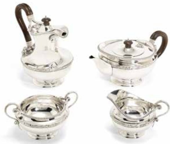
169 A SILVER FOUR-PIECE TEA SERVICE by Mappin & Webb, London 1918 In the Regency style, with coiling snake handles and junctions, the pots with wood handles and finials, height of coffee pot 22cm, weight total 84oz. £600 - 800 €700 - 930