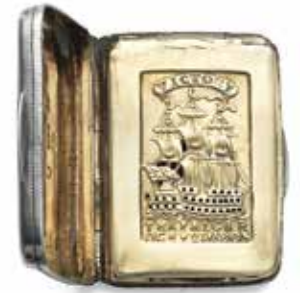
194 A GEORGE III SILVER 'NELSON' VINAIGRETTE by Matthew Linwood, Birmingham 1805 The cover engraved with a portrait of Lord Horatio Nelson and his message "England Expects Every Man Will Do His Duty," the grille cast with a depiction of HMS Victory and "Trafalgar, Oct 21 1805", length 3.5cm. £1,000 - 1,500 €1,200 - 1,700