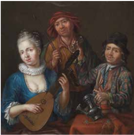
60 CIRCLE OF MATTHYS NAVEU (LEIDEN 1647-CIRCA 1721 AMSTERDAM) An interior scene with a woman playing a lute oil on panel 19.2 x 18.2cm (7 9/16 x 7 3/16in). £1,000 - 1,500 €1,200 - 1,700