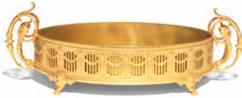
393 A LATE 19TH / EARLY 20TH CENTURY FRENCH GILT BRONZE OVAL JARDINIÈRE in the Louis XVI taste the laurel garlanded pierced sides with elaborate foliate twin handles, on lions ring paw cast feet, fitted a detachable brass liner, 52cm wide £600 - 800 €700 - 930