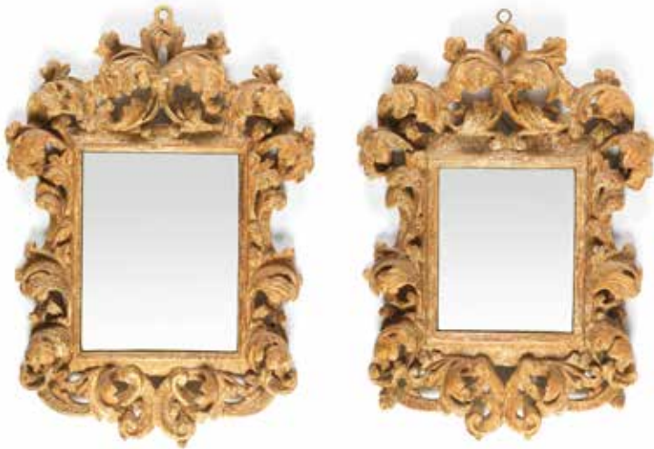
437 A NEAR PAIR OF ITALIAN CARVED WOOD FRAMES probably 18th century each with scrolling acanthus decoration, one of slightly smaller size both formerly gilded and tooled and now fitted modern rectangular mirror plates, 62cm x 41cm overall approximately (2) £800 - 1,000 €930 - 1,200

See Bonhams.com for further footnote on this lot