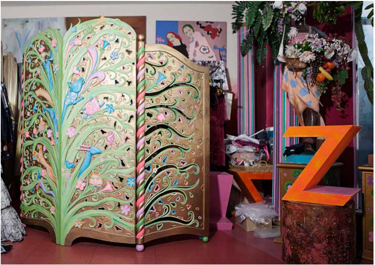
Above: India has been an inspiration since a first visit in the 1980s and this Rhodes-designed screen has its roots in Asian folk art; the Z for Zandra once ornamented Rhodes's Mayfair shop