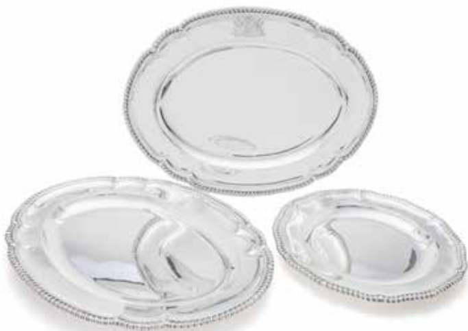
162 A VICTORIAN PAIR OF SILVER PLATTERS AND A PLATE by James Garrard, London 1892 Shaped-oval and shaped-circular forms, with gadroon rims, borders with engraved coat of arms for George Charles Spencer-Churchill, 8th Duke and Lillian, Duchess of Marlborough, length of platter 41cm, diameter of plate 28.3cm, weight 106.5oz. (3) £1,800 - 2,200 €2,100 - 2,500