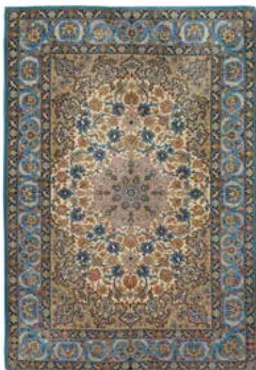
454 AN ISFAHAN RUG

TP West Anatolia, 138cm x 103cm £600 - 800 €700 - 930