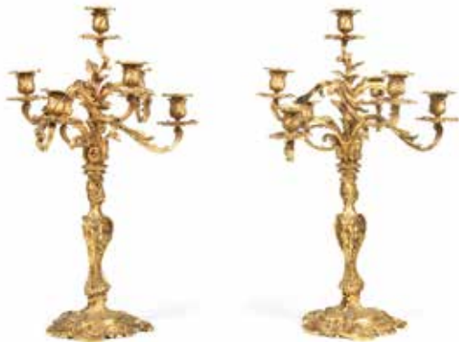
518 A PAIR OF EARLY 20TH CENTURY FRENCH GILT TP BRONZE SEVEN LIGHT CANDELABRA in the Louis XV style the acanthus scrolling arms issuing from shell and foliate tripartite baluster stems and spreading circular bases, 61.5cm high (2) £700 - 1,000 €810 - 1,200

See Bonhams.com for further footnote on this lot