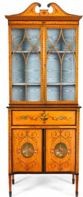
488 A LATE VICTORIAN SHERATON REVIVAL TP SATINWOOD AND POLYCHROME DECORATED SECRETAIRE DISPLAY CABINET with a swan neck pediment, the secretaire enclosing four drawers above a pair of doors enclosing one shelf, 76cm wide x 42cm deep x 200cm high, (29 1/2in wide x 16 1/2in deep x 78 1/2in high) £1,000 - 1,500 €1,200 - 1,700