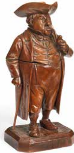
524 AN EARLY 20TH CENTURY CARVED AND STAINED WOOD FIGURAL TOBACCO JAR OF AN 18TH CENTURY GENTLEMAN wearing a tricorne hat and smoking a pipe, standing on a canted square base, 37cm high £400 - 600 €460 - 700