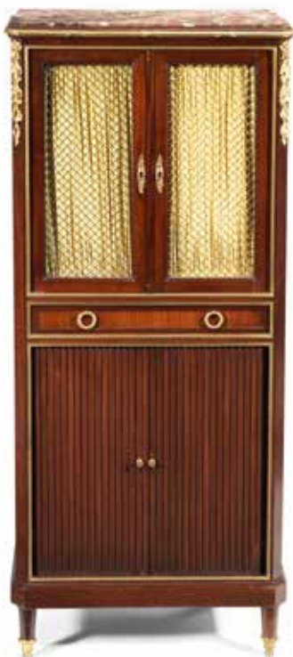
486 A SMALL FRENCH 19TH CENTURY GILT BRONZE TP MOUNTED MAHOGANY CABINET in the Louis XVI style with a pair of doors enclosing two shelves, over one drawer and a pair of tambour slides enclosing two shelves, 56cm wide x 37cm deep x 132cm high, (22in wide x 14 1/2in deep x 51 1/2in high) £800 - 1,200 €930 - 1,400