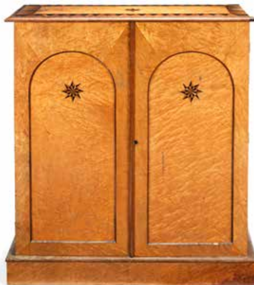
487 AN EARLY VICTORIAN BIRDS' EYE MAPLE, TP PURPLEWOOD AND EBONISED SPECIMEN Y COLLECTOR'S CABINET ENCLOSING A COLLECTION OF BUTTERFLIES AND MOTHS A description is available to read online at www.bonhams.com, 116cm wide x 50cm deep x 132cm high, (45 1/2in wide x 19 1/2in deep x 51 1/2in high) £1,200 - 1,800 €1,400 - 2,100