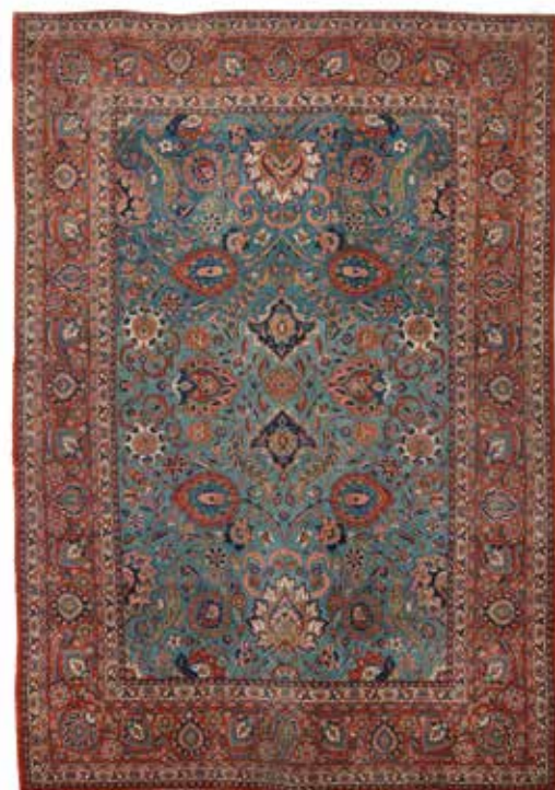
445 A KASHAN CARPET TP Central Persia, 302cm x 210cm £800 - 1,200 €930 - 1,400