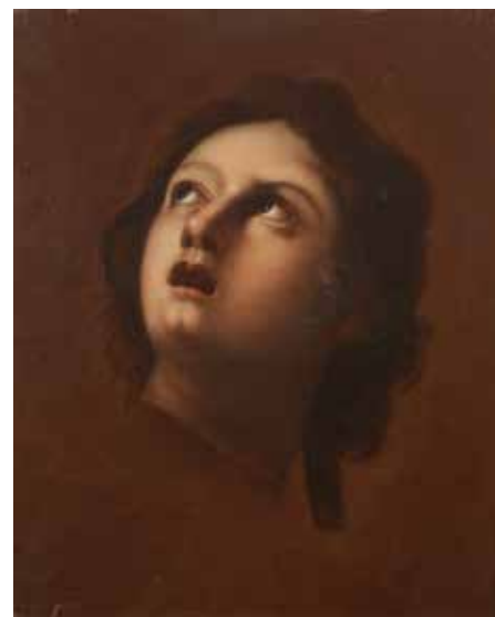
3 FOLLOWER OF DOMENICO ZAMPIERI, CALLED IL DOMENICHINO (BOLOGNA 1581-1641 NAPLES) The head of a young man looking up oil on canvas 54.3 x 44.2cm (21 3/8 x 17 3/8in). unframed £500 - 800 €580 - 930