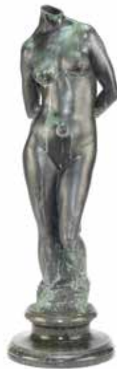
275 SWEDISH SCHOOL, EARLY 20TH CENTURY: A TP PATINATED BRONZE MODEL OF A FEMALE NUDE TORSO on integral naturalistic square base, green patination, raised on a circular Verde Antico marble base, 57.5cm high, 66.5cm high including plinth £300 - 500 €350 - 580

See Bonhams.com for further footnote on this lot