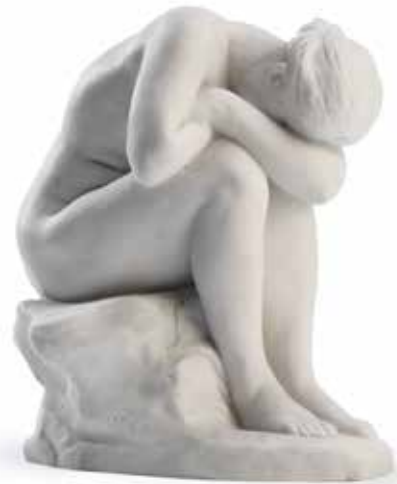
299 AFTER AIME JULES DALOU (FRENCH, 1838-1902): A SEVRES BISQUE PORCELAIN MODEL OF A FEMALE NUDE the seated crouching figure with a bat at her feet on oval naturalistic base, bearing facsimile signature DALOU and with impressed Sevres factory mark and inscribed modellers mark J F 8.03 , 18cm high £500 - 700 €580 - 810

See Bonhams.com for further footnote on this lot