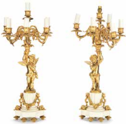
512 A PAIR OF LATE 19TH CENTURY FRENCH TP GILT BRONZE & MARBLE SIX LIGHT FIGURAL GARNITURE CANDELABRA the foliate arms supported by winged putti, on floral garland mounted fluted half column pedestals and shaped bases raised on toupie feet, fitted for electricity, 60cm high (2) £600 - 800 €700 - 930