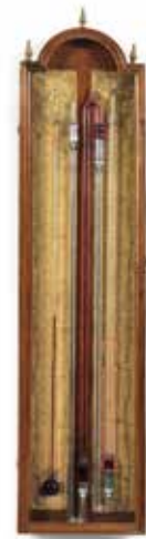
530 A MAHOGANY DOUBLE BAROMETER AND THERMOMETER TP signed Domenico Sala, London the glazed door with brass recording hand, the continuous tube filled alternately with mercury and red dyed oil, read via a signed printed scale and seven weather indications, the left side housing a thermometer read by a second paper scale of conforming design, 61cm high £1,000 - 1,500 €1,200 - 1,700