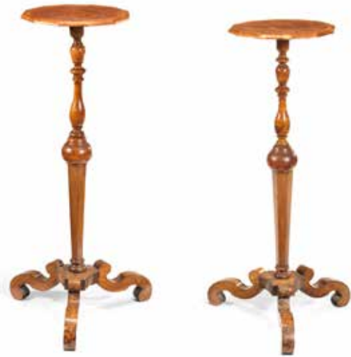
339 A PAIR OF WALNUT AND MARQUETRY CANDLE STANDS TP incorporating some late 17th/early 18th century elements each on a ring turned baluster and hexagonal tapering column, terminating in three floral inlaid outswept S-scroll legs, diameter of top: 39cm; 116cm high. £800 - 1,200 €930 - 1,400