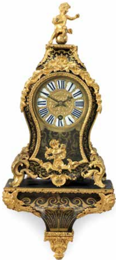
503 A GOOD MID 18TH CENTURY FRENCH TORTOISESHELL BRACKET CLOCK AND TP BRACKET Y the dial signed Varoquier a Paris the cartouche case with a sphere and putto finial, the 5", gilt dial with enamel Roman numerals, the movement with signed tapered plates with verge escapement and silk suspension pendulum, repeating the quarters on three bells, 66cms high £2,500 - 3,500 €2,900 - 4,100