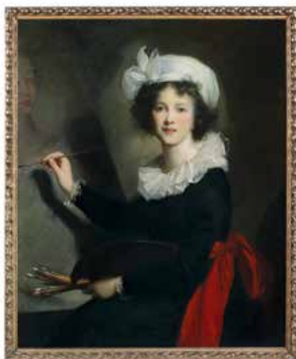
2 LUIGI BARDI (ITALIAN, 19TH CENTURY), AFTER ELISABETH LOUISE VIGÉE LE BRUN Portrait of Elisabeth Louise Vigée Le Brun bears inscription (on reverse) oil on canvas 99.6 x 81.4cm (39 3/16 x 32 1/16in). £1,000 - 1,500 €1,200 - 1,700 See Bonhams.com for further footnote on this lot