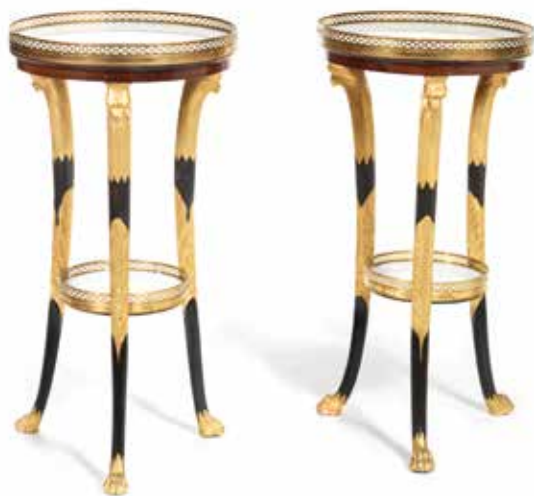
340 A PAIR OF BALTIC 19TH CENTURY MAHOGANY, PARCEL GILT AND EBONISED TP TWO-TIER GUERIDONS possibly Russian, each with a circular marble top and conforming undertier, on three griffin bust-headed monopodia with paw feet, 46cm wide x 46cm deep x 90cm high, (18in wide x 18in deep x 35in high) (2) £800 - 1,200 €930 - 1,400