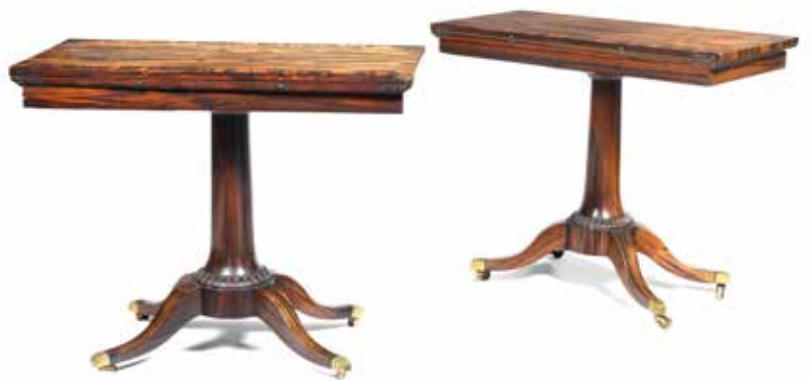
341 A NEAR PAIR OF FIRST HALF 19TH CENTURY CALAMANDER CARD TABLES TP one table early 19th century, the other probably later each enclosing a baize surface, terminating in outswept legs and castors, one table: 46cm wide x 91cm deep x 74cm high, the other: 46cm wide x 91.5cm deep x 75.5cm high, (18in wide x 36in deep x 29 1/2in high) (2) £2,000 - 3,000 €2,300 - 3,500