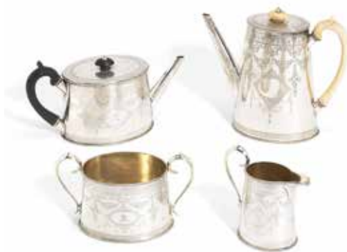
134 A VICTORIAN FOUR-PIECE SILVER TEA AND COFFEE SERVICE Y by Barnards, London 1868 Φ Oval form with tapering sides, richly engraved with scrolls and swags, the coffee pot with ivory handle and finial, crested, height of coffee pot 21cm, weight total 62oz. £800 - 1,200 €930 - 1,400