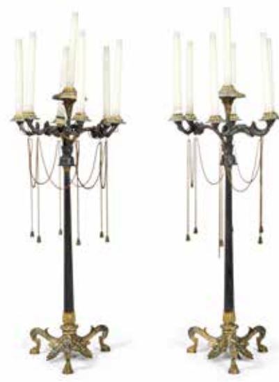
418 A PAIR OF LATE 19TH / EARLY 20TH CENTURY PATINATED AND GILT BRONZE SEVEN LIGHT CANDELABRAS in the Neo-Grec taste the scrolling arms issuing from tapering reed columns united by beaded swag and pendent chains, on tripartite scrolling paw feet, fitted for electricity, 83 cms high (2) £600 - 800 €700 - 930