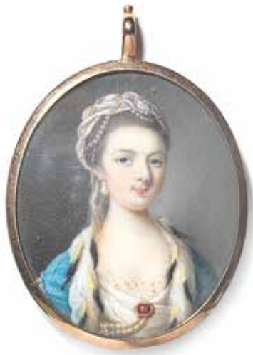
86 SAMUEL COLLINS (BRITISH, CIRCA 1735-1768) Y A lady wearing an ermine trimmed turquoise blue cloak, white dress and lace slip, Φ her brown hair dressed with further strands of pearls and upswept beneath a white embroidered turban ivory, gold frame, the reverse with border of blue glass surrounding gold mounted aperture, glazed to reveal plaited hair, oval, height 4cm (1 9/16in). £800 - 1,000 €930 - 1,200