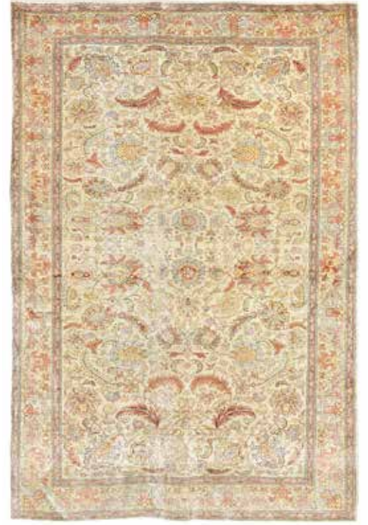
388 A SILK HEREKE RUG TP West Anatolia, 257cm x 180cm £2,500 - 3,000 €2,900 - 3,500