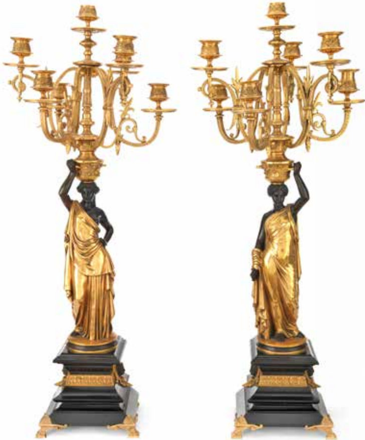
343 A PAIR OF 19TH CENTURY GILT AND PATINATED BRONZE FIGURAL SIX LIGHT TP CANDELABRA in the Neo-Grec taste formed as classical maidens supporting five light fittings on their heads and raised on black marble moulded footed square bases with maskhead mounts, 80cm high (2) £3,000 - 4,000 €3,500 - 4,600