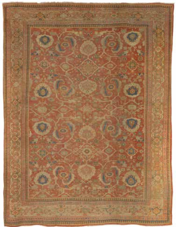
447 A MAHAL CARPET TP West Persia, 416cm x 321cm £4,000 - 5,000 €4,600 - 5,800

See Bonhams.com for further footnote on this lot