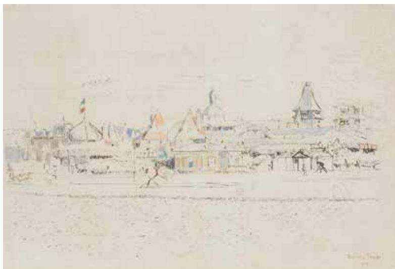
36 WALTER RICHARD SICKERT A.R.A. (BRITISH, 1860-1942) Dieppe signed, inscribed and dated 'SICKERT-DIEPPE-/1919' (lower right) ink and watercolour on paper 17.5 x 26cm (6 7/8 x 10 1/4in). £1,500 - 2,000 €1,700 - 2,300