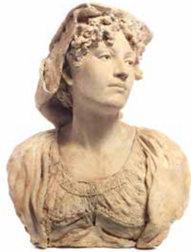
297 LATE 19TH CENTURY SCHOOL, PROBABLY ENGLISH: A TERRACOTTA BUST OF A YOUNG WOMAN in the aesthetic manner the sitter modelled looking to sinister wearing a cap and with a ruffled bodice in the Renaissance taste, 51cm high £600 - 800 €700 - 930