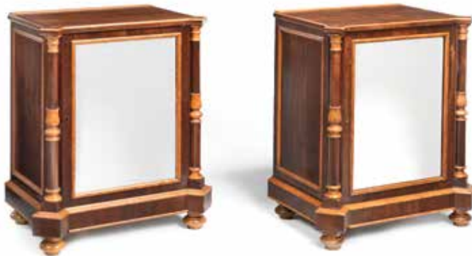
413 A NEAR PAIR OF MID 19TH CENTURY AUSTRALIAN HARDWOOD AND OAK TP BEDSIDE CABINETS originally with small superstructures or galleried tops each with a bevelled mirror inset door enclosing one shelf, 60cm wide x 42cm deep x 70cm high, (23 1/2in wide x 16 1/2in deep x 27 1/2in high) (2) £1,000 - 1,500 €1,200 - 1,700

See Bonhams.com for further footnote on this lot