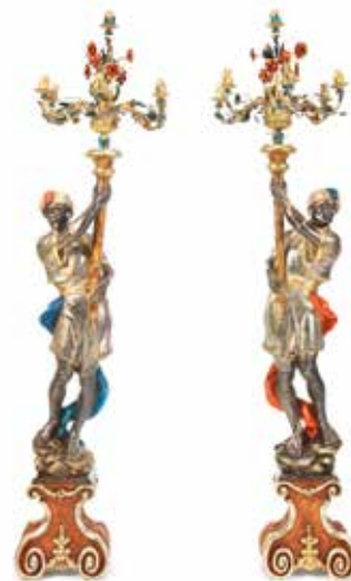
526 A PAIR OF MID 20TH CENTURY ITALIAN CARVED WOOD, TOLE AND COMPOSITION POLYCHROME DECORATED BLACKAMOOR TORCHIERES TP each turbaned figure supporting seven light floral candelabra fittings on scrolling plinth bases, fitted for electricity 212cm high overall (2) £800 - 1,000 €930 - 1,200