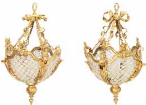
398 A PAIR OF EARLY 20TH CENTURY FRENCH GILT TP BRONZE AND BEADED GLASS PLAFFONNIERS the shaped and foliate cast panelled bowl frames inset with beaded flowerhead panels above baluster terminals, with ribbon tied roses and suspension chains, fitted for electricity, 70cm drop approximately (2) £800 - 1,200 €930 - 1,400