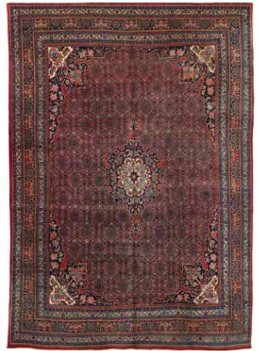
382 A BIDJAR CARPET

TP Central Persia, 367cm x 286cm £1,000 - 2,000 €1,200 - 2,300