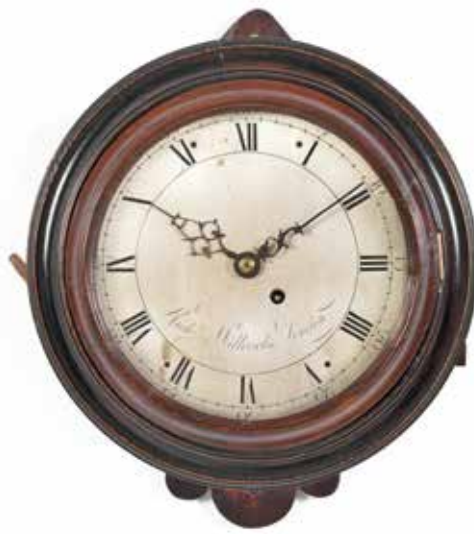
534 AN EARLY 20TH CENTURY OAK STAINED CASED BRASS BULKHEAD TIMEPIECE with 7" silvered Roman dial and brass single fusee movement, 24cm diameter approximately £500 - 800 €580 - 930