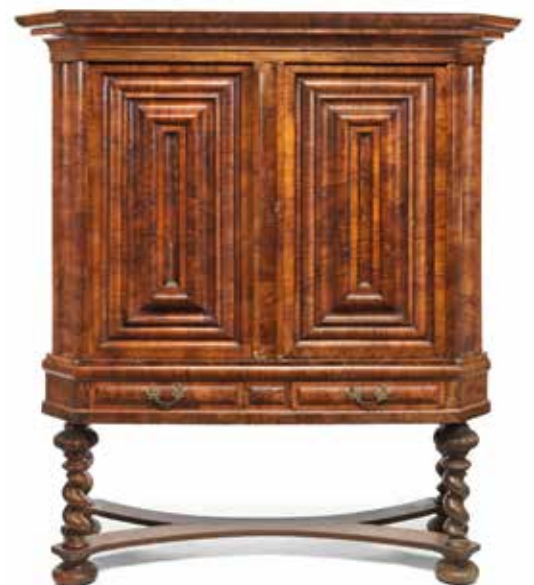
434 A GERMAN EARLY 18TH CENTURY WALNUT TP STOLLENSCHRANK/CABINET ON STAND the oak legs, stretcher and feet are all later the pair of moulded panelled doors enclosing three shelves, 182cm wide x 64cm deep x 212cm high, (71 1/2in wide x 25in deep x 83in high) £2,000 - 3,000 €2,300 - 3,500 See Bonhams.com for further footnote on this lot