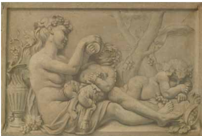
51 FRENCH SCHOOL, 18TH CENTURY An Allegory of Summer; and An Allegory of Autumn a pair, oil on canvas, en grisaille 54.3 x 81.2cm (21 3/8 x 31 15/16in). (2) £1,500 - 2,000 €1,700 - 2,300

See Bonhams.com for further footnote on this lot