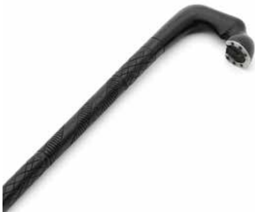
95 A BOER WAR PRISONER OF WAR COROMANDEL WALKING CANE The handle carved as a horse's hoof with metal shoe, on a tapering shaft engraved: Boeren Kamp Ceylon 1901, length 88cm. £1,000 - 1,500 €1,200 - 1,700

See Bonhams.com for further footnote on this lot