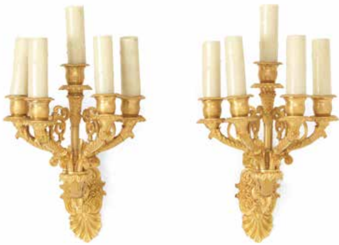
489 A PAIR OF LATE 19TH / EARLY 20TH CENTURY GILT BRONZE FIVE LIGHT WALL APPLIQUES in the Restauration style the two pairs of four scrolling arms with milled candle nozzles each centred by a further nozzles and issuing from foliate scrolling bracket supports, fitted for electricity, 40cm high overall (2) £1,000 - 1,500 €1,200 - 1,700