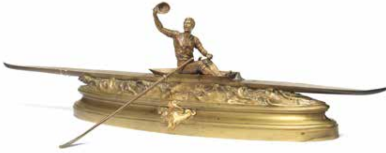
521 PIERRE EUGENE EMILE HEBERT (FRENCH, 1828-93): A BRONZE FIGURE OF 'LE CHAMPION' modelled as male rower raising his cap and seated in his single scull with detachable oars, on oval naturalistic watery base, signed E. Herbert , 81cm wide £1,500 - 2,000 €1,700 - 2,300