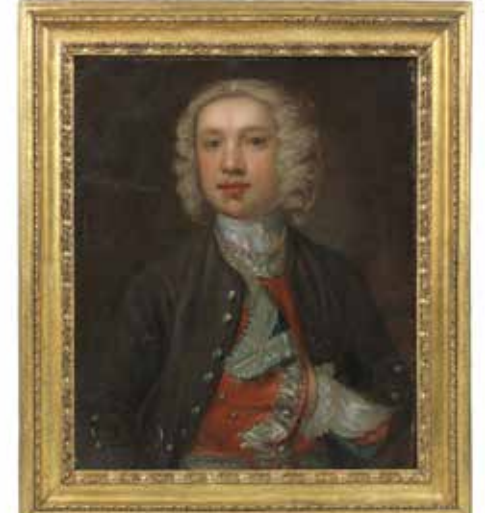
46 FOLLOWER OF VITTORE GIUSEPPE GHISLANDI CALLED FRA' GALGARIO (BERGAMO 1655-1743) Portrait of a boy oil on canvas 64.2 x 53.2cm (25 1/4 x 20 15/16in). £1,500 - 2,000 €1,700 - 2,300

See Bonhams.com for further footnote on this lot