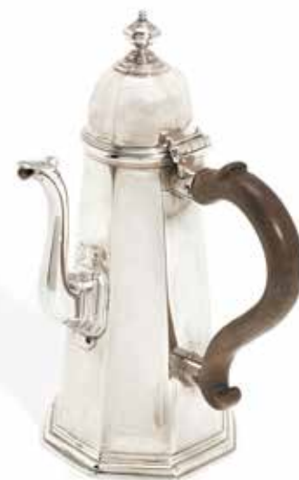
83 A GEORGE I BRITANNIA STANDARD SILVER OCTAGONAL COFFEE POT by Thomas Farren, London 1719 Tapering sides with a skirted foot, hinged dome cover with ball finial, wood side handle at right angles to the faceted spout, height 25cm, weight total 23oz. £1,500 - 2,000 €1,700 - 2,300