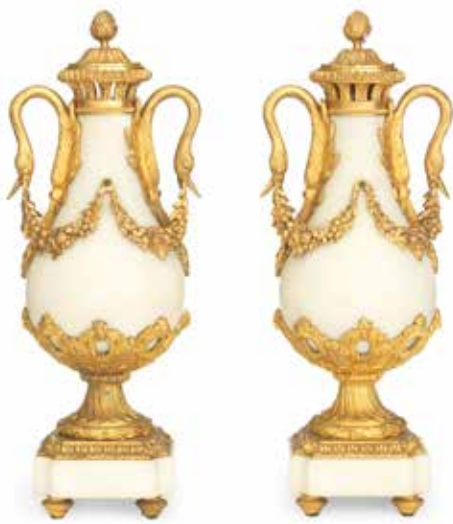
546 A PAIR OF LATE 19TH CENTURY FRENCH GILT BRONZE MOUNTED WHITE MARBLE GARNITURE URNS in the Louis XVI style the pear shaped bodies with pineapple finials and twin swans neck handles united by garlands, the spiral fluted pedestals on cut corner square foot plinth bases, 34cm high (2) £1,500 - 2,000 €1,700 - 2,300