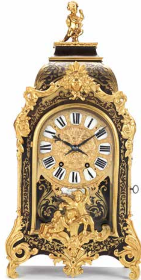
504 A GOOD 19TH CENTURY FRENCH BRASS INLAID TORTOISESHELL BRACKET CLOCK TP the dial signed Martinot, Paris Y the case with applied cast mounts and caddy top surmounted by a figure of Cupid, the 5" gilt dial with applied enamel Roman numerals above the enamel signature, the twin spring driven movement with outside countwheel striking on a bell, with maskhead pendulum and case key, 50cms high £1,500 - 2,000 €1,700 - 2,300