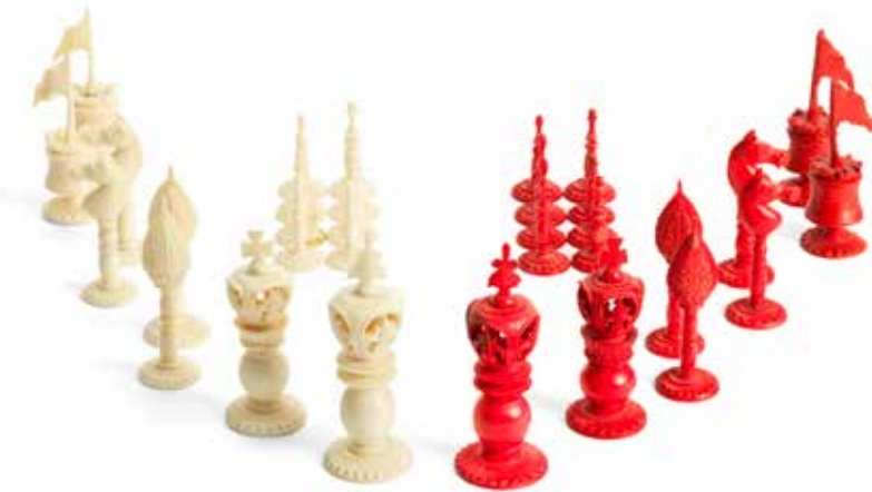
523 A 19TH CENTURY CHINESE EXPORT CARVED IVORY 'BURMESE' PATTERN TYPE CHESS SET possibly Macao, the king and queens carved with pierced fleur-de-lis ball knopped crowns, the bishops with mitres hats, the knights as horses' heads on pedestals, the rooks as turrets with flags, the pawns as turned pedestals two pieces replaced , the king 11cm high, the pawns 5.8cm high (32) £400 - 600 €460 - 700