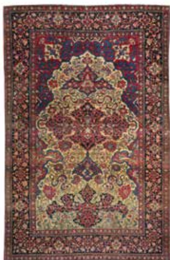
456 AN ISFAHAN PRAYER RUG

TP South East Persia, 204cm x 131cm £800 - 1,200 €930 - 1,400