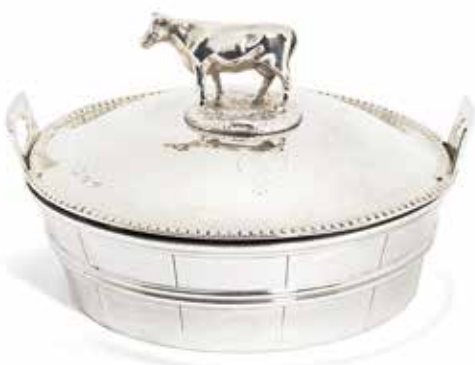
133 A VICTORIAN SILVER BUTTER DISH by Hawkesworth, Eyre & Co, London 1849 Modelled as a shallow wooden milk pail, the lid with a cast cow finial, with a frosted glass liner, crested, length 15.5cm, weight without liner 16oz. £500 - 700 €580 - 810