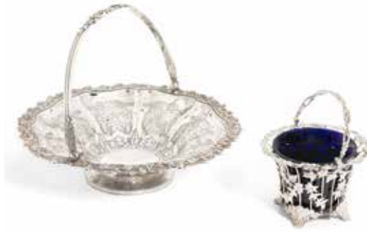
121 A GEORGE IV SILVER SWING-HANDLE BASKET by S C Younge & Co, Sheffield 1828 Circular, chased with floral decoration, diameter 31cm; together with a sugar caster, London 1890; a sugar basket, Sheffield 1844, weight without blue glass liner 52oz. (3) £800 - 1,000 €930 - 1,200