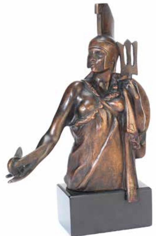
220 MANNER OF GILBERT BAYES (BRITISH, 1872-1953): AN EARLY 20TH CENTURY BRONZE THREE QUARTER LENGTH BUST OF BRITANNIA the stylised figure looking to dexter, brown patination, raised on a rectangular black marble plinth base, 29cm high £1,000 - 1,500 €1,200 - 1,700

See Bonhams.com for further footnote on this lot