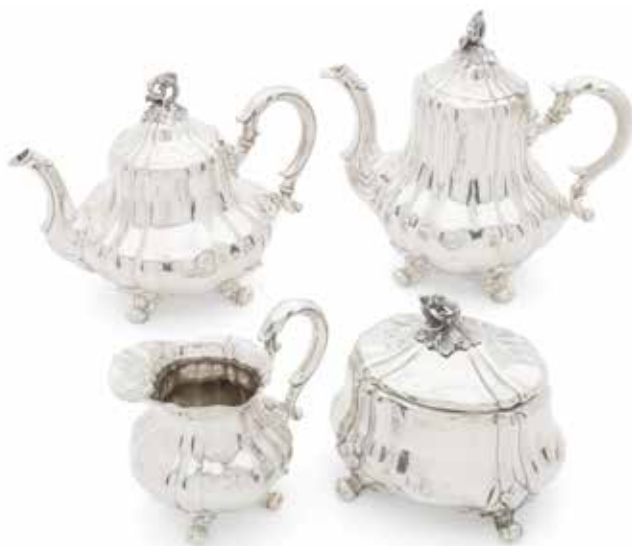
71 A 19TH CENTURY RUSSIAN / UKRANIAN FOUR-PIECE SILVER TEA SERVICE Odessa circa 1890 Lobed baluster form, the pots with ivory insulators, on four scroll feet, height of coffee pot 25cm, weight total 59.5oz. (4) £600 - 800 €700 - 930