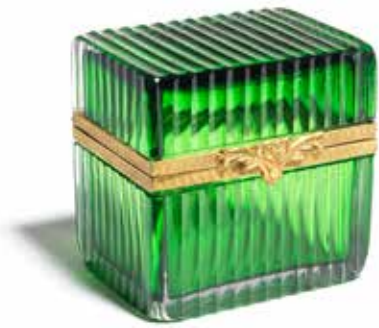
515 A GILT BRASS MOUNTED BOHEMIAN GREEN CUT GLASS CASSET probably mid 20th century the rectangular hinged body with reed cut decoration, the mounts with foliate cast catch, 13cm high, 13cm wide, 10cm deep £300 - 500 €350 - 580