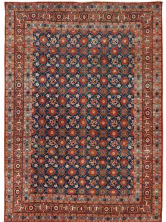
385 A VERAMIN RUG

TP West Persia, 326cm x 206cm £1,500 - 2,000 €1,700 - 2,300