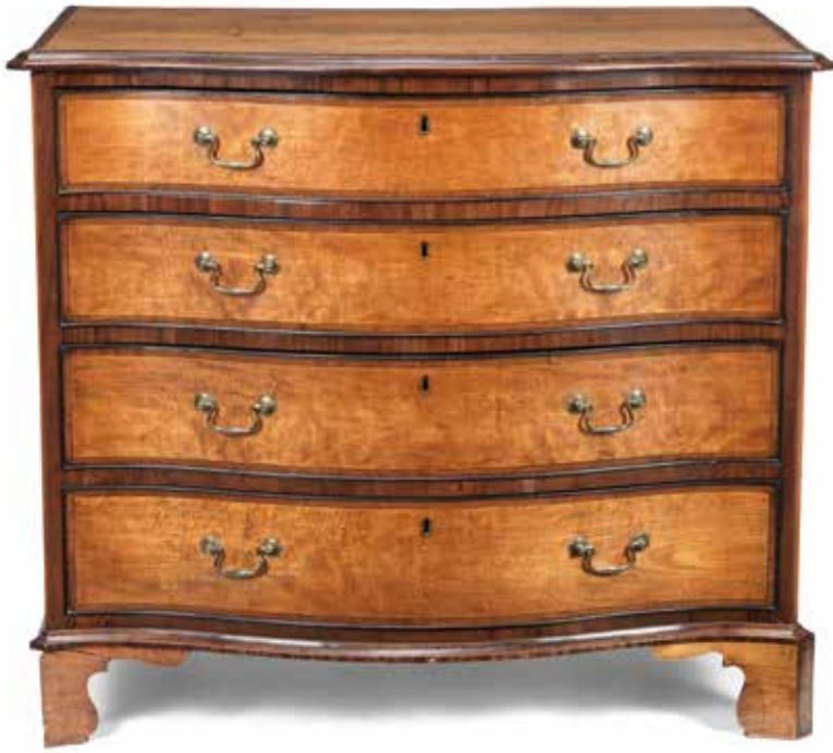
357 A GEORGE III SATINBIRCH, PURPLEWOOD AND MAHOGANY SERPENTINE CHEST TP the ogee moulded top above four long graduated drawers, on shaped bracket feet, the reverse bearing an old Apter Fredericks label, 99.5cm wide x 62cm deep x 86cm high, (39in wide x 24in deep x 33 1/2in high) £2,000 - 3,000 €2,300 - 3,500