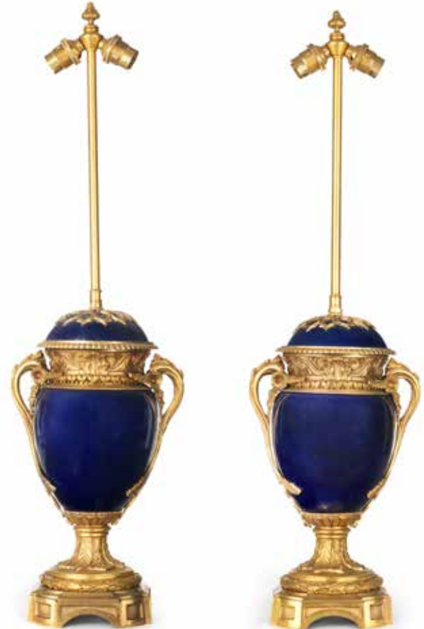
369 A PAIR OF LATE 19TH / EARLY 20TH CENTURY FRENCH GILT BRONZE MOUNTED TP PORCELAIN VASE LAMPBASES in the Louis XVI style the bleu de roi glazed ovoid bodies with acanthus scrolling handles and scrolling mounts, on stiff leaf and laurel wreath pedestals and re-entrant cut corner bases, fitted for electricity, 66cm high £2,000 - 3,000 €2,300 - 3,500