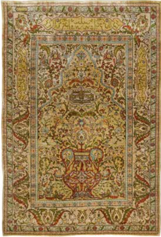
370 A SILK HEREKE PRAYER RUG

TP West Anatolia, 119cm x 82cm £2,000 - 3,000 €2,300 - 3,500