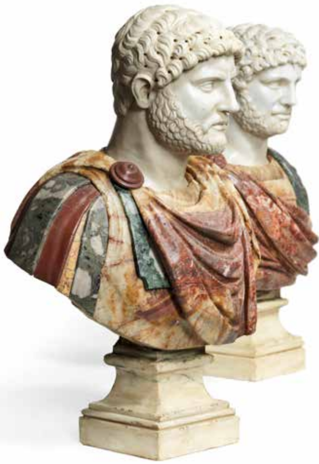
349 AFTER THE ANTIQUE: A PAIR OF ITALIAN CARVED WHITE AND COLOURED AND TP VARIEGATED MARBLE BUSTS OF EMPERORS both with curled hair and beards and clad in tunics, the shoulders with drapery, one held with a circular pin, raised on veined square socle bases, 65cm high (2) £12,000 - 18,000 €14,000 - 21,000