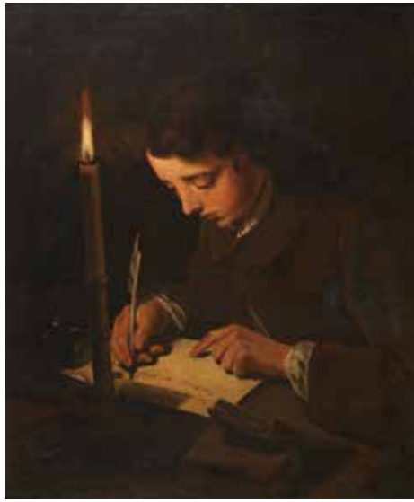
58 FOLLOWER OF HENRY ROBERT MORLAND (CIRCA 1716-1797 LONDON) A boy writing a letter by candlelight oil on canvas 73.3 x 60.5cm (28 7/8 x 23 13/16in). £1,200 - 1,800 €1,400 - 2,100