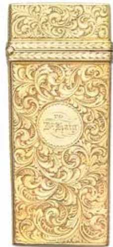
94 A 19TH CENTURY GOLD LANCET CASE circa 1880 Tapering rectangular form, richly engraved with scroll decoration, containing ivory and tortoiseshell-handled lancets, length 5.7cm, weight without lancets 20gms. £800 - 1,200 €930 - 1,400