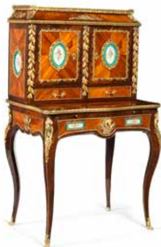
427 A FRENCH 19TH CENTURY PORCELAIN AND GILT BRONZE MOUNTED TP TULIPWOOD AND KINGWOOD BONHEUR DU JOUR with a pair of doors above two short drawers, over a leather inset slide and a drawer, on cabriole legs, 78cm wide x 53cm deep x 132cm high, (30 1/2in wide x 20 1/2in deep x 51 1/2in high) £800 - 1,200 €930 - 1,400