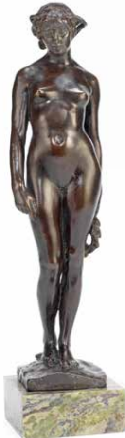
227 SIR WILLIAM REID DICK (BRITISH, 1879-1961): A PATINATED BRONZE FIGURE OF STANDING FEMALE NUDE holding a wreath and with downcast face, on square naturalistic base, indistinctly signed and dated Reid Dick 191* , brown patina, raised on a veined green marble square plinth base, 36cm high approximately, 40cm high overall £2,000 - 3,000 €2,300 - 3,500

See Bonhams.com for further footnote on this lot