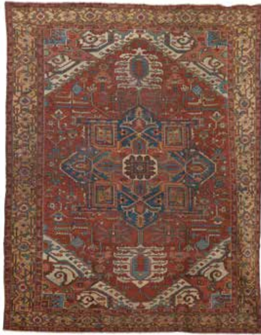
381 A HERIZ CARPET

TP West Persia, 485cm x 339cm £1,000 - 1,500 €1,200 - 1,700