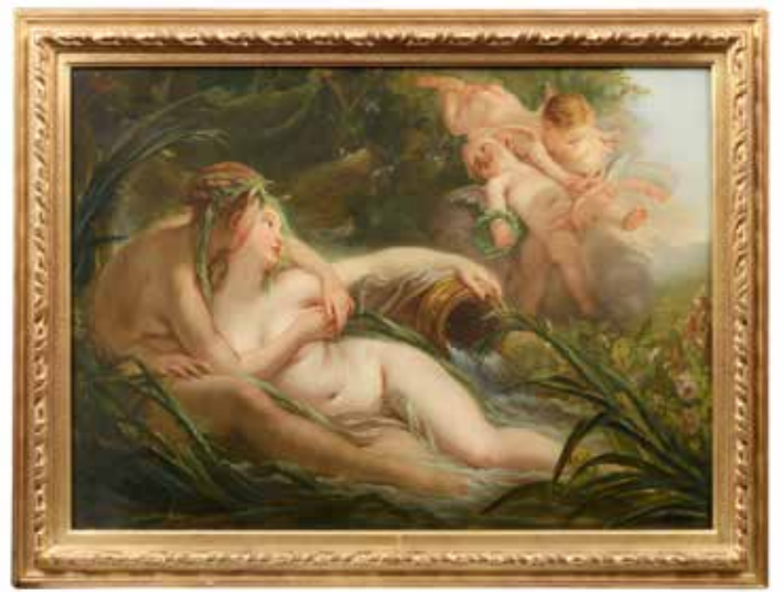
10 AFTER FRANÇOIS BOUCHER, 19TH CENTURY River gods oil on canvas, unlined 54.4 x 75.2cm (21 7/16 x 29 5/8in). £500 - 800 €580 - 930

See Bonhams.com for further footnote on this lot