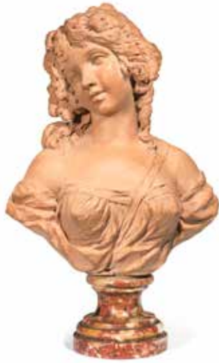
296 FRENCH SCHOOL, 19TH CENTURY: A SCULPTED TERRACOTTA BUST OF A YOUNG LADY looking slightly to dexter with loosely arranged curling hair and draped diaphanous bodice, raised on brown brocatelle marble socle, 29cm high £400 - 600 €460 - 700