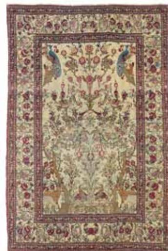
452 AN ISFAHAN CARPET

TP South East Persia, 363cm x 261cm £700 - 1,000 €810 - 1,200