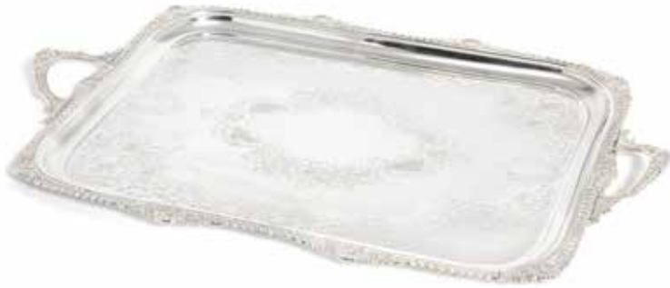
179 A VICTORIAN SILVER TWO-HANDLE TRAY by Harry Atkin, London 1895 Shaped-rectangular form, with a gadroon and shell border and two handles, the surface engraved with scroll decoration, length 71cm, weight 136oz. £1,500 - 2,000 €1,700 - 2,300