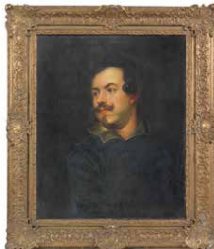
45 AFTER SIR ANTHONY VAN DYCK, 19TH CENTURY Portrait of a gentleman oil on canvas 65.5 x 53.5cm (25 13/16 x 21 1/16in). £800 - 1,200 €930 - 1,400