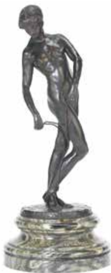
231 BRITISH SCHOOL (LATE 19TH / EARLY 20TH CENTURY): 'A SLIGHT ENTANGLEMENT', A BRONZE FIGURE OF A FEMALE NUDE, on circular base, raised on an engraved titled contemporary green marble shallow waisted plinth, 25.5cm high, 31.5cm high including base £400 - 600 €460 - 700