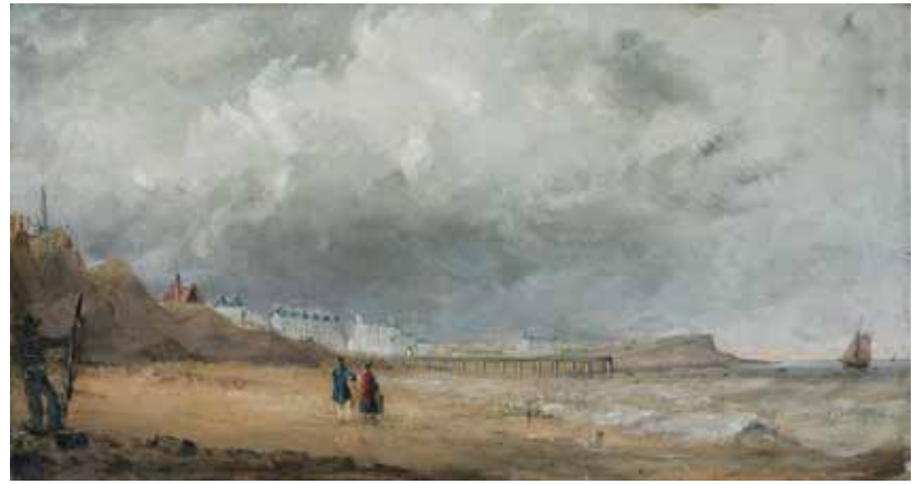
53 ENGLISH SCHOOL, 19TH CENTURY A View on the Norfolk Coast oil on board 27.9 x 38.2cm (11 x 15 1/16in). unframed £600 - 800 €700 - 930

See Bonhams.com for further footnote on this lot