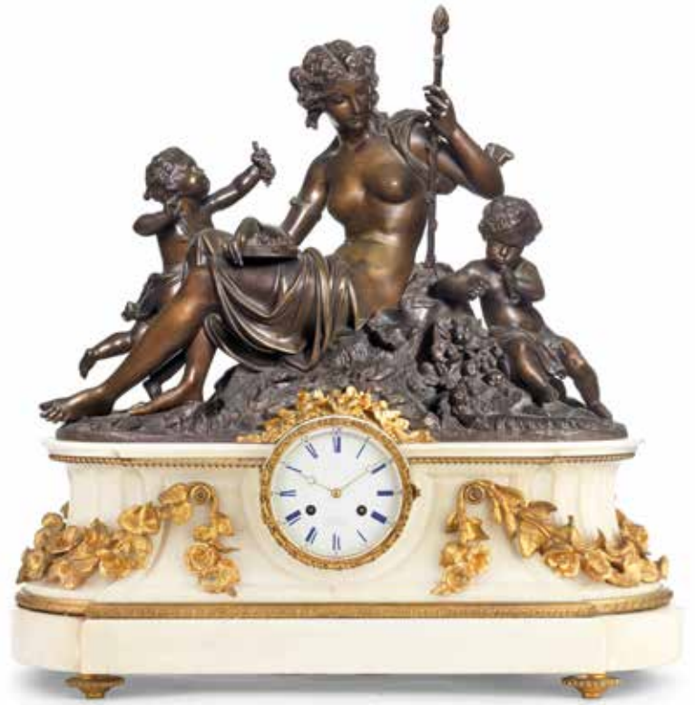
502 AN IMPRESSIVE LATE 19TH CENTURY FRENCH GILT AND PATINATED BRONZE AND WHITE MARBLE FIGURAL MANTEL CLOCK TP the dial and movement signed Charpentier & Cie, Paris formed as a seated Baccante flanked by two putti, the part fluted and Convolvulus cast plinth base centred by the 5" enamel Roman dial on toupie feet, the brass twin train movement striking on bell, 66cm high £4,000 - 6,000 €4,600 - 7,000