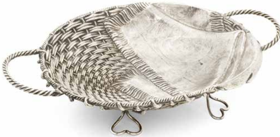
69 A RUSSIAN TROMPE L'OEIL SILVER BOWL maker's mark KA, Moscow 1878 Modelled as a wicker basket with a patterned cloth draped on it, on four feet, length 37cm, weight 18.5oz. £2,000 - 3,000 €2,300 - 3,500