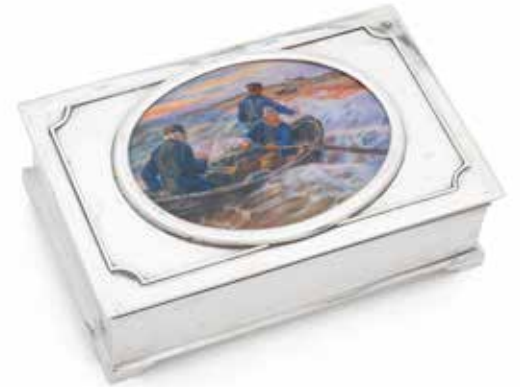
70 A SILVER AND ENAMEL CASSET with pseudo marks for Fabergé and later Soviet marks, the enamel plaque marked VCY with an Imperial eagle Rectangular, the hinged lid decorated with an enamel plaque depicting three men in a rowing boat, gilt interior, height 5.5cm, length 17cm. £500 - 700 €580 - 810