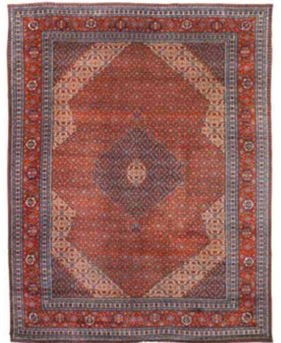
391 A LARGE TABRIZ CARPET TP North West Persia, 316cm x 416cm £1,800 - 2,500 €2,100 - 2,900