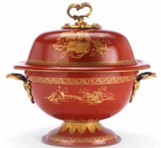
470 A VICTORIAN JAPANED TOLE COAL VASE AND COVER with later red and gilt japanned Chinoiserie decoration of oval pedestal form with foliate handles, 51cm high £300 - 500 €350 - 580