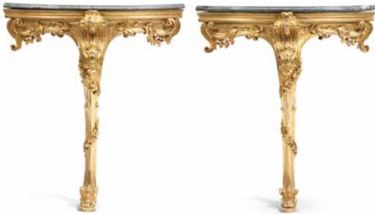
338 A PAIR OF NORTH ITALIAN CARVED GILTWOOD CORNER CONSOLE TABLES TP The grey marble tops above a S-scroll and acanthus leaf decorated apron and a S-scroll carbricole support, mid 19th century, 78cm wide x 57cm deep x 95cm high, (30 1/2in wide x 22in deep x 37in high) (2) £800 - 1,200 €930 - 1,400