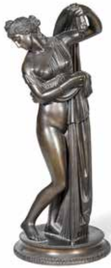
361 A LATE 19TH CENTURY ITALIAN PATINATED BRONZE FIGURE OF DIANA TP EMERGING FROM HER BATH the semi-clad figure holding drapery around her on circular waisted shallow plinth base, inscribed M Amadeo- Napoli , 82cm high £1,500 - 2,500 €1,700 - 2,900