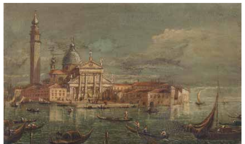
14 MANNER OF GIACOMO GUARDI, 18TH CENTURY San Giorgio Maggiore, Venice oil on panel 15.3 x 25.5cm (6 x 10 1/16in). £1,000 - 1,500 €1,200 - 1,700