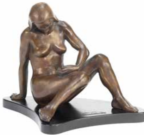
263 DANISH SCHOOL (EARLY 20TH CENTURY): A BRONZE FIGURE OF A SEATED FEMALE NUDE her downcast head with bobbed hair, brown patination, on shaped ebonised wood shallow plinth base, 22cm high, 24.5cm high including base £400 - 600 €460 - 700

See Bonhams.com for further footnote on this lot