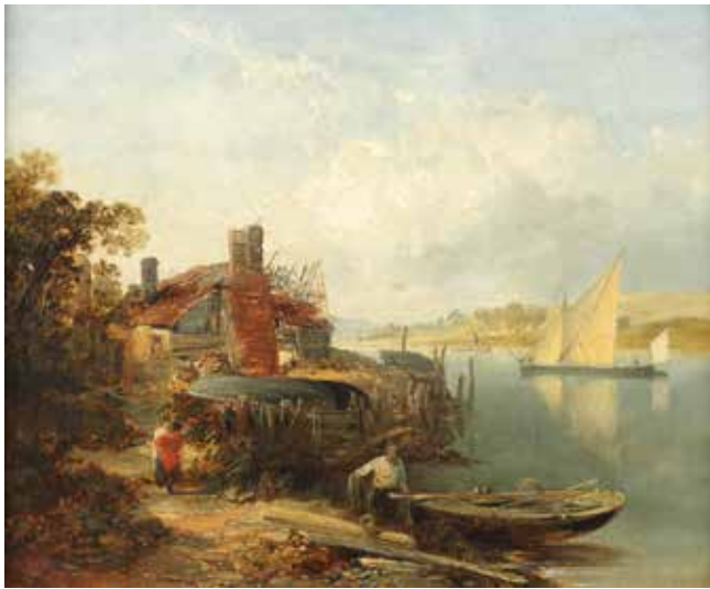
54 ATTRIBUTED TO JOHN CROME (NORWICH 1768-1821) A fisherman before a river, possibly The Medway, near Rochester bears signature 'J.Crome' (lower left) oil on board 29.6 x 35.2cm (11 5/8 x 13 7/8in). £800 - 1,200 €930 - 1,400

See Bonhams.com for further footnote on this lot