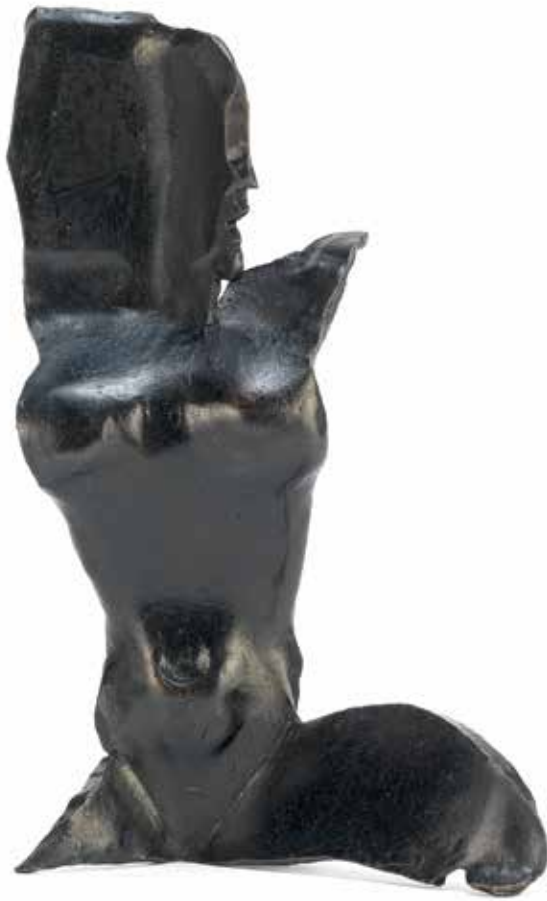
237 ALLEN JONES (BRITISH, 1937): A PATINATED BRONZE OF A FEMALE HEAD AND TORSO IN PROFILE AR signed, dated and numbered Allen Jones 93 2/10 , dark brown patina, 22cm high £2,000 - 3,000 €2,300 - 3,500

See Bonhams.com for further footnote on this lot