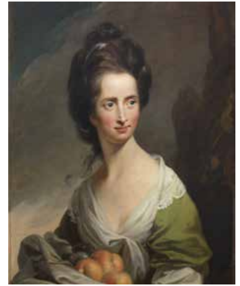
59 ATTRIBUTED TO ROBERT EDGE PINE (LONDON CIRCA 1733-1788 PHILADELPHIA) Portrait of a lady carrying fruit oil on canvas 69.1 x 54.5cm (27 3/16 x 21 7/16in). £1,000 - 1,500 €1,200 - 1,700