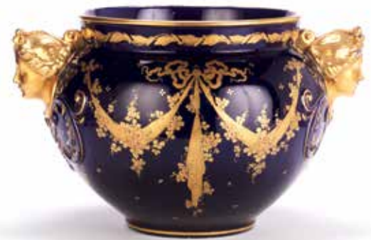
468 A LATE 19TH CENTURY FRENCH FAIENCE COBALT BLUE AND GILT GLAZED JARDINIERE the bulbous body with relief cast female mask handles and ribbon tied draped floral garland decoration, the base with printed factory mark, 31cm high £600 - 800 €700 - 930