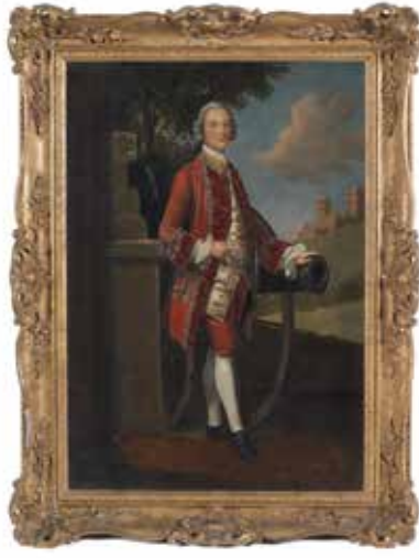
39 *ENGLISH SCHOOL, 18TH CENTURY Portrait of a gentleman, full-length oil on canvas 51.1 x 35.6cm (20 1/8 x 14in). £1,000 - 1,500 €1,200 - 1,700