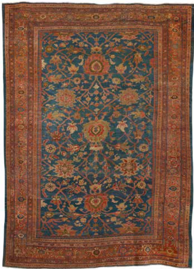
376 A ZIEGLAR CARPET TP West Persia, 437cm x 310cm £4,000 - 6,000 €4,600 - 7,000