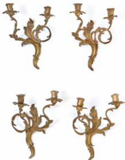
519 A SET OF FOUR LATE 19TH / EARLY 20TH CENTURY FRENCH GILT BRONZE TWIN LIGHT WALL APPLIQUES in the Louis XV style the asymmetric acanthus scrolling arms with leafy nozzles and drip pans, issuing from corresponding backplates, later drilled for electricity, 32cm high (4) £500 - 800 €580 - 930