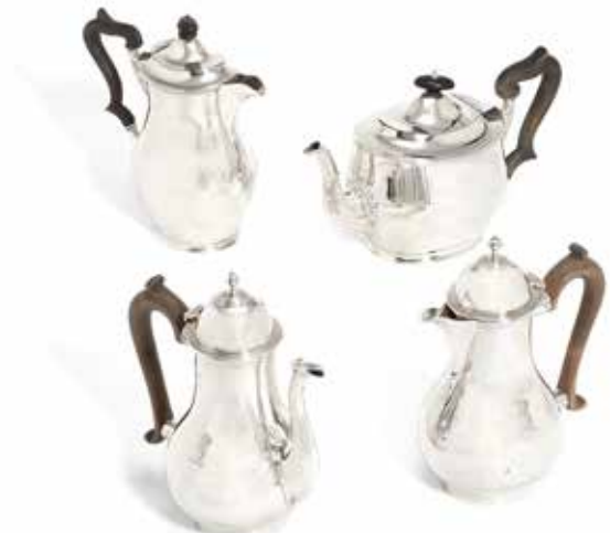
127 A PAIR OF SILVER CAFÉ AU LAIT POTS by Goldsmiths & Silversmiths Co Ltd, London 1914 / 1915 Pear form, with wooden handles, crested, height 21cm; together with a teapot and coffee pot, by Elkington & Co, Birmingham 1909, weight total 83.5oz. (4) £700 - 900 €810 - 1,000