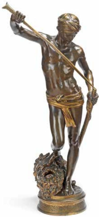
366 JEAN ANTONIN MERCIÉ (FRENCH, 1845-1916): A GILT AND PATINATED BRONZE TP FIGURE OF DAVID VAINQUEUR cast by Barbedienne the circular base signed A. Mercié , the rear inscribed F. Barbedienne, Fondateur. Paris , and with Collas reduction mécanique pastille mark, 92.5cm high approximately £2,500 - 3,500 €2,900 - 4,100

See Bonhams.com for further footnote on this lot