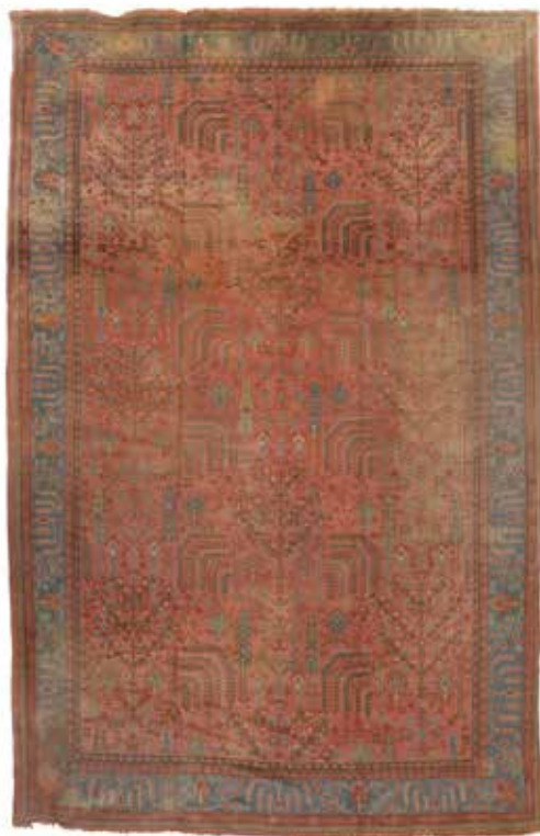
374 AN USHAK CARPET

TP North India, 492cm x 366cm £2,500 - 3,500 €2,900 - 4,100