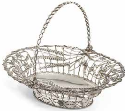
157 A GEORGE III SILVER SWING-HANDLE BREAD BASKET by Richard Meach, London 1770 Oval, the pierced sides decorated with ears of wheat and flowers, length 34cm, weight 25oz. £800 - 1,000 €930 - 1,200