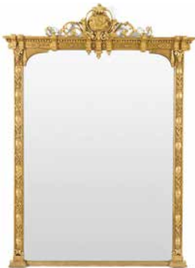
493 A LARGE LATE VICTORIAN GILTWOOD AND COMPOSITION OVERMANTEL MIRROR TP with musical and military trophy pendant angles alternating with various classical profile cartouches, the scrolled foliate cresting centred by Triton seated in a hippocamp-drawn conch shell, 217cm high x 161cm wide. £1,800 - 2,500 €2,100 - 2,900