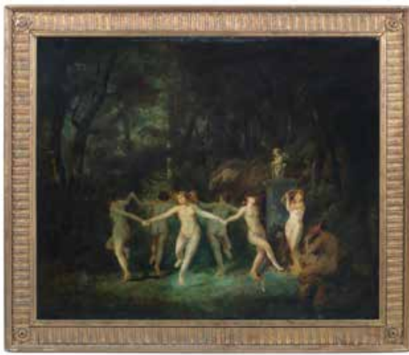
9 FRENCH SCHOOL, 19TH CENTURY A faun and nymphs in a woodland glade oil on panel 62.3 x 76.2cm (24 1/2 x 30in). £600 - 800 €700 - 930