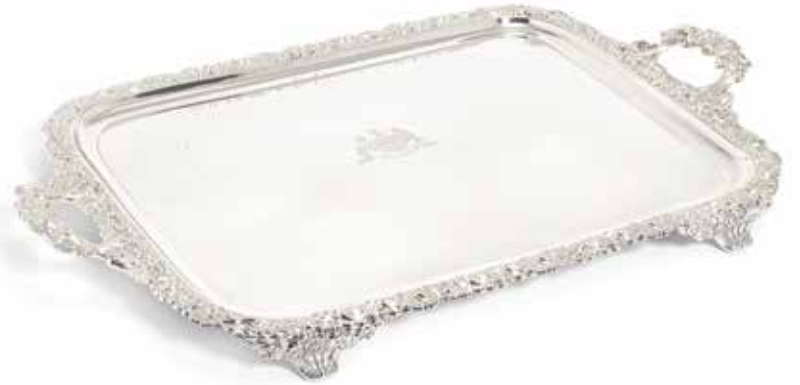
180 A GEORGE IV SILVER TWO-HANDLED TRAY by John & Thomas Settle, Gunn & Co, Sheffield 1827 Shaped-rectangular form with profuse acanthus border and handle, centred with an engraved coat of arms, length handle to handle 74.5cm, weight 171oz. £2,500 - 3,500 €2,900 - 4,100