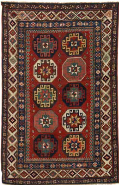
383 A MOGHAN RUG

TP Persia/Kurdistan, 385cm x 265cm £1,000 - 1,500 €1,200 - 1,700