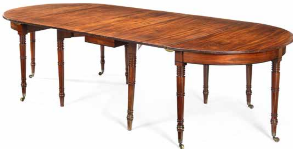
365 A REGENCY MAHOGANY AND EBONISED LINE-INLAID DINING TABLE TP comprising one double drop-leaf table and two demi-lune ends, on ten ring turned tapering legs, six legs with brass cappings and castors, 259cm wide x 115cm deep x 72.5cm high, (101 1/2in wide x 45in deep x 28 1/2in high) £2,000 - 3,000 €2,300 - 3,500

See Bonhams.com for further footnote on this lot