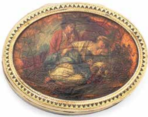
92 A LOUIS XVI GOLD, TORTOISESHELL AND VERNIS MARTIN SNUFF BOX with the charge and discharge mark of Jean-Baptiste Fouache, Paris 1777 Oval, the lid with a scene of young lovers, the sides with farmyard birds, length 6.5cm. £1,000 - 1,500 €1,200 - 1,700