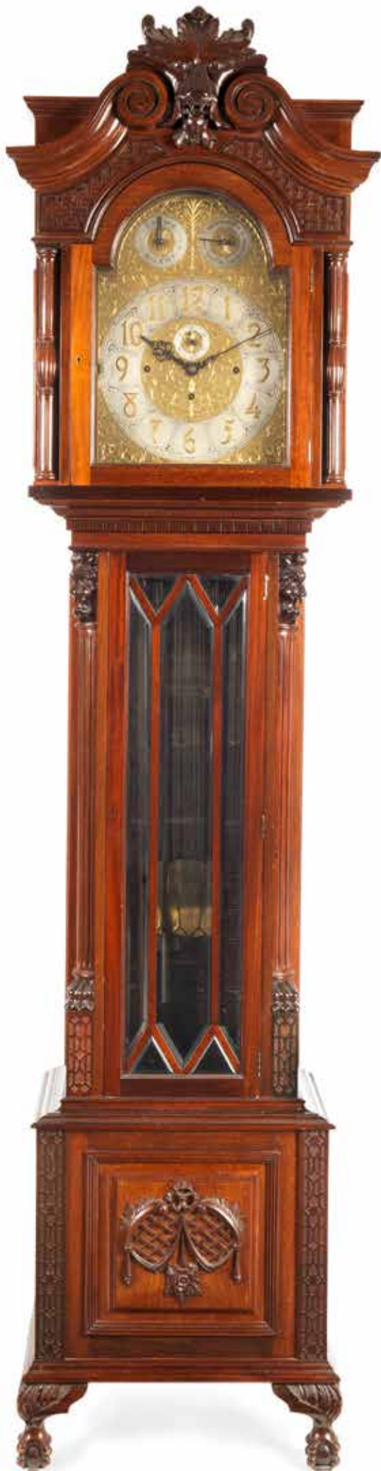
527 AN EDWARDIAN CARVED MAHOGANY MUSICAL LONGCASE CLOCK * the 12" fretted gilt brass arched dial with silvered and gilt Arabic chapter ring and silvered subsidiaries for Chime/Silent, Westminster/Whittington/St. Michael chimes and going seconds, the brass triple train movement with deadbeat escapement and 11" cylinder chiming and striking on nine tubular bells, with pendulum, two case keys and three brass weights, 239cm high overall £1,500 - 2,500 €1,700 - 2,900