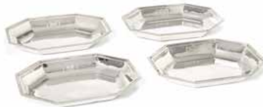
82 A SET OF FOUR GEORGE III ENTRÉE DISHES by William Frisbee, London 1793 rectangular form with canted corners and gadrooned rims, each engraved with an armorial shield, for WALLACE with SIMPSON of Carleton in pretence, length 27cm, weight 77oz. (4) £1,000 - 1,500 €1,200 - 1,700 See Bonhams.com for further footnote on this lot