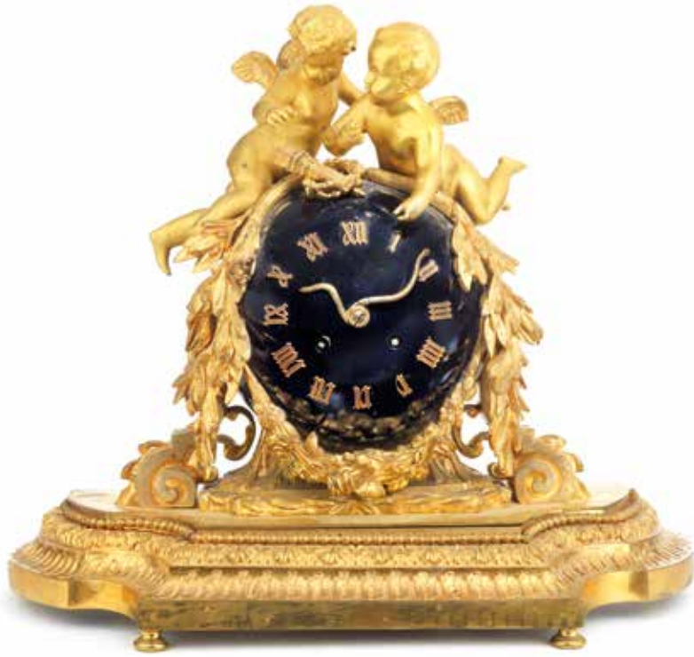
501 A LATE 19TH CENTURY FRENCH GILT BRONZE AND BLUE ENAMELLED FIGURAL GLOBE MANTEL CLOCK the movement stamped Samuel Marti the 5" Roman dial with serpent hands and laurel and floral garland mounts surmounted by a pair of winged putti, on shaped footed plinth base, the brass twin train movement striking on a bell, with pendulum and key, 34cm high £1,000 - 1,500 €1,200 - 1,700