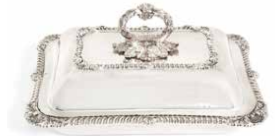
158 A WILLIAM IV SILVER ENTRÉE DISH AND COVER by William Ker Reid, London 1836 Waisted rectangular form, with a gadroon and shell border, the detachable handle formed as two snake heads, length 30cm, weight 69oz. £1,200 - 1,800 €1,400 - 2,100