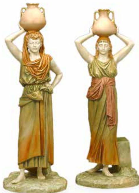
409 A PAIR OF LARGE ROYAL WORCESTER FIGURES OF MOORISH SLAVES, DATED 1894-5 upon rocky mound bases inscribed Hadley to the reverse, 61cm high, printed patent marks and shape numbers 1743 and 1744 (2) £1,000 - 1,500 €1,200 - 1,700 See Bonhams.com for further footnote on this lot