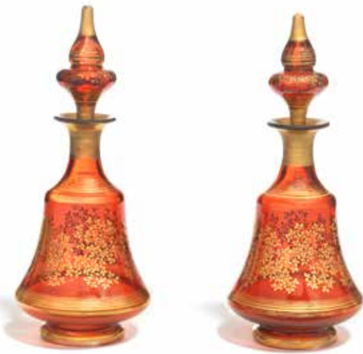
405 A PAIR OF BOHEMIAN RUBY GLASS AND GILT DECORATED DECANTERS AND STOPPERS made for the Turkish market, possibly early 20th century the bell shaped bodies decorative with with flared necks and knopped baluster stoppers, 33cm high approximately (2) £2,000 - 3,000 €2,300 - 3,500