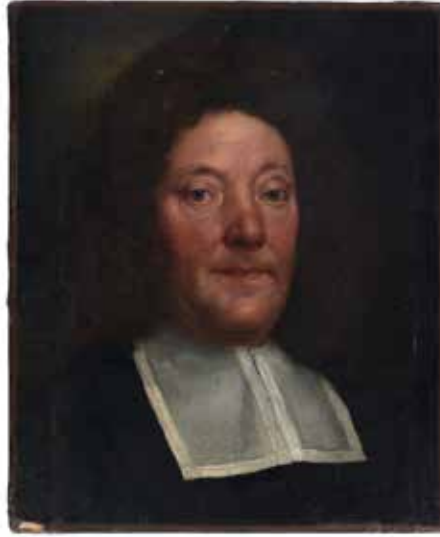
42 DUTCH SCHOOL, CIRCA 1700 Portrait of a gentleman oil on canvas, extended on three sides 46.1 x 37.8cm (18 1/8 x 14 7/8in). unframed £800 - 1,200 €930 - 1,400