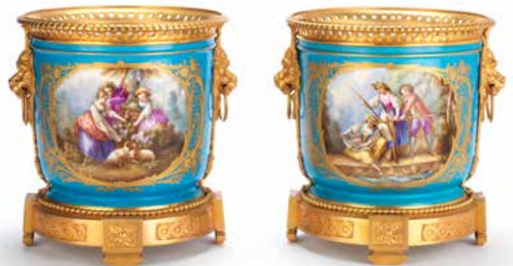
551 A PAIR OF LATE 19TH CENTURY FRENCH GILT BRONZE AND SEVRES STYLE PORCELAIN JARDINIÈRES with lion mask drop ring handles, the bodies painted with oval reserves of figures and bouquets of flowers, reserved on a bleu celeste grounds, raised on guilloche and patera cast footed bases, 28cm high £1,200 - 1,800 €1,400 - 2,100