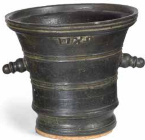
439 A LARGE 18TH CENTURY PATINATED BRONZE MORTAR possibly German of banded flared form with downward knopped twin handles, bearing indistinct applied date 17** , 29cm high, 32cm wide £400 - 600 €460 - 700

See Bonhams.com for further footnote on this lot