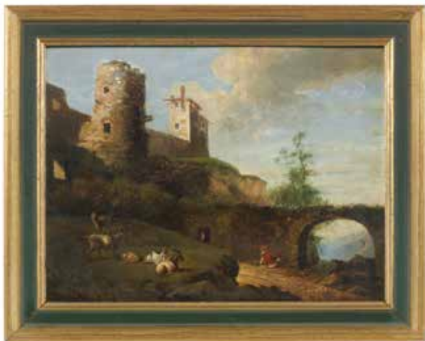
56 DUTCH SCHOOL, 18TH CENTURY An Italianate landscape with figures resting in the foreground oil on panel 22.6 x 34cm (8 7/8 x 13 3/8in). together with another landscape (2) £700 - 1,000 €810 - 1,200