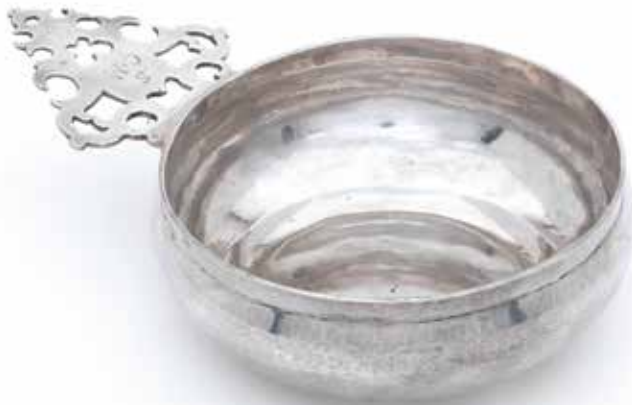
152 A WILLIAM III SILVER PORRINGER by Matthew Madden, London 1701 Circular, with a cast side-handle, length 20cm, weight 8oz. £2,000 - 3,000 €2,300 - 3,500