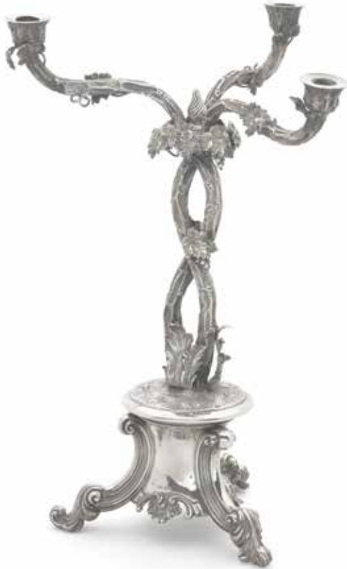
128 A VICTORIAN SILVER THREE-LIGHT CANDELABRUM by Benjamin Smith III, London 1845 The central stem modelled as two entwined fruiting vine branches, the base on three scroll feet, height 57cm, weight 75.5oz. £1,000 - 1,500 €1,200 - 1,700