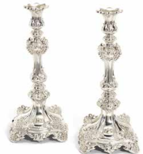
72 A PAIR OF 19TH CENTURY RUSSIAN / UKRANIAN SILVER CANDLESTICKS Kiev circa 1890 With fruiting vine decoration, height 35cm, weight 28oz. (2) £500 - 800 €580 - 930