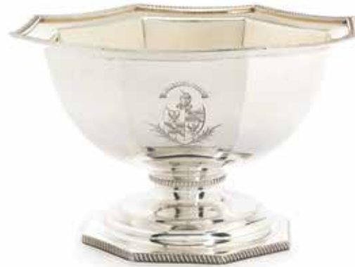
124 A GEORGE III SCOTTISH SILVER BOWL by P Cunningham & Son, Edinburgh 1806 Curved octagonal form, with gadroon borders and gilded interior, engraved with the arms of RAMSAY of Scotland quartering those of CONGALTON of that ilk, diameter 19cm, weight 18.5oz. £700 - 900 €810 - 1,000