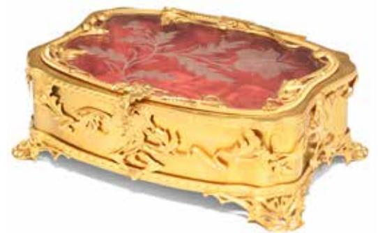
331 AN EARLY 20TH CENTURY FRENCH OR AUSTRIAN GILT BRONZE AND ETCHED GLASS MINIATURE TABLE VITRINE TP of shaped rectangular form with sinuous pierced floriate mounts and feet, the lid decorated with a flower specimen, the interior later lined in grosgrain, 9.5cm high, 27.5cm wide, 17cm deep £1,500 - 1,800 €1,700 - 2,100