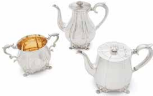
123 A VICTORIAN THREE-PIECE SILVER TEA SERVICE Y by Robert Hennell III, London 1841/42 Φ Comprising a teapot, coffee pot and sugar bowl, cusped circular form with engraved floral decoration the pots with ivory insulators, height of coffee pot 21cm, weight total 62oz. £800 - 1,200 €930 - 1,400