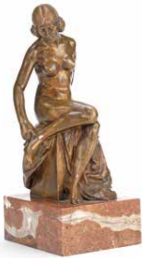
302 EARLY 20TH CONTINENTAL SCHOOL: A PATINATED BRONZE FIGURE OF A NUDE TRYING ON A SHOE seated on a draped plinth, gold brown patina, raised on a veined pink granite plinth base, 31cm high £400 - 600 €460 - 700

See Bonhams.com for further footnote on this lot