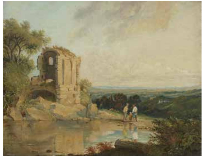
55 ENGLISH SCHOOL, 19TH CENTURY An Italianate landscape with figures before ruins oil on canvas 36.2 x 44.3cm (14 1/4 x 17 7/16in). £600 - 800 €700 - 930

See Bonhams.com for further footnote on this lot