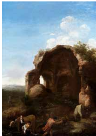
64 CIRCLE OF CORNELIS VAN POELENBURGH (UTRECHT CIRCA 1586-1667) Apollo tending the flocks of Admetus oil on panel 39.8 x 28.8cm (15 11/16 x 11 5/16in). £1,000 - 1,500 €1,200 - 1,700