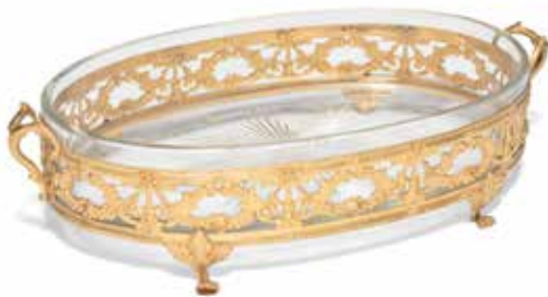
329 A LATE 19TH / EARLY 20TH CENTURY FRENCH GILT BRONZE AND CUT GLASS OVAL CENTREPIECE DISH TP in the Louis XVI taste, the glass possibly by Baccarat with formalised foliate pierced sides and low scrolling handles raised on paw feet, the glass liner with star cut base, 38cm wide £800 - 1,200 €930 - 1,400