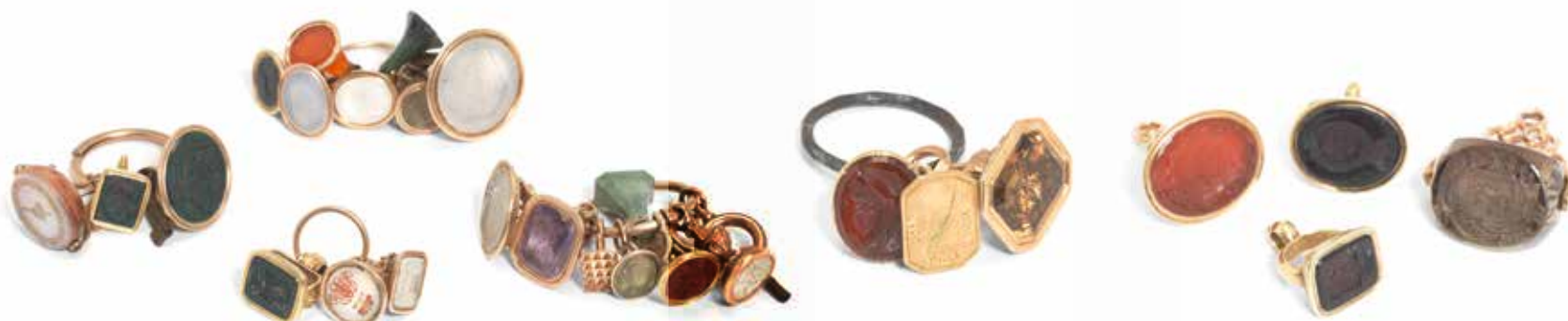
85 A GROUP OF FOB SEALS FROM THE HOPE, HOPETOUN, WALLACE AND DUNDAS FAMILIES Most with hardstone matrices with gold and gilt mounts, some with armorial engraving, other with boudoir mottos. (29) £2,500 - 3,000 €2,900 - 3,500 See Bonhams.com for further footnote on this lot