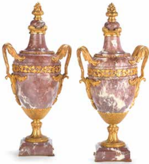
326 A PAIR OF FRENCH GILT BRONZE AND BRECHE VIOLETTE MARBLE GARNITURE URNS in the Louis XVI style TP the ovoid bodies with twin acanthus handles, the swept tops with fruiting acanthus finials on shankered circular pedestals and square plinth bases, 53.5 cm high £1,200 - 1,800 €1,400 - 2,100