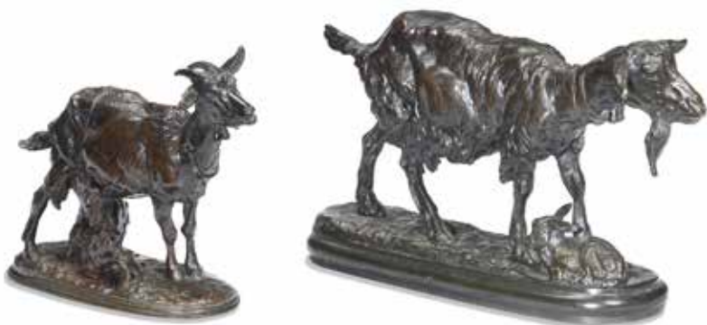
421 EMMANUEL FRÉMIET (FRENCH, 1824-1910): A PATINATED BRONZE MODEL OF A GOAT AND TWO KIDS together with a similar larger patinated bronze model of goat and kid the first on oval naturalistic base with incised signature stamp to the cast E FREMIET , the second on oval base marked FREMIET , 16.5cm high and 17cm high (2) £800 - 1,200 €930 - 1,400