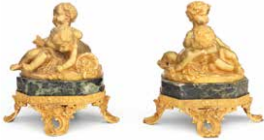
465 A PAIR OF FRENCH GILT BRONZE FIGURAL GROUPS OF TWIN PUTTI possibly late 19th century each group raised on a canted Verde Antico marble plinth and raised on scroll feet, 26.5cm high (2) £1,000 - 1,500 €1,200 - 1,700