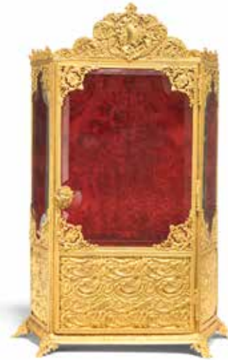
549 A EARLY 20TH CENTURY FRENCH GILT BRASS MINIATURE VITRINE of canted form with inset foliate repousse panels and cresting and bevelled glass windows, the interior fitted a single glass shelf, on scrolling feet, 39cm high £700 - 1,000 €810 - 1,200