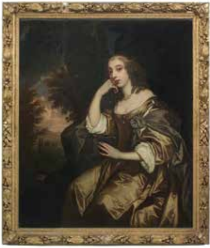
38 CIRCLE OF SIR PETER LELY (SOEST 1618-1680 LONDON) Portrait of a lady, said to be the Duchess of Bedford oil on canvas 75.2 x 63cm (29 5/8 x 24 13/16in). £1,500 - 2,000 €1,700 - 2,300