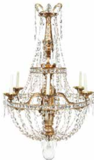
399 A 19TH CENTURY AND LATER ITALIAN GILT WOOD, TP METAL AND CUT GLASS SIX LIGHT TENT AND BAG CHANDELIER with fluted column, urn and baluster central stem and scrolling corona, all hung and strung with faceted beaded chains and prism drops above a ball terminal, 140cm drop approximately £500 - 800 €580 - 930