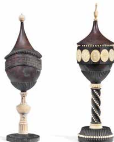
440 A TURNED COCONUT, HARDWOOD, IVORY AND BONE MOUNTED PEDESTAL CUP AND COVER probably German, late 18th / early 19th century with urn finial and oval patera decoration on Holtzapffel style turned and inlaid pedestal base, together with another similar pedestal cup and cover, both as found, 34cm and 31cm high (2) £400 - 600 €460 - 700

See Bonhams.com for further footnote on this lot