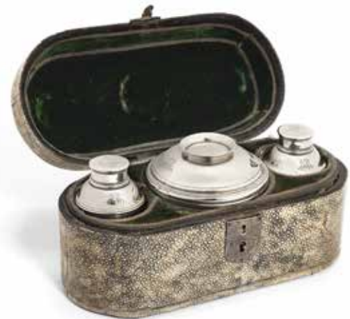
155 AN 18TH CENTURY SHAGREEN CADDY BOX with two unmarked silver caddies, the mixing bowl marked on the base for Francis Crump, London 1742, the cover by John Gamon, London 1729 The case with unmarked silver lock face, hinged carrying handle, interior fitted with two cylindrical caddies, pull-off covers, inside of one marked with a lion passant only, armorial engraved, length of box 26.2cm. £1,500 - 2,000 €1,700 - 2,300 See Bonhams.com for further footnote on this lot