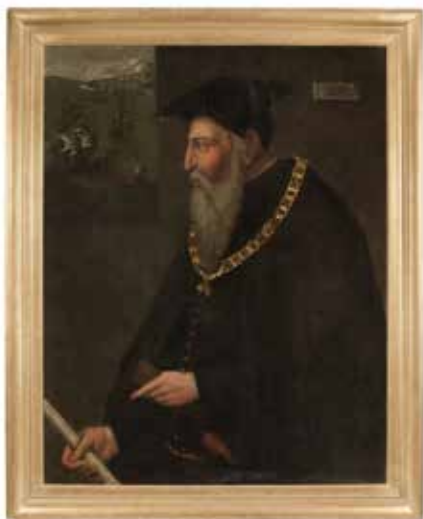
1 ITALIAN SCHOOL, EARLY 17TH CENTURY TP Portrait of Andrea Doria, wearing the Order of the Golden Fleece, inscribed 'Pater Patriae/ Andrea Auri' (on the cartiglio, upper right) oil on canvas 110.3 x 87cm (43 7/16 x 34 1/4in). £2,000 - 3,000 €2,300 - 3,500 See Bonhams.com for further footnote on this lot