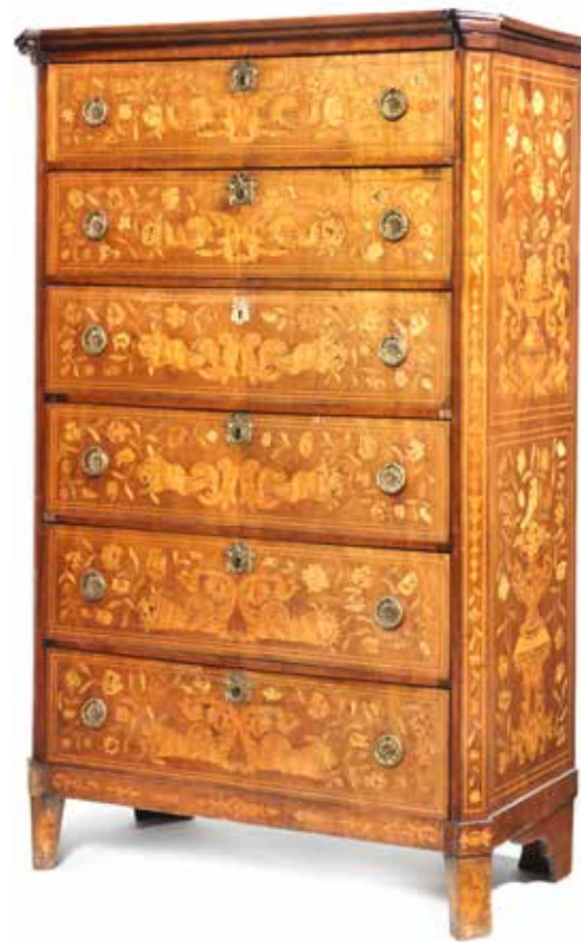
443 A DUTCH EARLY 19TH CENTURY MAHOGANY AND TP FRUITWOOD MARQUETRY TALL CHEST inlaid with urns of flowers, birds, foliage and cornucopia, with six long drawers, 92cm wide x 46cm deep x 145cm high, (36in wide x 18in deep x 57in high) £800 - 1,200 €930 - 1,400