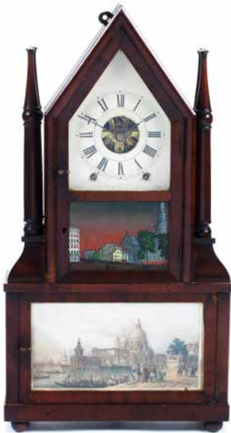
544 A RARE MID 19TH CENTURY AMERICAN SHELF CLOCK WITH 'WAGON SPRING' TP MOVEMENT signed Birge & Fuller, Connecticut with reverse painted and printed glass decoration and 6" painted Roman dial, the twin train movement with part visible skeleton escapement, striking on a gong, 66cms high £1,200 - 1,800 €1,400 - 2,100