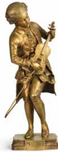
322 PAUL DUBOIS (FRENCH, 1829-1905): A GILT BRONZE FIGURE OF THE YOUNG MOZART TP the young composer holding a violin and bow and standing on shaped rectangular shallow plinth base entitled MOZART , signed P. Dubois , 63cm high £1,500 - 2,000 €1,700 - 2,300