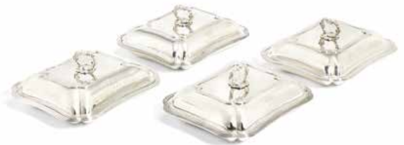
163 A SET OF FOUR GEORGE III ENTRÉE DISHES AND COVERS by John Edington, London 1815, later modified and additional hallmarks for 1849 Rectangular with cusped corners, with removable branch handles, crested, length 28cm, weight 206oz. (4) £2,000 - 3,000 €2,300 - 3,500

See Bonhams.com for further footnote on this lot