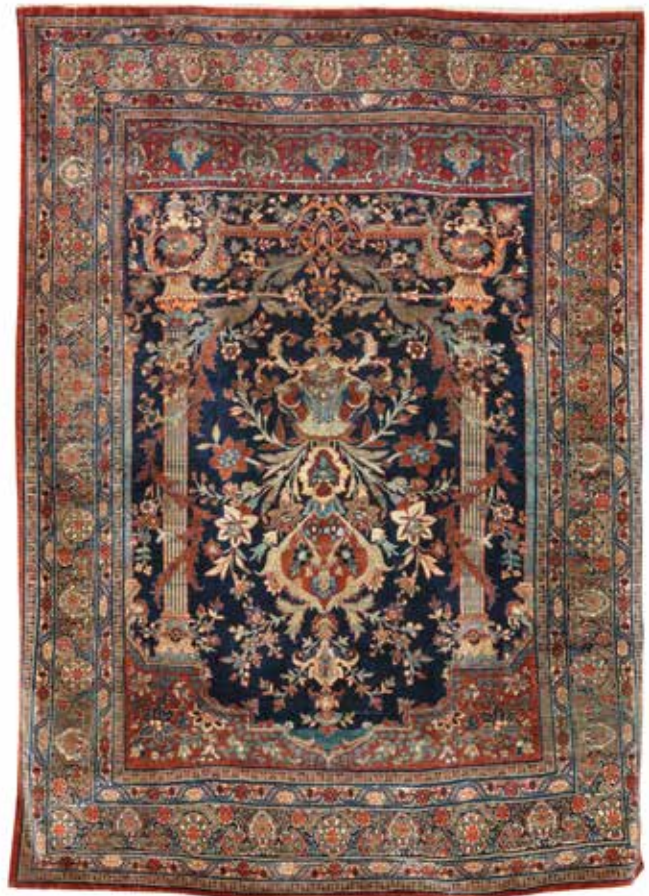
449 A SILK HERIZ RUG TP Central Persia, 166cm x 120cm £3,000 - 5,000 €3,500 - 5,800