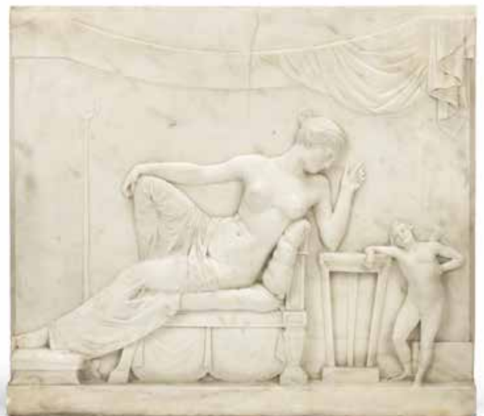
344 A 19TH CENTURY ITALIAN RELIEF CARVED WHITE MARBLE RECTANGULAR TP FIGURAL PLAQUE depicting a semi-clad maiden and a putto beside a brazier probably representing Venus and Cupid within a classical interior, 64cm high, 73cm wide, 6cm deep £1,000 - 1,500 €1,200 - 1,700

See Bonhams.com for further footnote on this lot