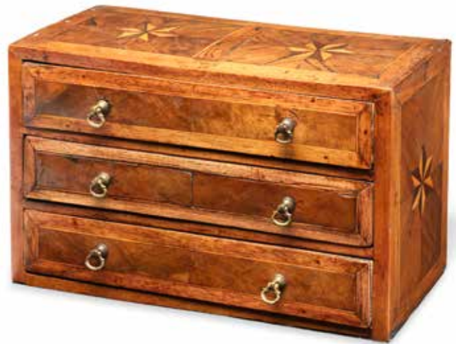
438 AN 18TH CENTURY ITALIAN WALNUT AND FRUITWOOD PARQUETRY TABLETOP MINIATURE COMMODE the top and sides with star inlaid panels, fitted three drawers, 21cm high, 33.5cm wide, 14cm deep £800 - 1,200 €930 - 1,400