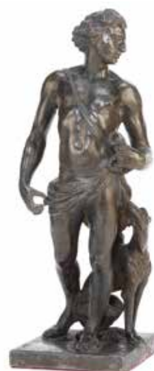
233 A CAST LEAD FIGURAL GROUP OF A ACTAEON AND HIS HOUND the draped figure holding a hunting horn, standing on a square base, 43cm high £400 - 600 €460 - 700