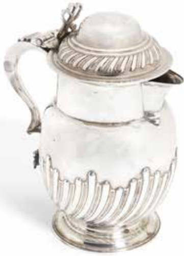
120 A SILVER TANKARD CONVERTED INTO A JUG with cancelled marks for London 1772, and London hallmarks for 2017 Ovoid with a double scroll handle, height 22.5cm, weight 28oz. £300 - 500 €350 - 580