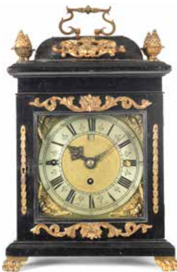
540 AN 18TH CENTURY AND LATER EBONISED QUARTER STRIKING TABLE CLOCK the dial signed John Martin, London with signed chapter ring now cut to take the altered triple fusee movement with anchor escapement (pendulum and quarter bells lacking) striking the hours on a bell, the movement signed within a foliate cartouche, 42cms high £1,000 - 1,500 €1,200 - 1,700