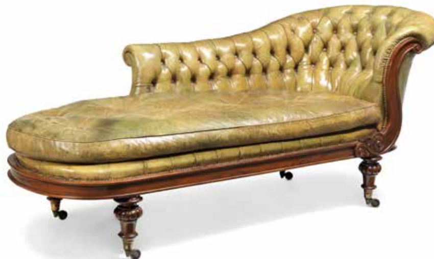
325 AN EARLY VICTORIAN ROSEWOOD CHAISE LONGUE TP with a scrolled end support, on lobed and ring turned tapering legs terminating in brass cappings and castors, 196cm wide. Y £2,000 - 3,000 €2,300 - 3,500