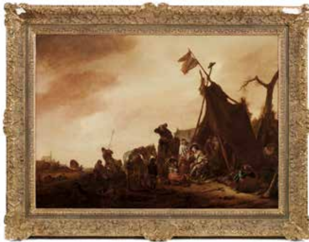
11 CIRCLE OF PHILIPS WOUWERMAN (HAARLEM 1619-1668) Soldiers before an encampment oil on panel 55.8 x 77.8cm (21 15/16 x 30 5/8in). £1,000 - 1,500 €1,200 - 1,700

See Bonhams.com for further footnote on this lot