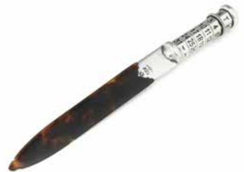
97 A SILVER AND TORTOISESHELL NOVELTY CALENDAR PAPERKNIFE by Mappin & Webb, Birmingham 1932 The perpetual calendar with enamel numbers and letter, length 17.5cm. £300 - 500 €350 - 580