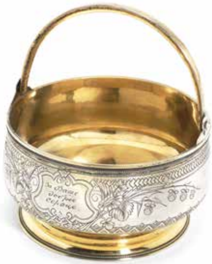
66 A RUSSIAN PARCEL-GILT SILVER BOWL maker's mark BVI, Moscow 1896 With a swing-handle, engraved with floral decoration, diameter 12cm, weight 10oz. £500 - 700 €580 - 810