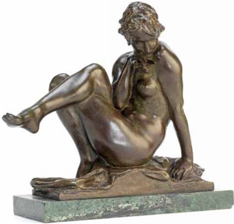
225 SIR WILLIAM REID DICK (BRITISH, 1879-1961): A PATINATED BRONZE FIGURE OF 'THE WOOD NYMPH the seated female nude with crossed legs and downcast face, on stylised rectangular base, signed and dated to the front Reid Dick 1920 , brown patina, raised on a veined green marble shallow plinth, 28cm high £3,000 - 5,000 €3,500 - 5,800

See Bonhams.com for further footnote on this lot