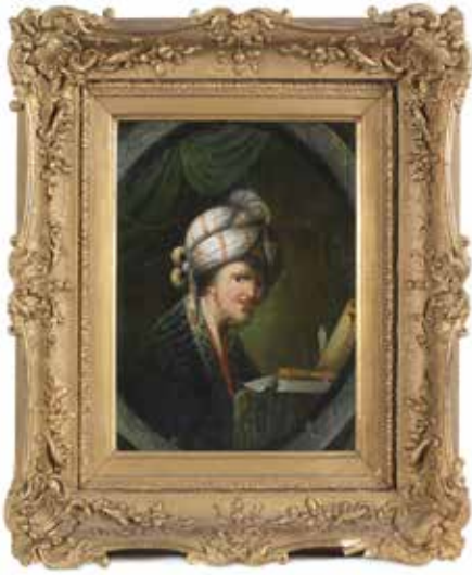
41 GERMAN SCHOOL, 18TH CENTURY Portrait of a gentleman with a turban oil on canvas 30.6 x 24.2cm (12 1/16 x 9 1/2in). £800 - 1,200 €930 - 1,400

See Bonhams.com for further footnote on this lot