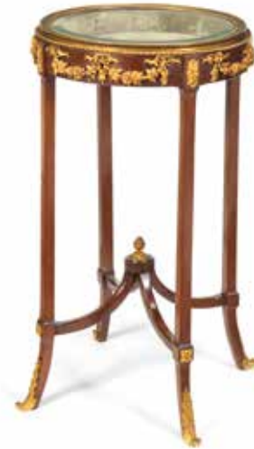
324 A FRENCH LATE 19TH CENTURY GILT BRONZE MOUNTED MAHOGANY BIJOUTERIE TABLE TP enclosing a velvet interior, the frieze mounted with ribbon tied floral garlands, terminating in acanthus capped scroll sabots, 42cm wide x 42cm deep x 76cm high, (16 1/2in wide x 16 1/2in deep x 29 1/2in high) £800 - 1,200 €930 - 1,400