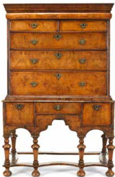
432 A GEORGE I WALNUT CHEST ON STAND TP the cushion frieze drawer above two short and three long graduated drawers, over three drawers, on six ring turned legs, with elm stretchers, 104cm wide x 56cm deep x 156cm high, (40 1/2in wide x 22in deep x 61in high) £800 - 1,200 €930 - 1,400