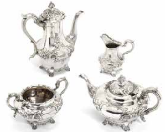
125 A SCOTTISH VICTORIAN FOUR-PIECE SILVER TEA AND COFFEE SERVICE Y maker's mark L&S, Edinburgh 1844 Φ Squat baluster form, with embossed floral and scroll decoration, the pot handles with ivory insulators, crested, height of coffee pot 27.5cm, weight 89oz. (4) £1,000 - 1,500 €1,200 - 1,700