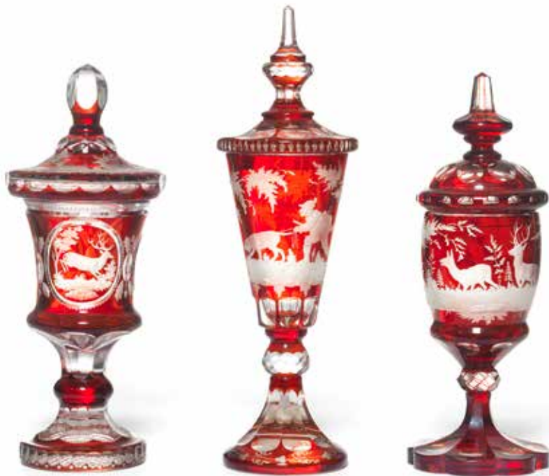
368 THREE LATE 19TH / EARLY 20TH CENTURY BOHEMIAN FLASHED RUBY AND CUT GLASS PEDESTAL CUPS AND COVERS all with typical stag hunting decoration, the covers with faceted finials, one with engraved twin oval panelled decoration, the remaining two etched with continuous hunting landscapes, 34cm, 35cm and 39cm high approximately (3) £1,000 - 1,500 €1,200 - 1,700