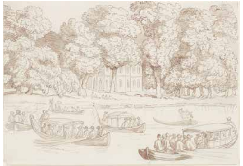
35 THOMAS ROWLANDSON (LONDON 1756-1827) Figures boating before a country house pencil, pen and ink on paper 12 x 17.2cm (4 3/4 x 6 3/4in). with three others by the same hand (4) £1,000 - 1,500 €1,200 - 1,700