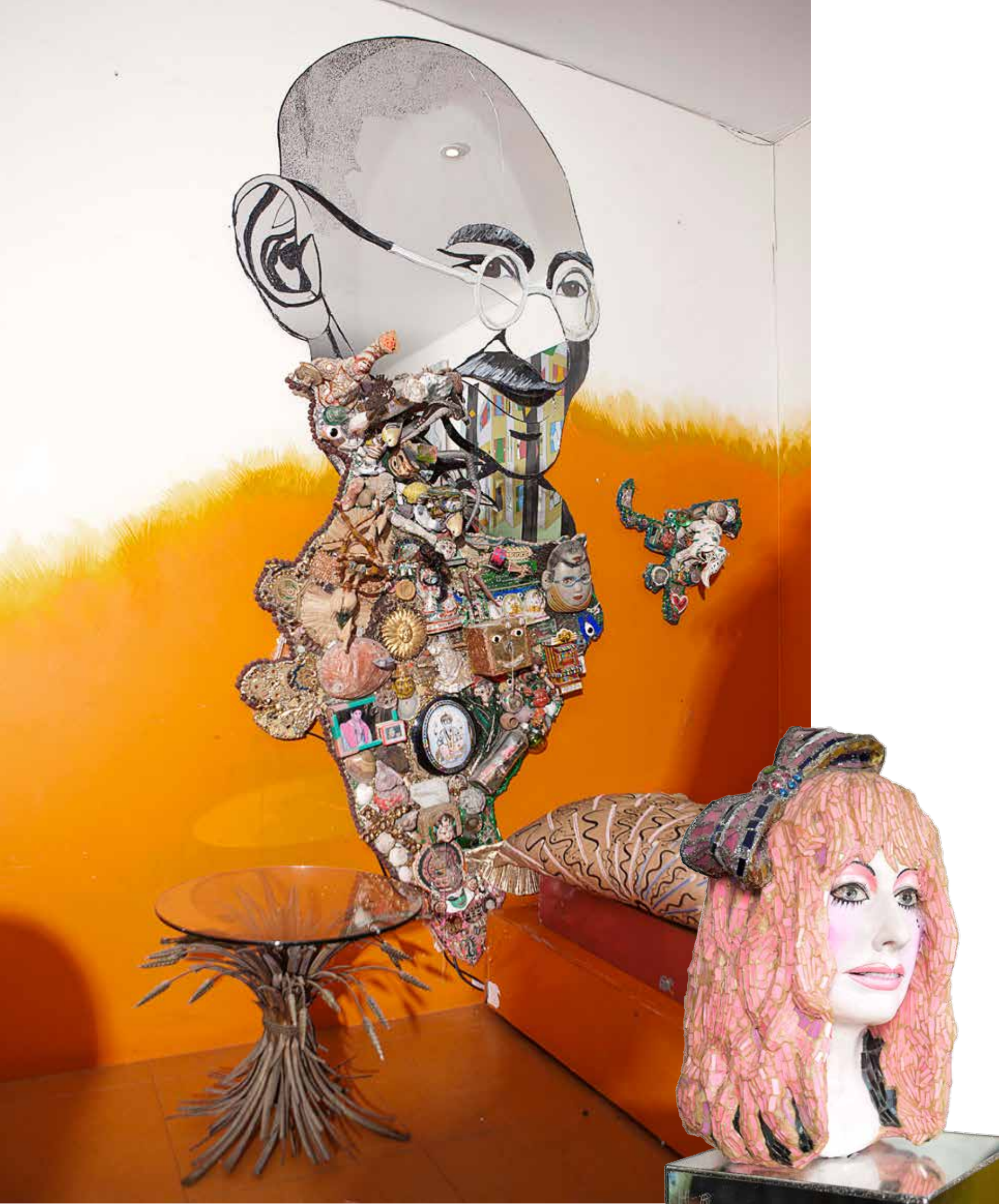
Rhodes and Andrew Logan "share a similar sense of fun" and the artist's work is well represented throughout the flat, including this supersize collage of Gandhi and (Inset) portrait bust of Rhodes, a copy of one in the National Portrait Gallery