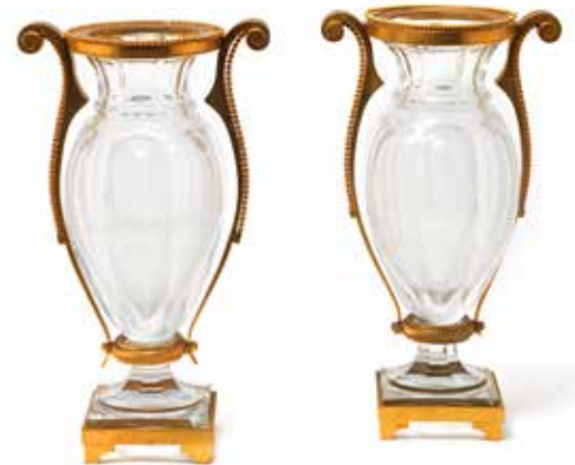
517 A PAIR OF EARLY 20TH CENTURY BACCARAT GILT BRONZE MOUNTED CUT GLASS CLEAR VASES of faceted ovoid pedestal form with flared necks and beaded twin scrolling handles on detachable footed square bases, acid etched factory marks to bases, old chips to bases, 39cm high (2) £400 - 600 €460 - 700

See Bonhams.com for further footnote on this lot