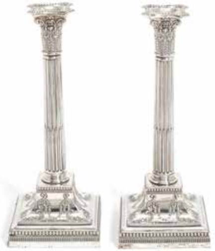
130 A PAIR OF EDWARDIAN SILVER CANDELTICKS by James Dixon & Sons, Sheffield 1902 Corinthian column form, with removable drip-pans, the filled bases with scroll and gadroon decoration, height 33cm. (2) £800 - 1,200 €930 - 1,400