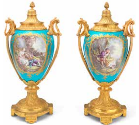
328 A PAIR OF LATE 19TH CENTURY FRENCH GILT BRONZE MOUNTED SÈVRES STYLE PORCELAIN GARNITURE VASES TP with beaded acanthus and floral wreath handles, the spiral fluted covers with fruiting finials, the bleu turquin ovoid bodies painted with reserves of courtly lovers and floral bouquets, 45.5cm high £3,000 - 5,000 €3,500 - 5,800

See Bonhams.com for further footnote on this lot