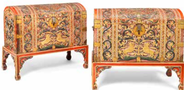
415 A PAIR OF SPANISH OR ITALIAN EARLY 20TH CENTURY POLYCHROME TP DECORATED CARVED WOOD CASSONES ON STANDS each profusely carved with lions, scrolled stylised foliage, each hinged lid centred by the coat of arms of the Aragon family, 118cm wide x 65cm deep x 106cm high, (46in wide x 25 1/2in deep x 41 1/2in high) (2) £800 - 1,200 €930 - 1,400

See Bonhams.com for further footnote on this lot