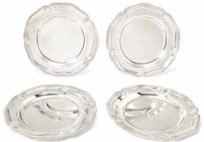
167 A SET OF FOUR GEORGE III SILVER SERVING DISHES by William Frisbee, London 1805 Cusped circular form, with gadroon borders, diameter 30cm, weight 139oz. £1,800 - 2,200 €2,100 - 2,500