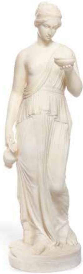
327 AFTER BERTEL THORVALDSEN (DANISH, 1770-1844): A LATE 19TH CENTURY ITALIAN CARVED ALABASTER FIGURE OF HEBE TP the goddess holding a bowl and a ewer and standing on a circular base, 62cm high £1,000 - 1,500 €1,200 - 1,700

See Bonhams.com for further footnote on this lot