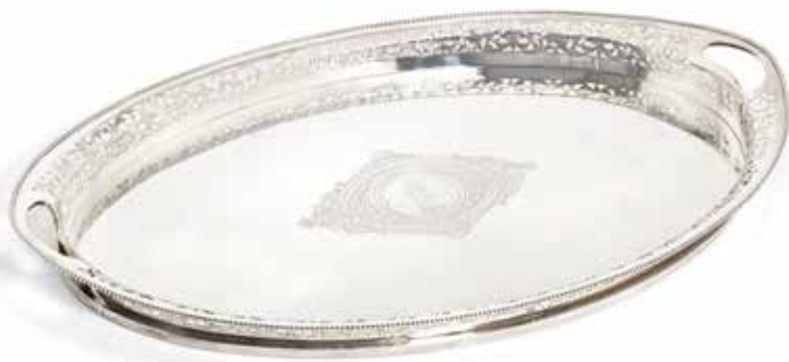
181 A VICTORIAN SILVER PIERCED GALLERIED TWO-HANDLED TRAY by Henry Stratford, London 1894 Oval form, the flared gallery pierced with scrolls, bead rim and integral handles, the centre engraved reserve with inscription "Presented to Prof Victor Alexander Haden Horsley FRS 1894" around the obverse of royal society medal depicting the Statue of Sir Isaac Newton, length 68cm, weight 140oz. £1,500 - 2,000 €1,700 - 2,300 See Bonhams.com for further footnote on this lot