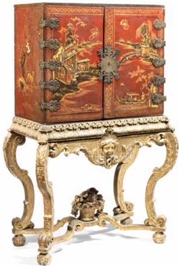
359 AN EARLY 18TH CENTURY JAPANNED CABINET ON A 19TH CENTURY CARVED TP GILT GESSO STAND enclosing fourteen drawers, on a stand carved with scrolled acanthus, rocaille , flowers and a mask, with an imbricated apron, 91cm wide x 51cm deep x 140cm high, (35 1/2in wide x 20in deep x 55in high) £3,000 - 5,000 €3,500 - 5,800