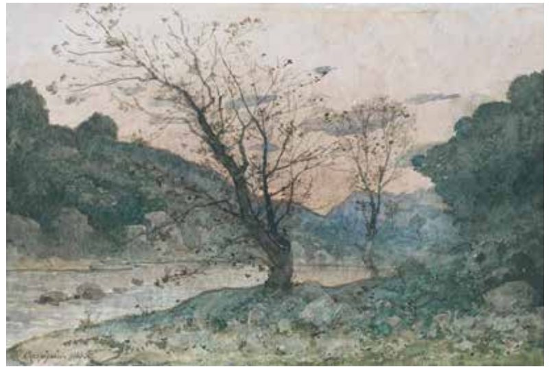
29 HENRI JOSEPH HARPIGNIES (FRENCH, 1819-1916) 'Souvenir du Saut-du-Loup' signed and dated 'h'harpignies 1883' (lower left) and bears inscription (on reverse) watercolour on paper laid down on card 37 x 54.7cm (14 9/16 x 21 9/16in). unframed £700 - 1,000 €810 - 1,200