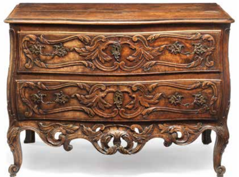
360 A LOUIS XV PROVINCIAL CARVED BEECHWOOD SERPENTINE COMMODE TP the moulded top above two scrolled acanthus, rocaille and C-scroll carved long drawers, on cabriole legs terminating in scroll feet, 126cm wide x 69cm deep x 93cm high, (49 1/2in wide x 27in deep x 36 1/2in high) £2,000 - 2,500 €2,300 - 2,900