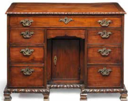
428 A GEORGE III YEW WOOD KNEEHOLE DESK TP possibly Irish, the top with a gadroon carved edge above one long frieze drawer and apron drawer, over six drawers flanking the recessed door, on later base and later feet, 110cm wide x 59cm deep x 83.5cm high, (43in wide x 23in deep x 32 1/2in high) £1,000 - 1,500 €1,200 - 1,700