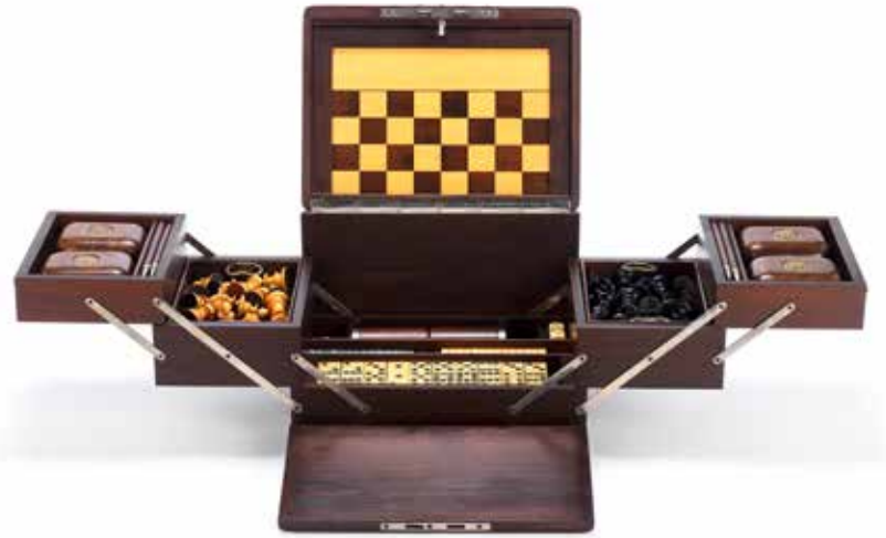
522 A LATE 19TH CENTURY AUSTRIAN COLONIAL GILT BRASS MOUNTED POLISHED PADOUK OR TEAK GAMES COMPENDIUM retailed by Franz Hiess Söhne, Wien with drop ring handles and elaborate fret pierced and engraved strapwork mounts on paw feet, the lid and fall front opening to a compartmented containing various gaming accoutrements, with key, 22cm high, 28cm wide, 20cm deep £800 - 1,200 €930 - 1,400 See Bonhams.com for further footnote on this lot