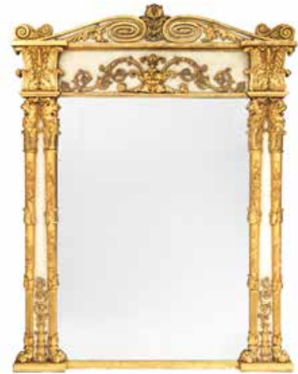
492 A LARGE ITALIAN MID 19TH CENTURY GILTWOOD, GILT GESSO AND PAINTED OVERMANTEL MIRROR TP with two twin acanthus wrapped columns headed with opposing lion busts below Corinthian capitals, centred by a scrolled foliate frieze, surmounted by a twin scrolled corbel pediment, 192cm high x 169cm wide. £2,000 - 3,000 €2,300 - 3,500