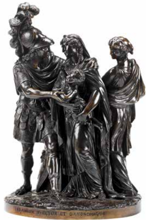
342 A LATE 18TH/EARLY 19TH CENTURY FRENCH BRONZE FIGURAL GROUP DEPICTING HECTOR BIDDING FAREWELL TO ANDROMACHE AND ASTYANAX on oval naturalistic base, inscribed to the cast 'LES ADIEUX D'HECTOR ET ANDROMAQUE', dark brown patination, 48cm high £5,500 - 6,500 €6,400 - 7,500