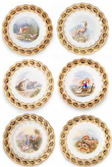
408 AN EXTENSIVE COALPORT DESSERT SERVICE, CIRCA 1870 the centres painted with a variety of animal and figural subjects including kittens, terriers, camels and donkeys, comprising 18 plates, 4 low comports and 3 tall comports with gilded centres, plates 23.5cm diam, pattern 7/969 in gold (two plates cracked) (25) £600 - 800 €700 - 930