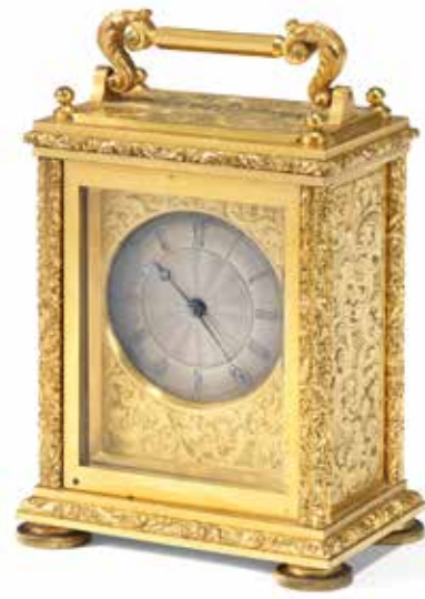
528 A GOOD MID 19TH CENTURY ENGRAVED AND LACQUERED BRASS TRAVELLING TIMEPIECE signed Viner & Co., Royal Exchange, London and numbered 480 the 2.25" silvered Roman dial with engine turned centre and blued steel moon hands, the movement with rectangular plates and spring barrel set on a separate bridge, signed on the cock to the mono-metallic balance, 10.5cms high £1,800 - 2,200 €2,100 - 2,500