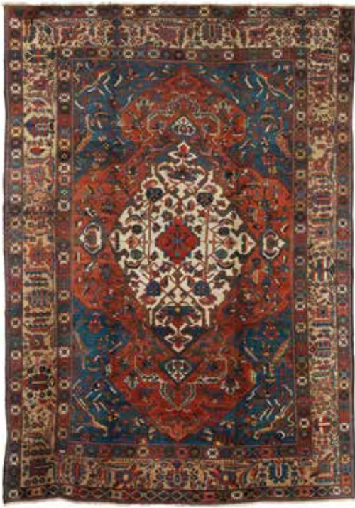
380 A BAKHTIAR CARPET

TP West Persia, 485cm x 339cm £1,000 - 1,500 €1,200 - 1,700