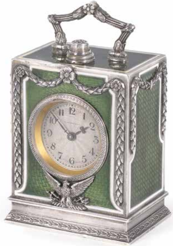
543 A FINE AND RARE EARLY 20TH CENTURY SILVER AND GUILLOCHE ENAMEL MINUTE REPEATING TIMEPIECE retailed by Tiffany and Co, the case numbered 89669 the silver and engine turned green enamel rectangular case with cast harebell swags and white line borders, the 1" engine turned Arabic dial with outer minute track above an eagle mount, the spring driven keyless movement operated from the base, 8.5cms high £4,000 - 6,000 €4,600 - 7,000