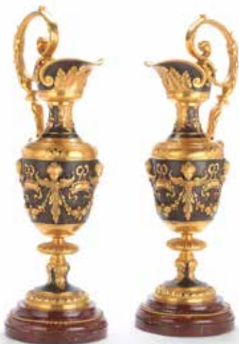
550 A PAIR OF PATINATED AND GILT BRONZE RENAISSANCE STYLE GARNITURE URNS TP the bodies of pedestal ewer form with winged putto and fruiting garland decoration and high scrolling acanthus handles, mounted on rouge marble socles, 60.5cm high £1,500 - 2,500 €1,700 - 2,900