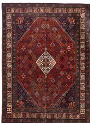
457 A JOSHEGAN CARPET

TP Central Persia, 141cm x 221cm £500 - 700 €580 - 810