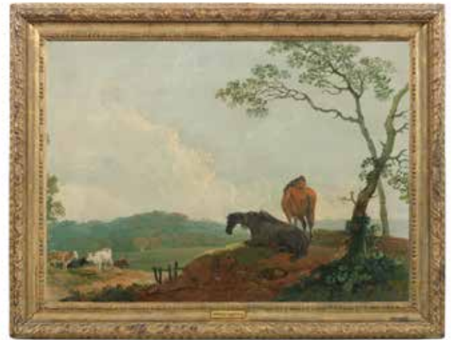
48 ENGLISH SCHOOL, 19TH CENTURY Horses and cattle in a landscape oil on canvas 52.5 x 72cm (20 11/16 x 28 3/8in). £1,000 - 1,500 €1,200 - 1,700