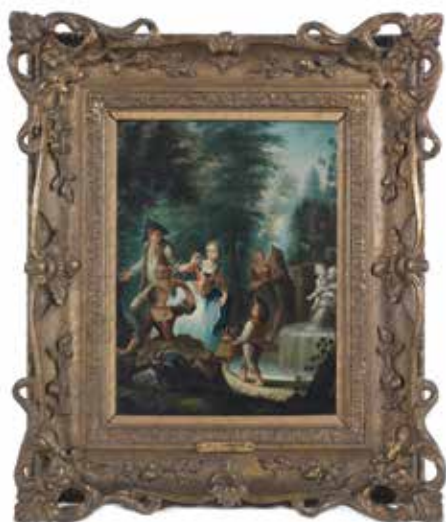
4 GERMAN SCHOOL, 18TH CENTURY Figures resting before a fountain, eating fruit; and Figures resting before a stream a pair, oil on panel 29.6 x 23.2cm (11 5/8 x 9 1/8in). (2) £2,000 - 3,000 €2,300 - 3,500