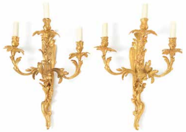
490 A PAIR OF GILT BRONZE THREE LIGHT WALL APPLIQUES TP in the Louis XV style the foliate cast nozzles with leafy drip pans on asymmetric acanthus scrolling arms, all issuing from corresponding backplates, fitted for electricity, 70cm high overall (2) £800 - 1,200 €930 - 1,400