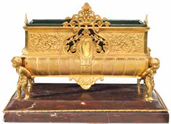
337 A LATE 19TH CENTURY FRENCH GILT BRONZE AND ROUGE GRIOTTE MARBLE TP JARDINIÈRE of rectangular form, the foliate cast bulbous sides with pierced scrolling central cartouche motifs, raised on putto supports on a moulded base, the interior fitted a green painted liner, 30cm high, 47cm wide, 28cm deep £1,500 - 2,500 €1,700 - 2,900