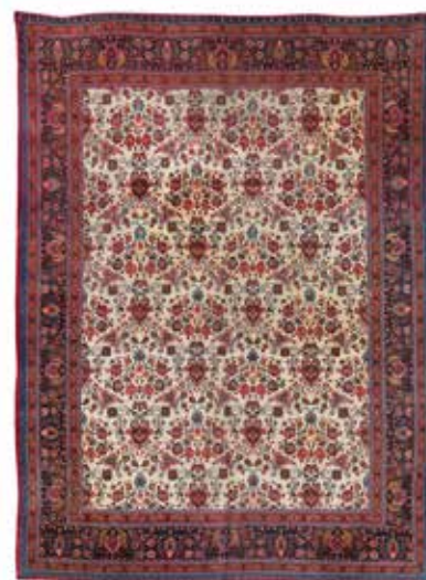
458 A BIRJAND CARPET

TP Central Persia, 320cm x 237cm £1,000 - 1,500 €1,200 - 1,700