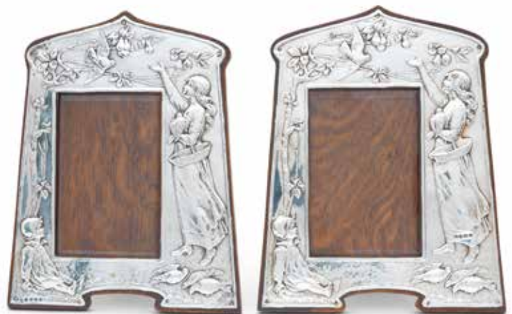
99 A PAIR OF SILVER MOUNTED PHOTOGRAPH FRAMES by Charles S. Green & Co, Birmingham 1907 and 1911 Upright shaped-rectangular form, the silver mount embossed with two young children, one arm outstretched towards a blossoming pear tree, with birds, oak backs and easels, height 25cm. £1,800 - 2,200 €2,100 - 2,500