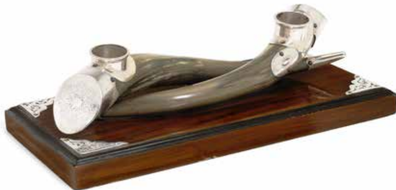
98 A SILVER AND HORN CANDLE HOLDER probably Scottish, circa 1890 The two overlapping cow horns with silver mounts, on a silver-mounted wooden base, length 40cm. £500 - 600 €580 - 700