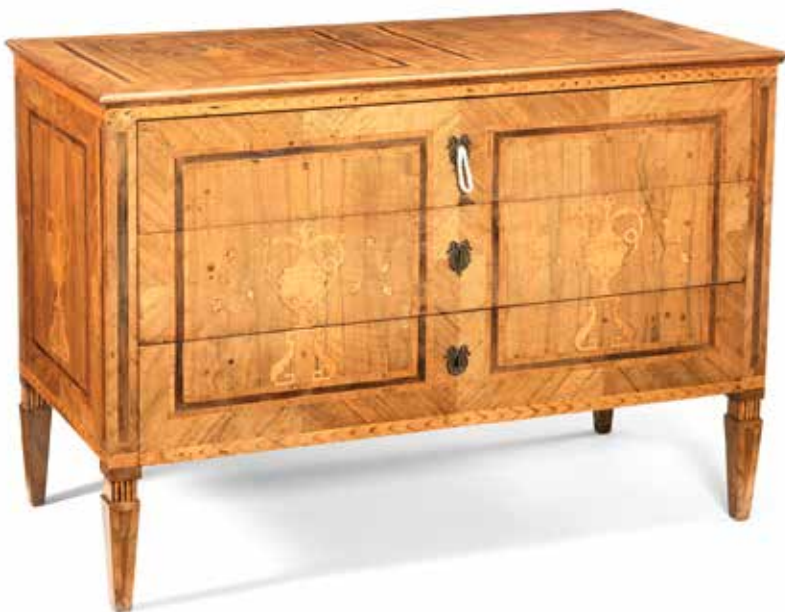
334 AN ITALIAN LATE 18TH CENTURY WALNUT, TULIPWOOD BANDED AND TP FRUITWOOD MARQUETRY COMMODE inlaid with neoclassical urns issuing scrolled foliage and flowers, with three long drawers inlaid sans traverse , on square tapering legs, 123cm wide x 57cm deep x 85cm high, (48in wide x 22in deep x 33in high) £2,000 - 3,000 €2,300 - 3,500