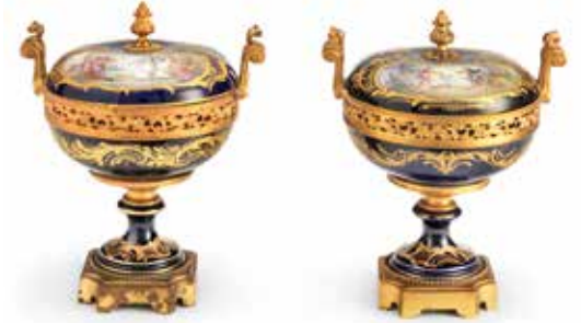
467 A PAIR OF LATE 19TH CENTURY FRENCH GILT BRONZE AND SEVRES STYLE PORCELAIN BRULES PARFUM GARNITURE VASES AND COVERS of squat ovoid form with foliate pierced borders, scrolling handles and knopped finials, the bleu de roi grounds painted with figural and scenic panels on cut corner square pedestal bases, 27.5cm high (2) £800 - 1,200 €930 - 1,400