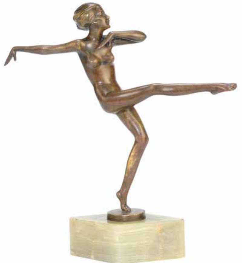
286 JOSEF LORENZL (AUSTRIAN 1892-1950): A GILT BRONZE FIGURE OF A STYLISED DANCING GIRL, the nude figure on circular base signed Lorenzl , gilt gold patina, raised on a square onyx plinth, 30cm high £800 - 1,200 €930 - 1,400

See Bonhams.com for further footnote on this lot