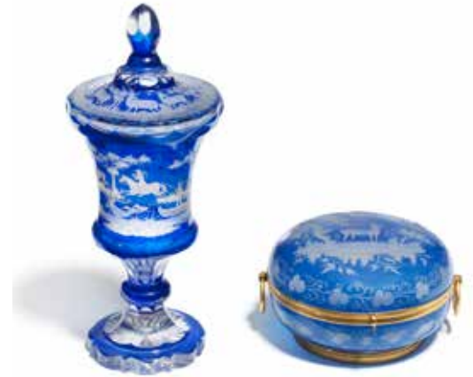
394 A BOHEMIAN BLUE FLASHED AND CUT GLASS PEDESTAL CUP AND COVER AND A GILT BRASS MOUNTED BLUE FLASHED GLASS CIRCULAR BOX AND COVER probably early 20th century 33cm high and 10.5cm high approximately (2) £800 - 1,200 €930 - 1,400