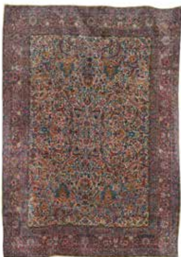
451 A KIRMAN RUG SOUTH EAST PERSIA,

TP Central Persia, 342cm x 254cm £600 - 800 €700 - 930