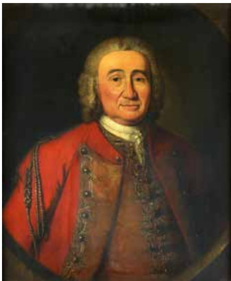
63 *ENGLISH SCHOOL, 18TH CENTURY Portrait of a gentleman in military uniform oil on canvas 75.6 x 63.5cm (29 3/4 x 25in). £1,000 - 1,500 €1,200 - 1,700