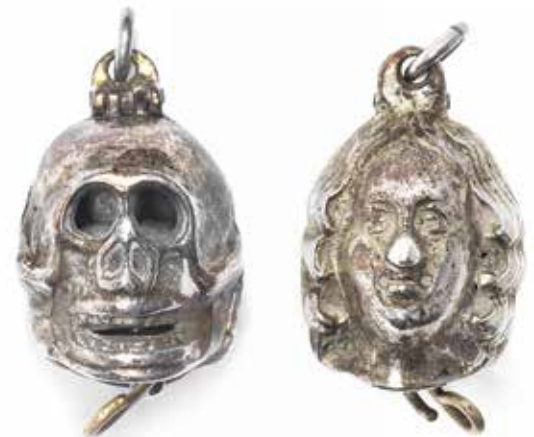
198 A 17TH CENTURY SILVER MOMENTO MORI SPICE BOX unmarked One side cast as a skull, the other as the face, opening to reveal the interior cover and four compartments, height 2.5cm. £500 - 700 €580 - 810