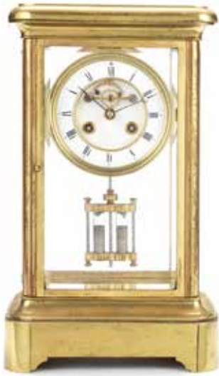
536 A LATE 19TH / EARLY 20TH CENTURY FRENCH LACQUERED BRASS FOUR GLASS MANTEL CLOCK the 4" enamel Roman dial with recessed centre and exposed Brocot type escapement, the brass twin train movement striking on a bell, with Mercury pendulum, 35cm high £500 - 800 €580 - 930