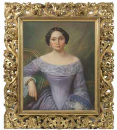
27 FRENCH SCHOOL, EARLY 19TH CENTURY Portrait of a lady pastel on paper 73.2 x 60cm (28 13/16 x 23 5/8in). £2,000 - 3,000 €2,300 - 3,500