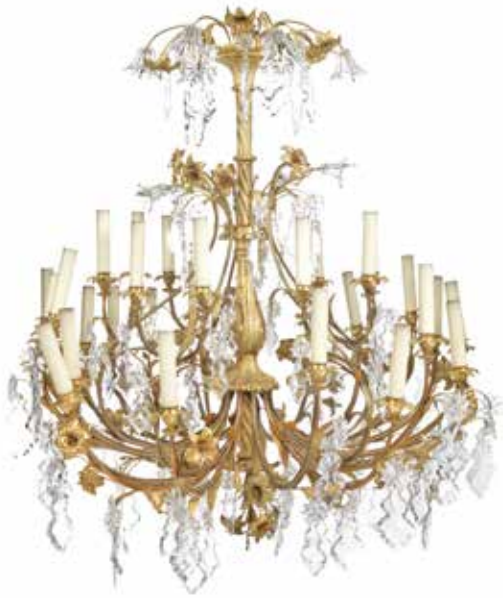
483 AN IMPRESSIVE THIRTY LIGHT GILT BRASS AND TP MOULDED AND CUT GLASS CHANDELIER probably late 19th / early 20th century the lily branches in two graduated tiers issuing from a central baluster stem, all hung with glass star and faceted shaped drops, fitted for electricity, 110cm drop £1,000 - 1,500 €1,200 - 1,700 See Bonhams.com for further footnote on this lot