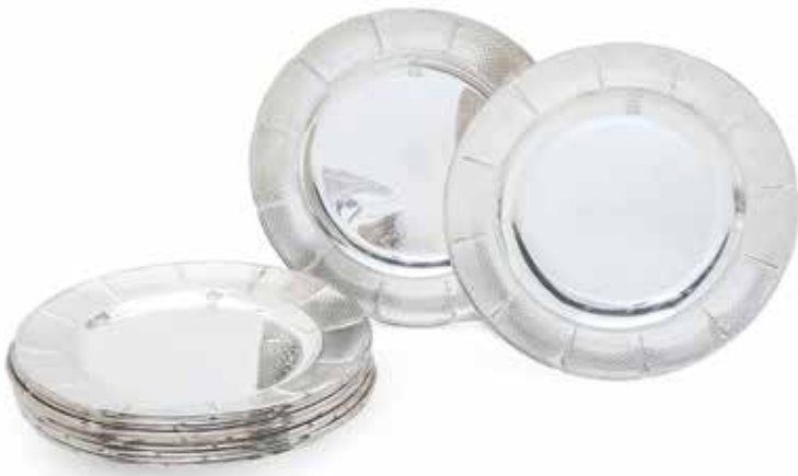
166 A VICTORIAN SET OF TWELVE DINNER PLATES by Robert Garrard II, London 1862 Shaped-circular, slight undulating engine-turned border with fluted panels, crested, underside stamped GARRARDS Panton Street London, diameter 25.4cm, weight 202oz. (12) £5,000 - 6,000 €5,800 - 7,000