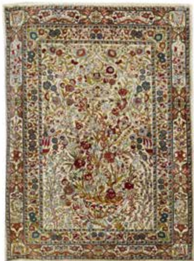
453 A SILK HEREKE PRAYER RUG

TP Central Persia, 206cm x 142cm £600 - 800 €700 - 930