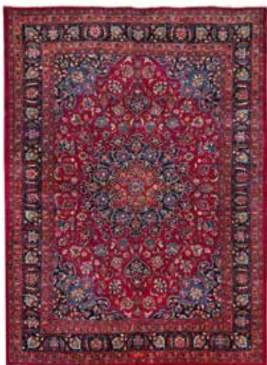
450 A MASHHAD CARPET

TP Central Persia, 342cm x 254cm £600 - 800 €700 - 930