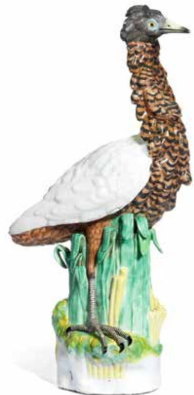
410 A LATE 19TH CENTURY / EARLY 20TH CENTURY CONTINENTAL PORCELAIN MODEL OF A LARGE WATER BIRD in the Meissen style, the bird with long grey beak, ruffled brown striped chest feathers and long striped legs on naturalistic bamboo base, with underglaze blue crossed swords factory mark to the edge of the base, 62cm high £600 - 800 €700 - 930