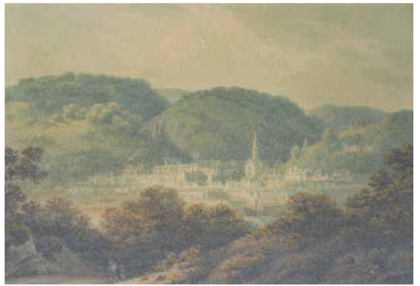
33 JOHN WARWICK SMITH (BRITISH, 1749-1831) Approach to Lostwithiel from Liskeard bears inscription (on reverse) watercolour on paper laid down 14.3 x 20.5cm (5 5/8 x 8 1/16in). unframed £600 - 800 €700 - 930