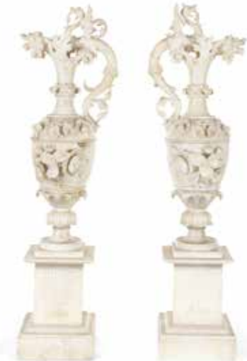
516 A PAIR OF LATE 19TH / EARLY 20TH CENTURY TP ITALIAN CARVED ALABASTER GARNITURE URNS of pedestal urn form with elaborate Renaissance style griffin high scrolling handles and grotesque maskhead spouts, raised on rectangular plinth bases, 97cm high (2) £800 - 1,200 €930 - 1,400