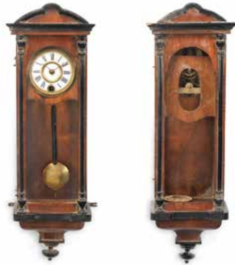
529 A LATE 19TH / EARLY 20TH CENTURY STAINED AND EBONISED WOOD VIENNA STYLE MINIATURE WALL TIMEPIECE of typical form with 3" two part Roman enamel dial with brass single train movement and pendulum, together with a similar miniature timepiece now lacking dial and as found, each 54cm high approximately (2) £1,000 - 1,500 €1,200 - 1,700