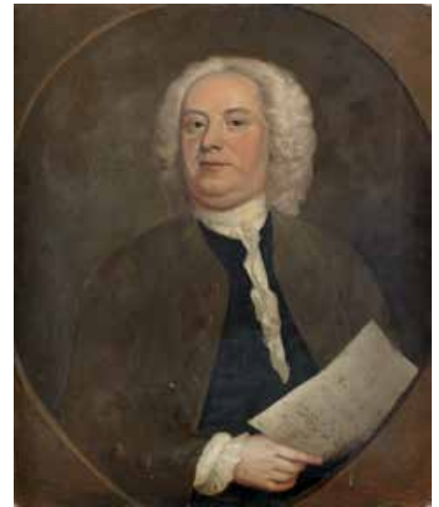
62 ENGLISH SCHOOL, CIRCA 1760 Portrait of Johann Sebastian Bach holding a sheet of music oil on canvas 76.2 x 63.2cm (30 x 24 7/8in). unframed £800 - 1,000 €930 - 1,200

See Bonhams.com for further footnote on this lot