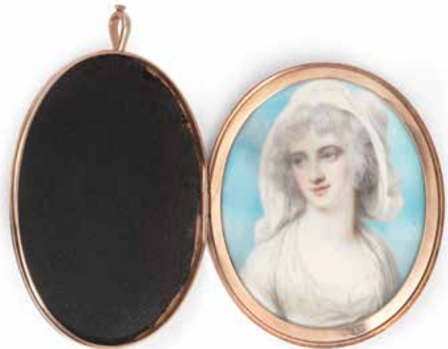
89 RICHARD COSWAY RA (BRITISH, 1742-1821) Y A Lady, wearing white dress and fichu, her powdered hair upswept beneath a white turban. Φ Ivory, in hinged gold locket frame, the reverse glazed to reveal loosely plaited hair, fitted red leather travelling case, oval, height 7.4cm (2 15/16in). £3,000 - 5,000 €3,500 - 5,800