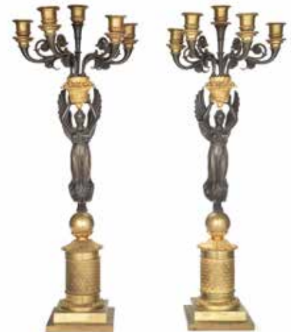
397 A PAIR OF LATE 19TH / EARLY 20TH CENTURY GILT TP AND PATINATED BRONZE FIGURAL FIVE LIGHT FIGURAL CANDELABRA in the Empire taste the scrolling arms issuing from baskets supported by classical winged figures of Victory on sphere and milled cylindrical stepped square bases, 66cm high (2) £500 - 800 €580 - 930