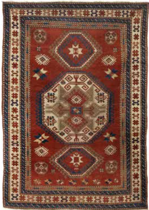
389 A LORI PAMBAK RUG TP Central Caucasus, 260cm x 186cm £2,500 - 3,000 €2,900 - 3,500