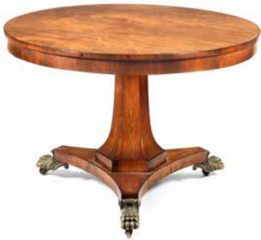
363 A GEORGE IV ROSEWOOD BREAKFAST TABLE TP the tilt-top on a flared hexagonal column, terminating in brass scrolled hairy paw feet and castors, 107cm wide x 107.5cm deep x 75cm high, (42in wide x 42in deep x 29 1/2in high) £800 - 1,200 €930 - 1,400