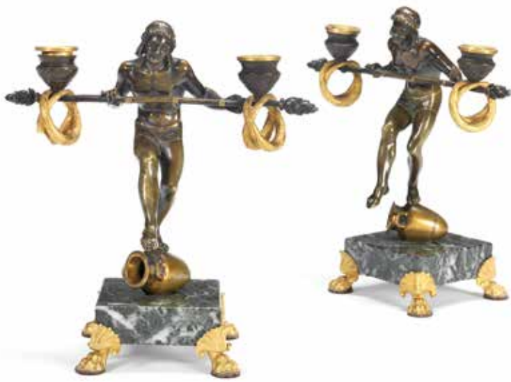
417 A PAIR OF PATINATED AND PARCEL GILT BRONZE TWIN LIGHT FIGURAL CANDELABRA in the Neo-Grec taste each formed as a classical youth standing holding a double thyrsos ended staff supporting urn nozzles and twin laurel wreaths, raised on veined green marble footed square bases, 26cm high £800 - 1,000 €930 - 1,200