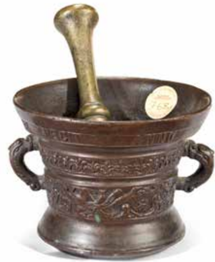
436 AN EARLY 17TH CENTURY FLEMISH PATINATED BRONZE MORTAR WITH ASSOCIATED PESTLE inscribed Henrick Ter Horst and dated 1607 of flared form with zoomorphic handles and cast with a band of fantastical birds and flowers below a fleur-de-lis border and inscription HENRICK TER HORST *ME FECIT ANNO 1607 , 14cm high, 19cm wide (2) £800 - 1,200 €930 - 1,400

See Bonhams.com for further footnote on this lot