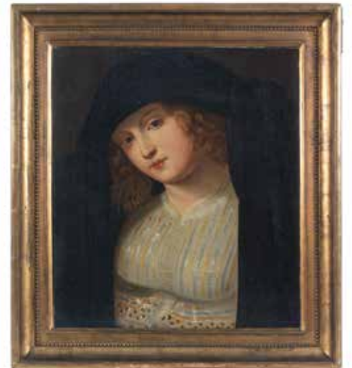
43 FOLLOWER OF SIR PETER PAUL RUBENS (FLEMISH, 1577-1640) Portrait of a lady oil on canvas 48.7 x 42.7cm (19 3/16 x 16 13/16in). £800 - 1,200 €930 - 1,400