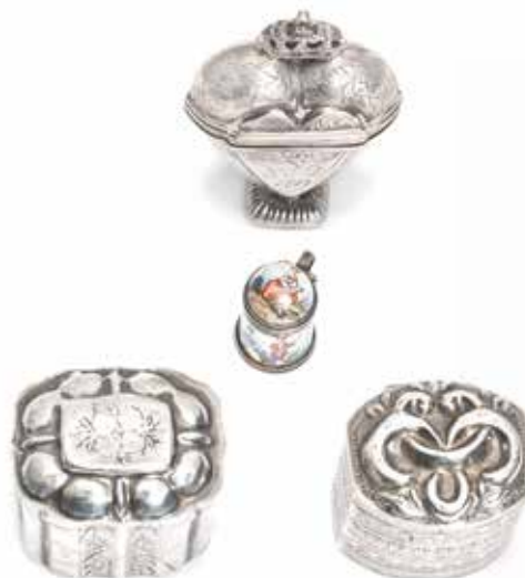
197 AN AUSTRO-HUNGARIAN SILVER AND ENAMEL VINAIGRETTE circa 1900 Modelled as a tankard, height 2.5cm ; together with two Dutch boxes and a Scandinavian luktevanhshus. (4) £500 - 700 €580 - 810