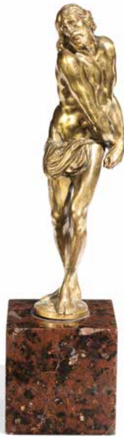
430 A GILT BRONZE FIGURE OF CHRIST AT THE COLUMN FROM A FLAGELLATION GROUP probably 17th century, German or Italian, in the manner of Alessandro Algardi and Francois Duquesnoy looking to dexter and modelled contrapposto clad in a draped perizonium, his hands bound and resting on his left hip, raised on a later marble plinth, 34.5cm high £500 - 800 €580 - 930