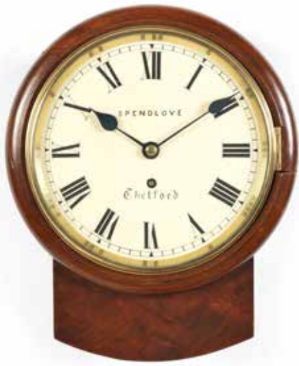
533 A GOOD 19TH CENTURY SMALL MAHOGANY DROP DIAL TIMEPIECE the dial signed Spendlove, Thetford the 7.5" painted Roman dial with blued steel hands and moulded bezel, the four-pillar gut fusee movement with anchor escapement, with pendulum, 33cms high £800 - 1,200 €930 - 1,400