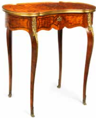
323 A FRENCH 19TH CENTURY GILT BRONZE MOUNTED BOIS SATINE AND ROSEWOOD MARQUETRY AND PARQUETRY OCCASIONAL TABLE Y inlaid with scrolling strapwork and stylised foliage, with one frieze drawer, on cabriole legs, 72cm wide x 42.5cm deep x 75cm high, (28in wide x 16 1/2in deep x 29 1/2in high) £700 - 900 €810 - 1,000