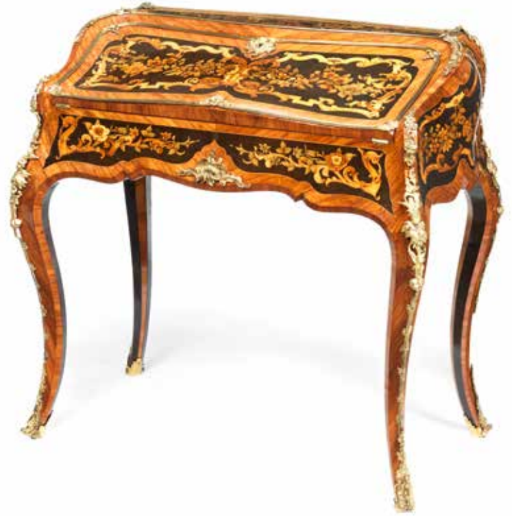
358 AN EARLY VICTORIAN GILT BRONZE MOUNTED KINGWOOD, EBONISED, STAINED TP SYCAMORE AND MARQUETRY BUREAU EN PENTE probably retailed by Edward Holmes Baldock inlaid with ribbon-tied floral and foliate swags within scrolled acanthus cartouche borders, enclosing a kingwood interior with three short drawers and two wells with sliding lids, 87cm wide x 49cm deep x 87cm high, (34in wide x 19in deep x 34in high) £4,000 - 6,000 €4,600 - 7,000 See Bonhams.com for further footnote on this lot