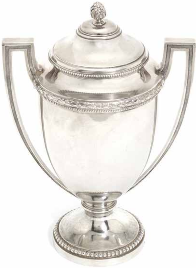
193 A 20TH CENTURY FRENCH SILVER VASE AND COVER by Emile Puiforcat, first standard marks Urn-form on a circular foot, the borders with beading and laurel-and-berry, with two angular handles, the domed cover with a bud finial, height 24.5cm, weight 31.5oz. £500 - 700 €580 - 810