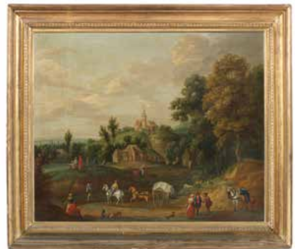
12 FOLLOWER OF PETER TILLEMANS (ANTWERP 1684-1734 NORTON) Figures and a wagon before a village oil on canvas 63.5 x 75.2cm (25 x 29 5/8in). £1,200 - 1,800 €1,400 - 2,100

See Bonhams.com for further footnote on this lot