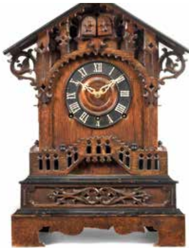
539 A RARE LATE 19TH CENTURY QUARTER STRIKING TP 'CUCKOO AND QUAIL' TABLE CLOCK retailed by Camerer Cuss & Co, London the movement with pierced brass plates, going barrel to an anchor escapement and twin fusees to the hour and quarter trains, the birds appearing on the quarters and hours, sounding on bellows and gongs, 55cms high £800 - 1,200 €930 - 1,400